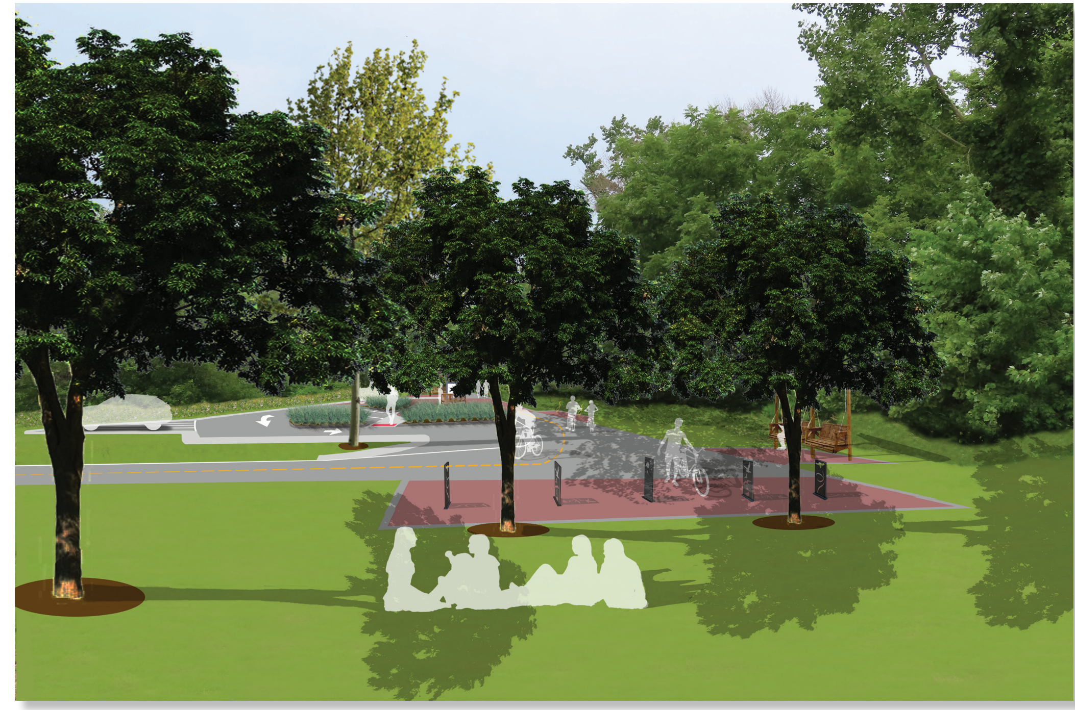
Photo edit 4g: Enhancements proposed consider user comfort as well as maintenance