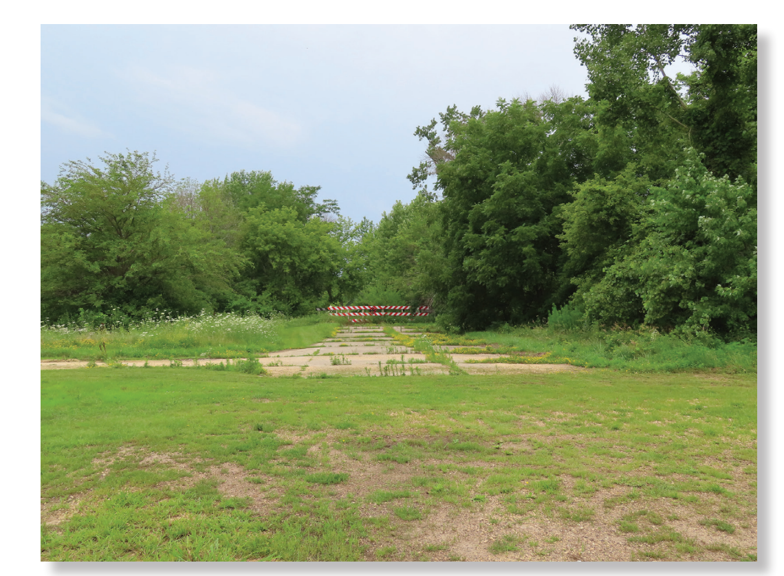
Existing photo 4f: Photo taken from eastern end looking westerly toward the trestel bridge