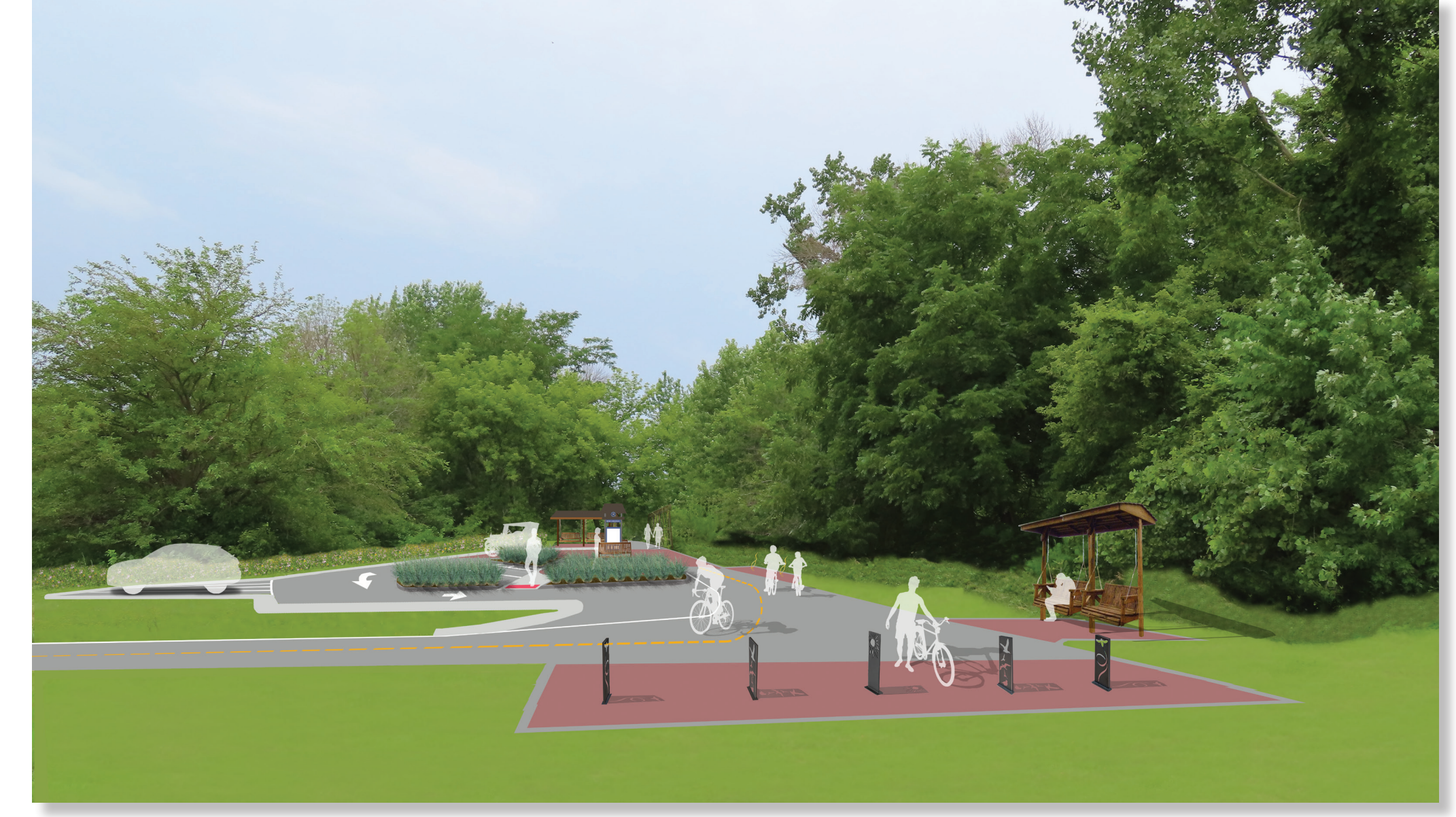
Photo edit 4h: This illustration is the same one as above but without the trees; it should be noted that the proposed bike racks provide an "art" element when not being used