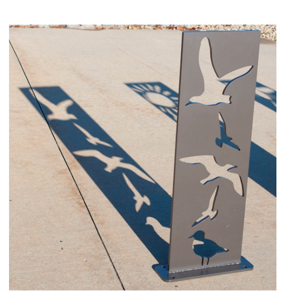
Example 4d: Nature-themed shadow bike racks