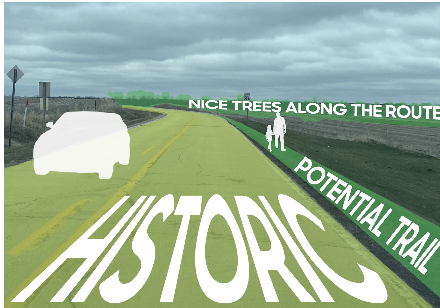
Historic Lincoln Highway serves as a connection between Wheatland and Calamus and is appreciated for the natural scenery along it.