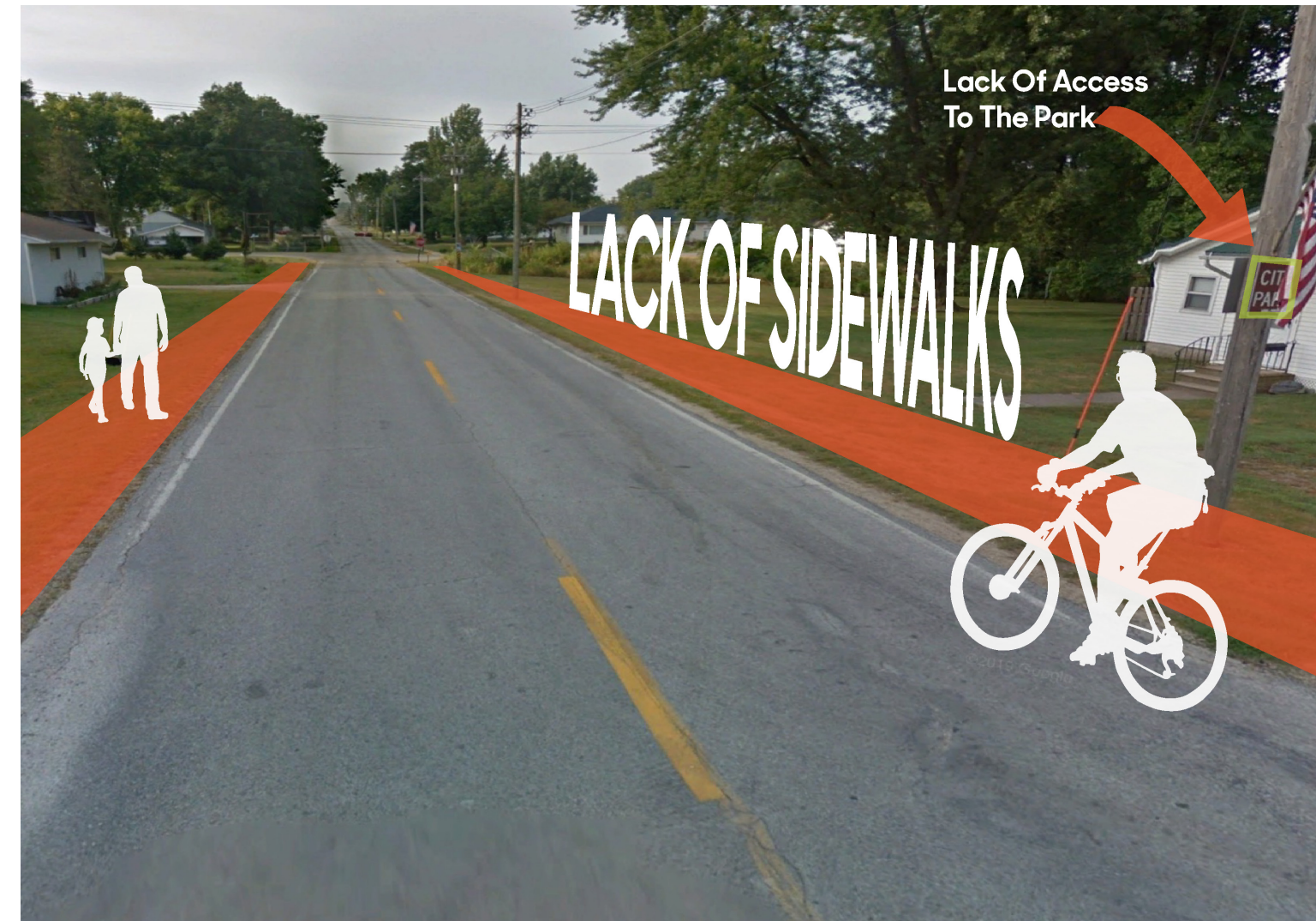
The intersection of 130th Street and Vine Street has no sidewalks nor pedestrian access to the City Park.