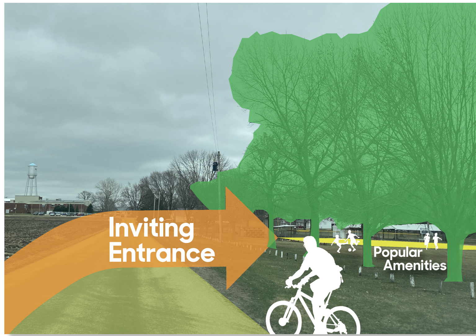
Lion's Park provides an inviting entrance into Wheatland.