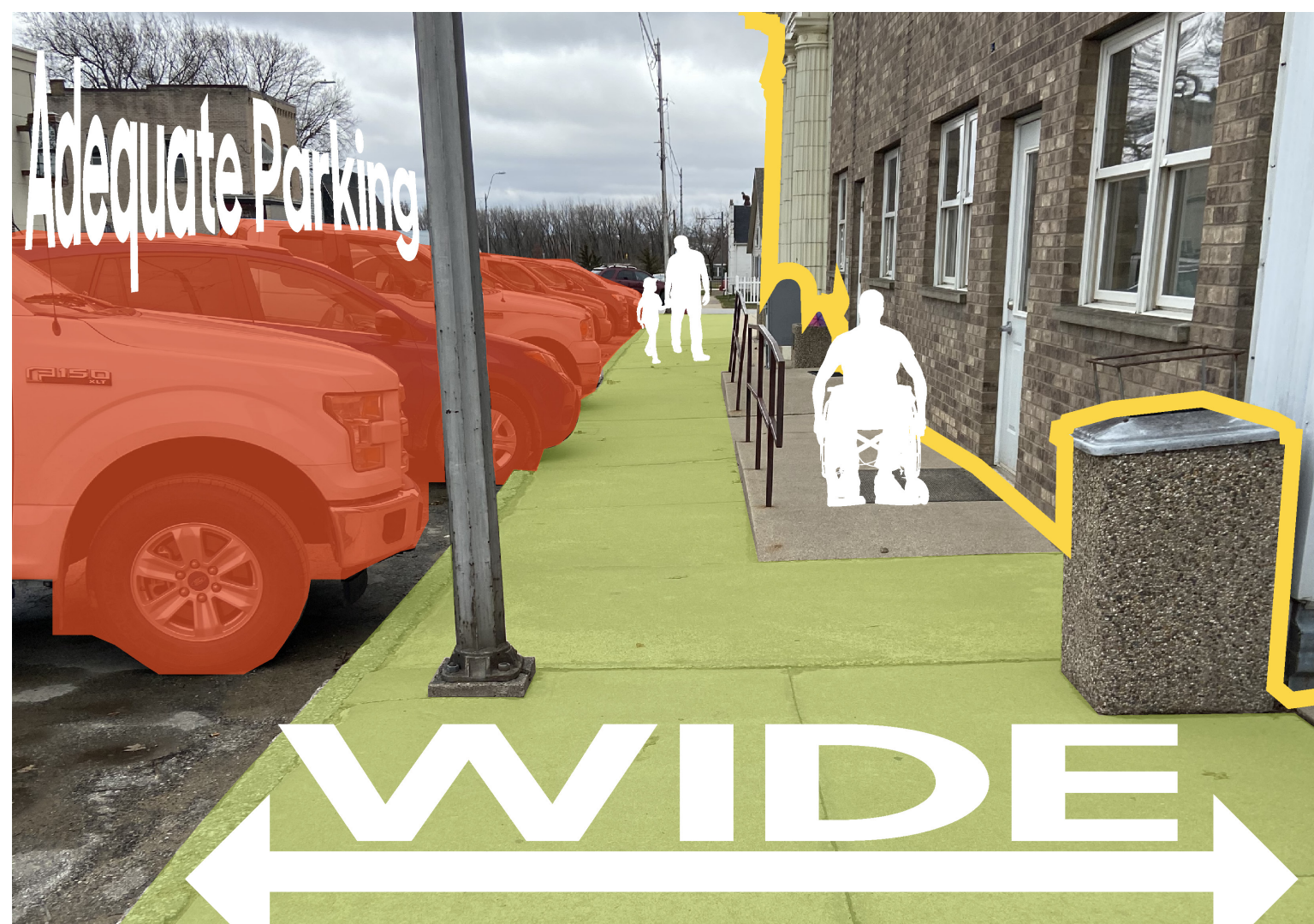
Main Street is appreciated for its wide, accessible sidewalks, parking, and businesses.