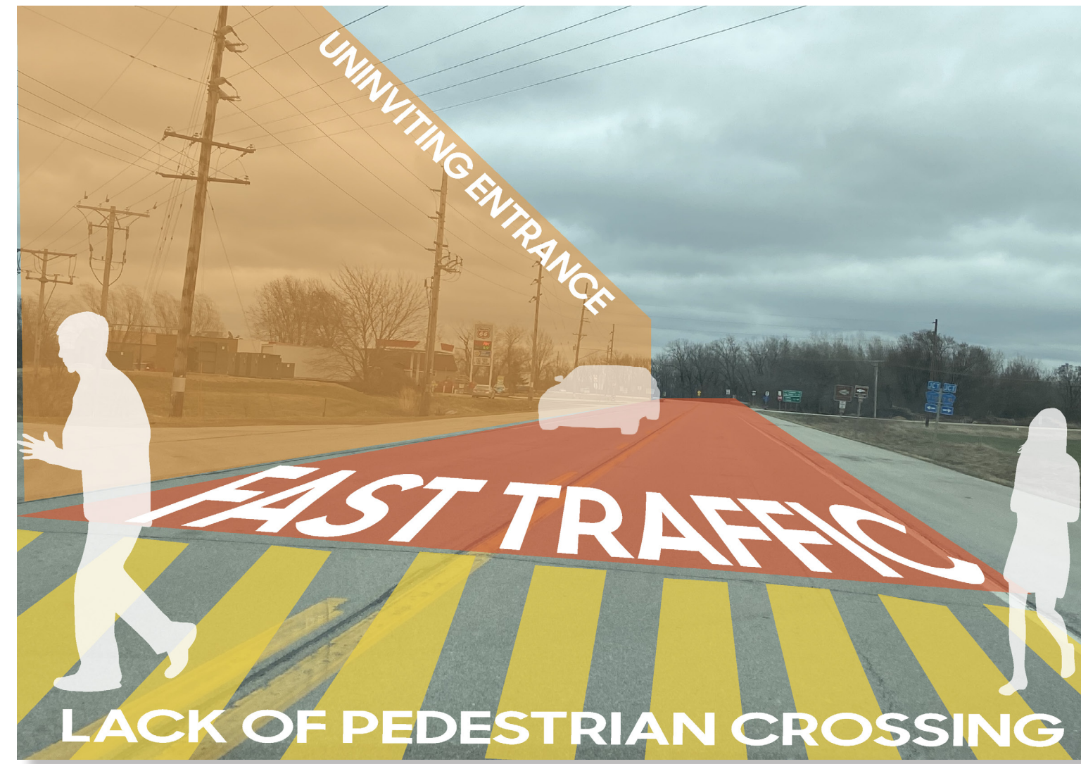
Highway 30 has fast-moving traffic and lacks pedestrian access to its businesses.