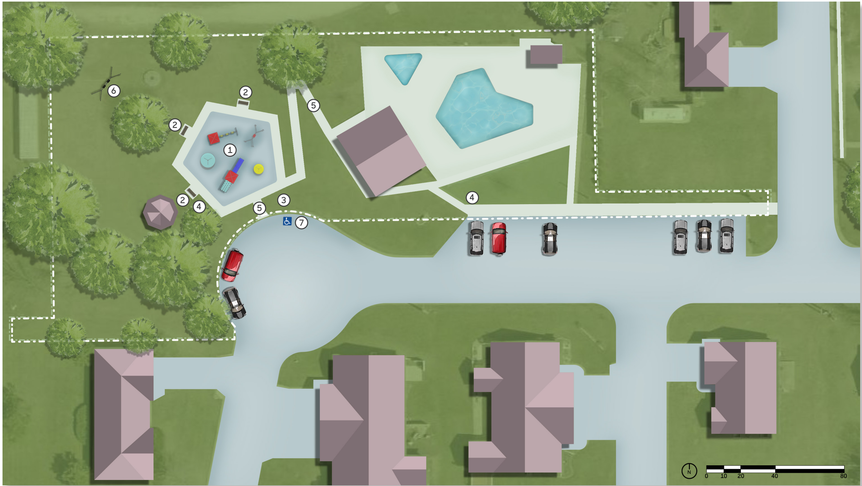
Concept plan for the proposed splash pad and pool park improvements. ① Splash pad ② Benches ③ Bicycle racks ④ Trash receptacles ⑤ ADA-accessible Sidewalks ⑥ Existing swing set to be relocated ⑦ Handicap Parking