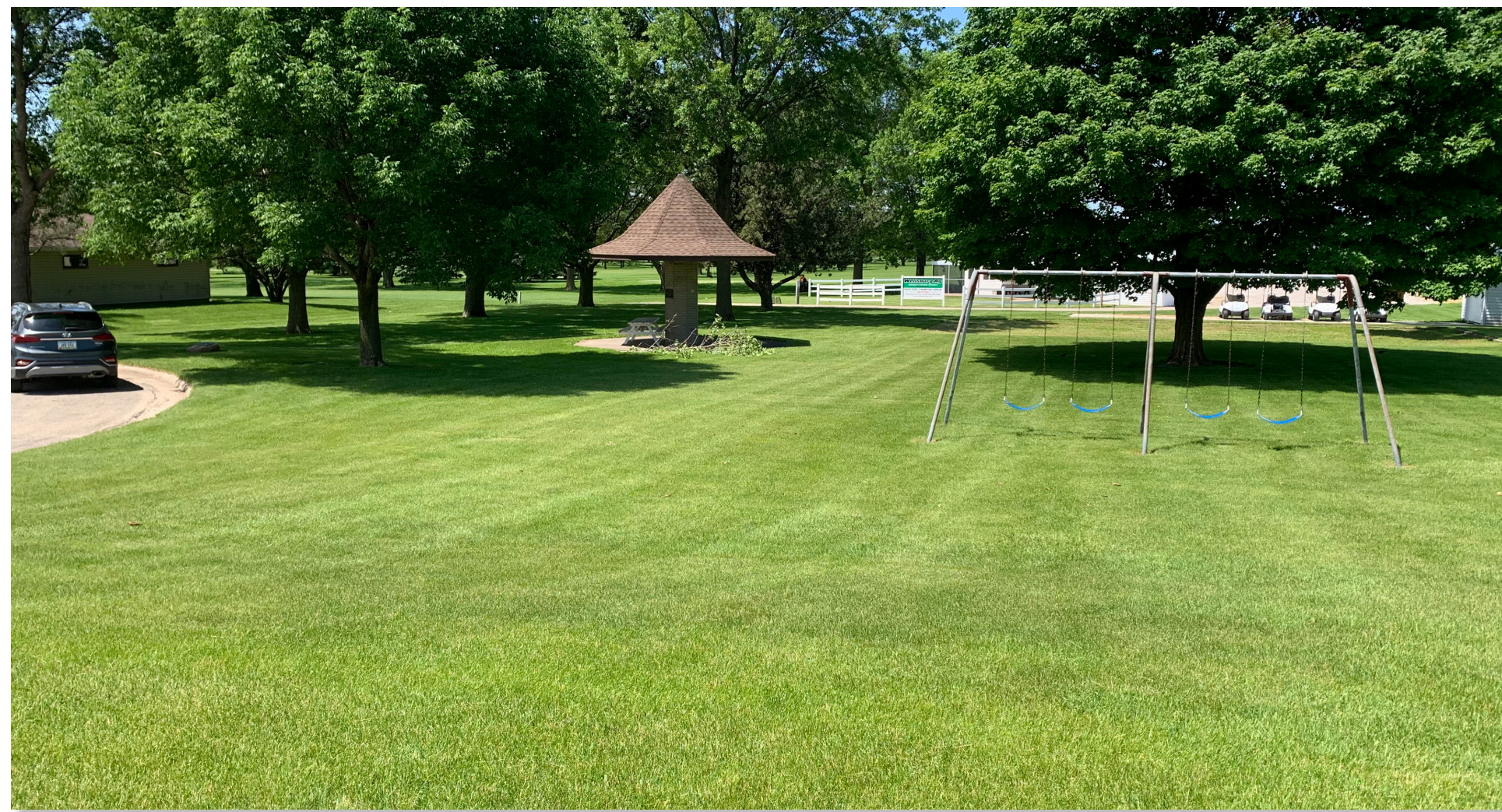
Existing conditions of location for proposed splash pad