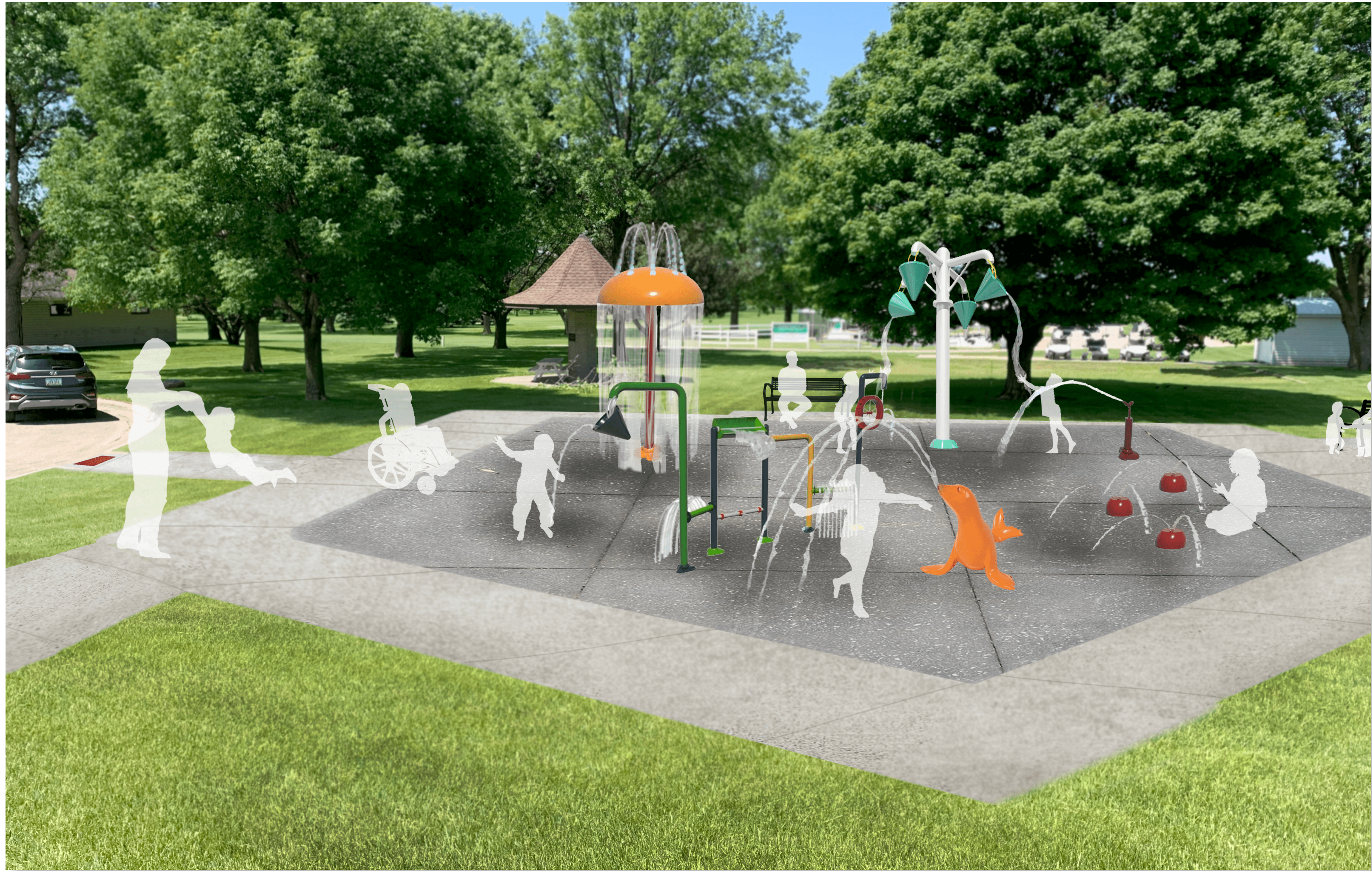
Proposed concept for a splash pad, includes benches and ADA accessible routes