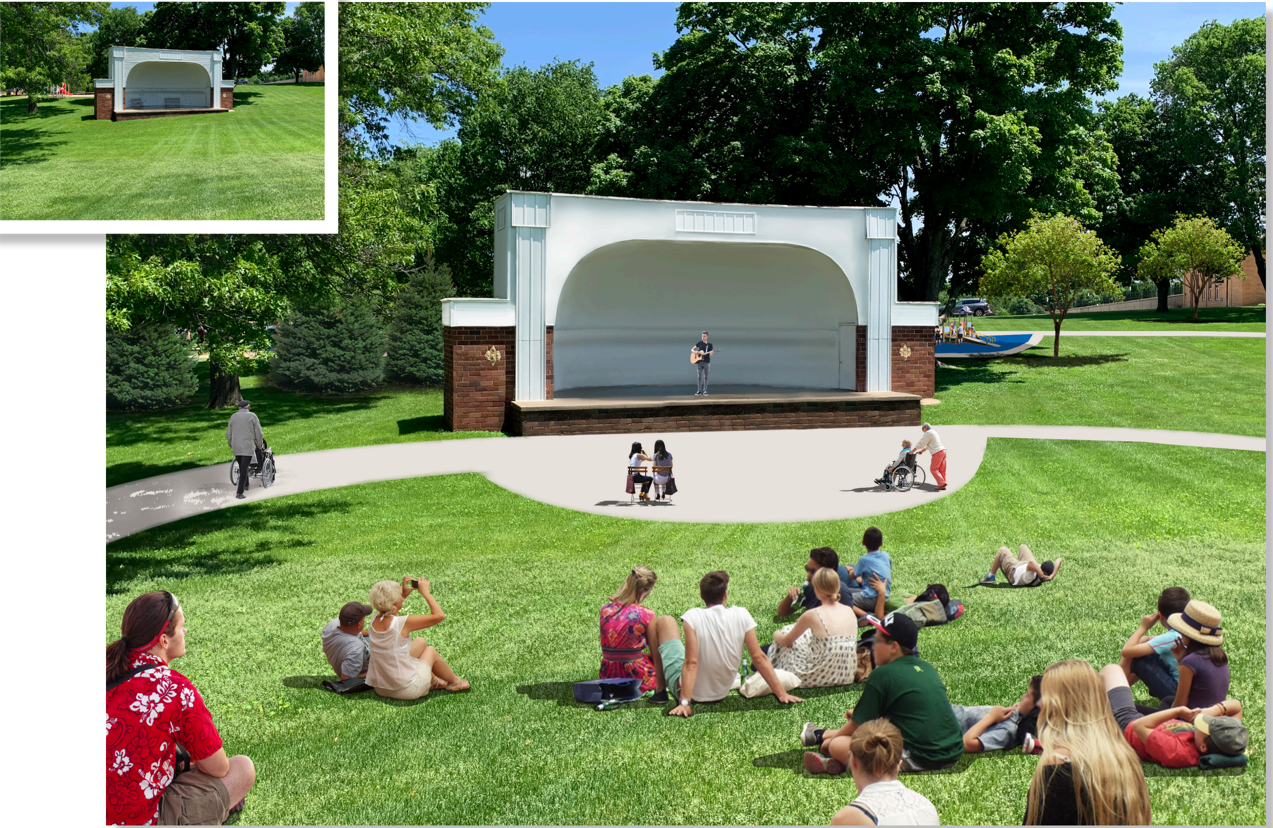
Top left: Existing band shell in Wellsburg City Park Bottom: Proposed band shell renovation with accessible seating & evergreen screen plantings

playground equipment designated for ages 2-5 and ages 5-9 replaces the existing outdated playground. The visioning committee plans to renovate the existing band shell with fundraising already underway for the project. Accessible seating is proposed, in addition to utilizing the existing grades for amphitheater-style seating on the lawn. Additional evergreen plantings behind the band shell provide a screen from the proposed playground and add to the ambience of the band shell. The committee is already working with Miracle Recreation for playground equipment and safety surfacing. The addition of paved surfacing to the equipment ensures everyone in the community has access to a fun and inviting playground.