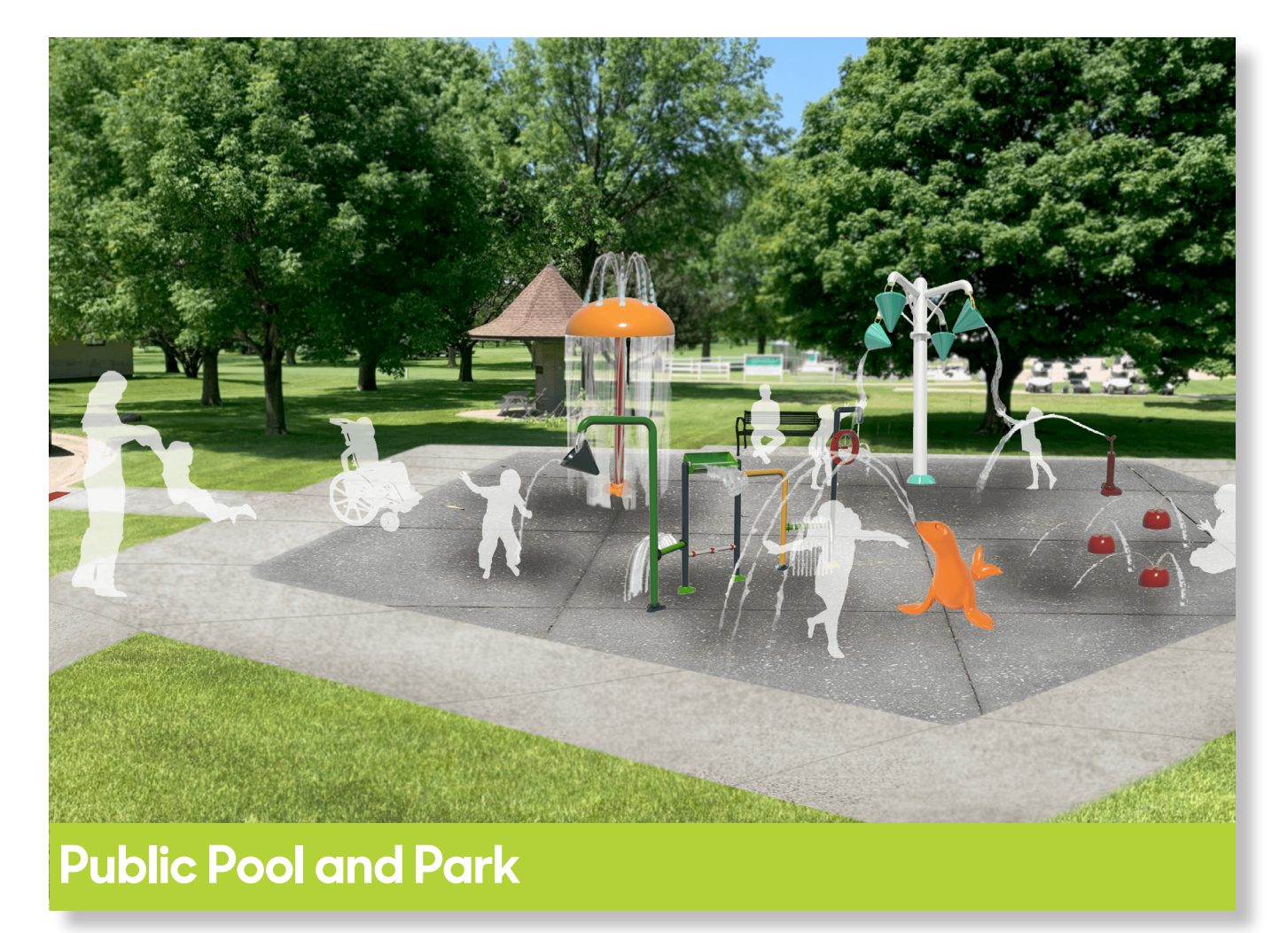
(See Pool Park Improvements, Board 11)