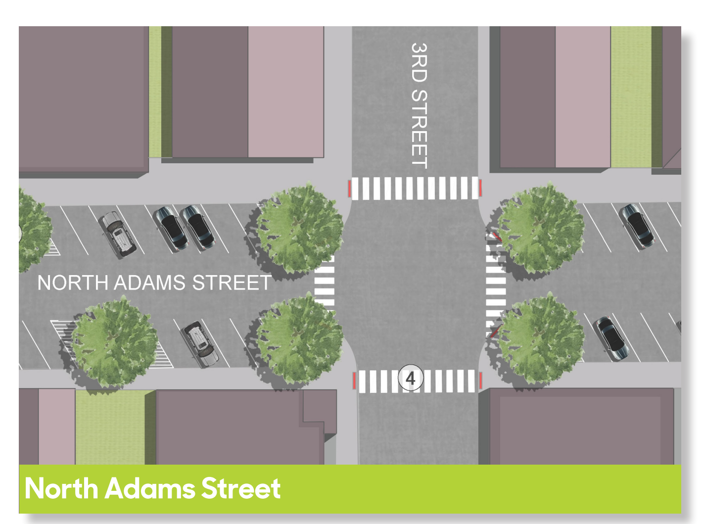
(See Downtown Improvements, Board 8)