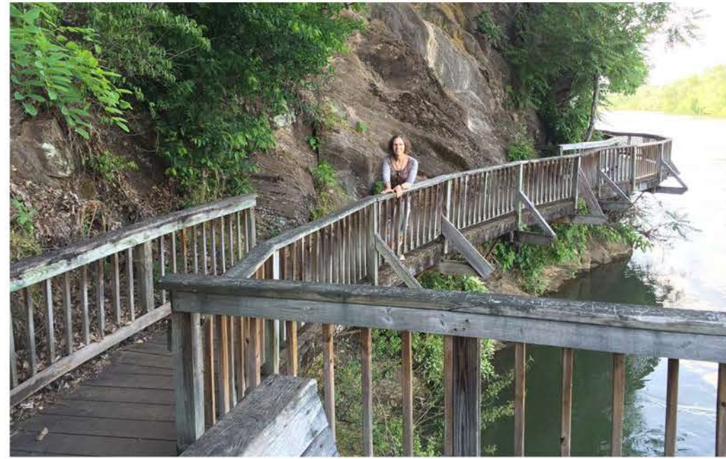
Boardwalk along the Tennessee River