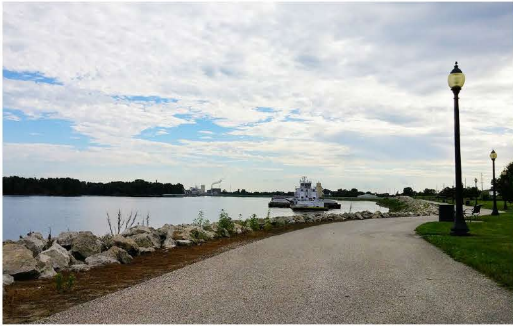
Running River Trail System Muscatine, IA