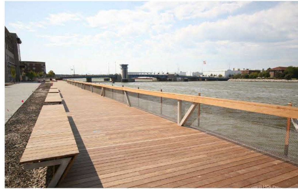
Green Bay Boardwalk Green Bay, WI