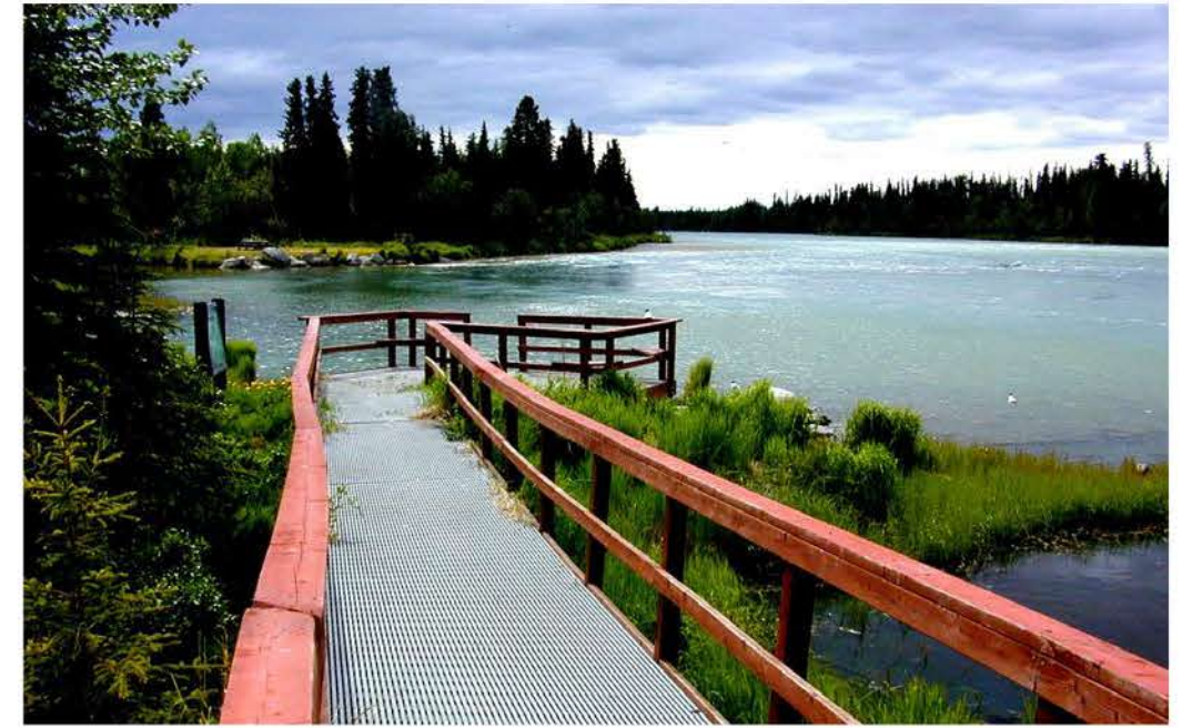
Funny River SRS Fishing Platform Kenai Peninsula Borough, AK