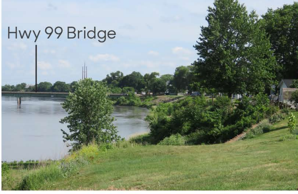
Hwy 99 Bridge Existing river view (See Riverfront Trail Proposal: A)