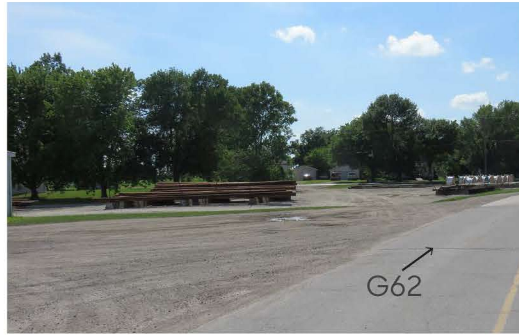
Existing Hwy 61 & G62