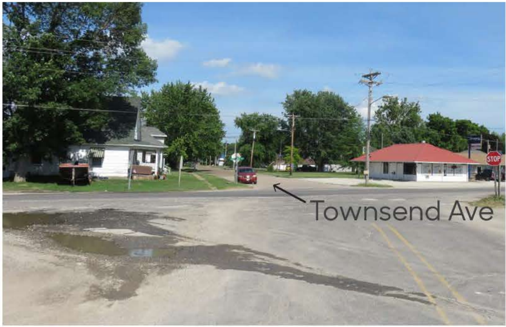
Existing Hwy 61