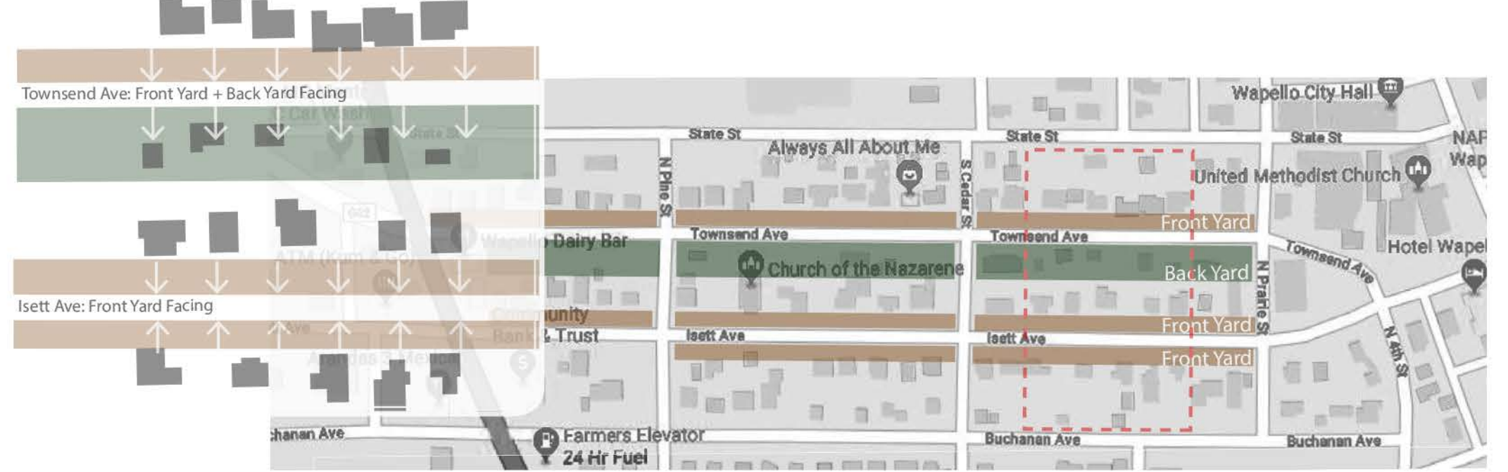
Existing condition diagrams of Townsend and Isett Avenue

“One of the biggest problems I see is on 61... some of th[ose] side streets are hard to see who’s coming and where they’re coming from, and 61 is always busy.”