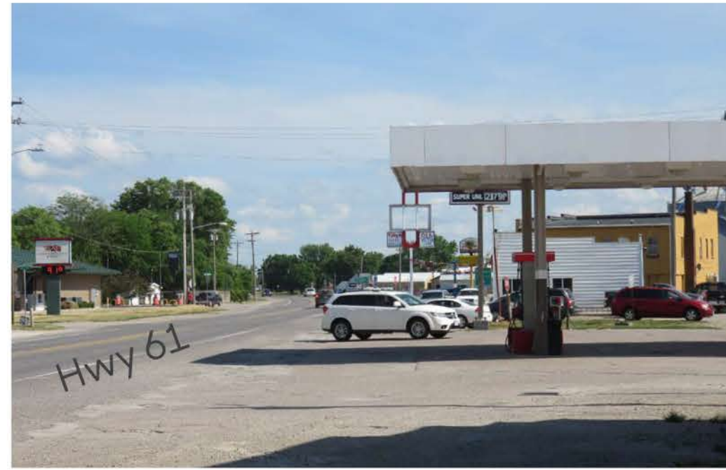
Welcome and retain new/existing businesses