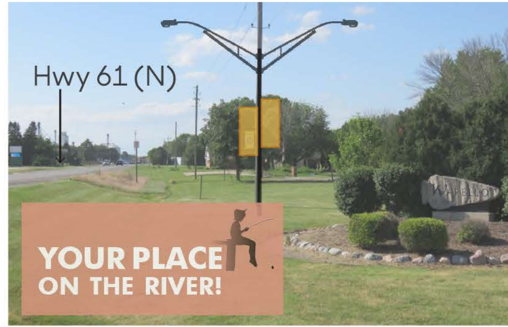
Better lighting, branding and way-finding