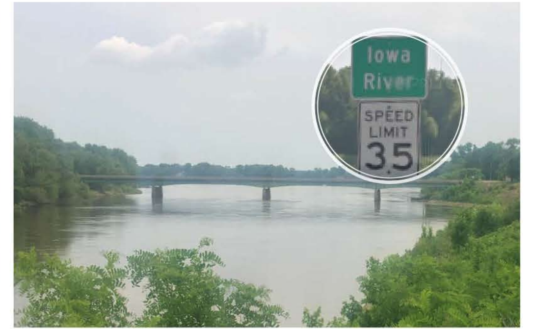
Existing Hwy 99 bridge Speed limit on Hwy 99 and 61

“Cars are traveling faster [on Highway 99]... we had a couple close calls on 99, my kids, just thinking it was another road.”