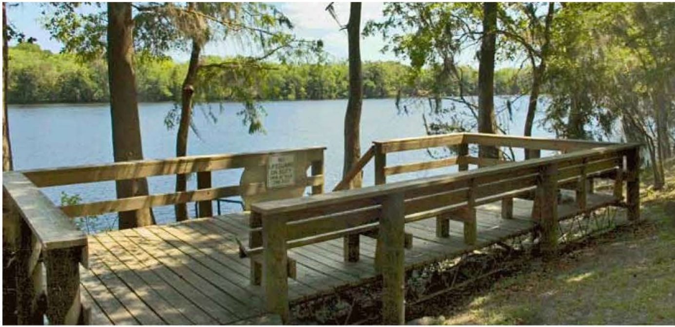
Create places to stop, rest, and take in the view: Suwannee River Hideaway Campground in Old Town, FL