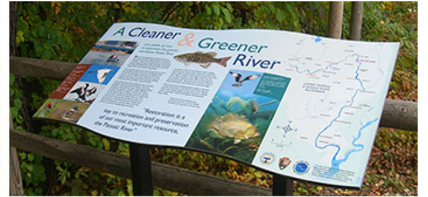
Interpretive sign: the sign illustrates the history of the area near Passaic River, NJ