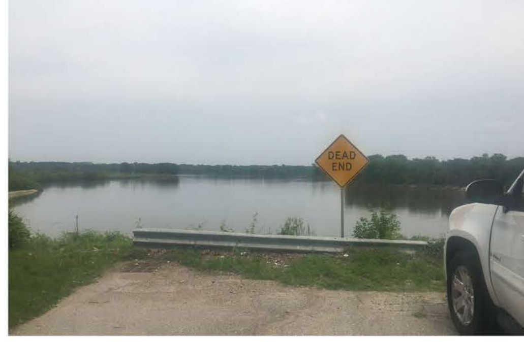
Existing dead end (See Outlook with Sitting Area: D)