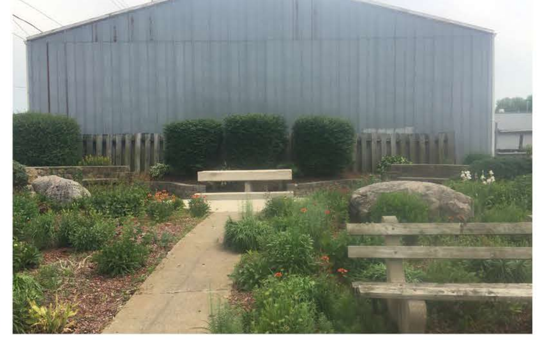
Existing pocket park

“...it's nice to be in nature when you walk because it reduce stress, but it would be nice if there was something that you could walk around along the river.”