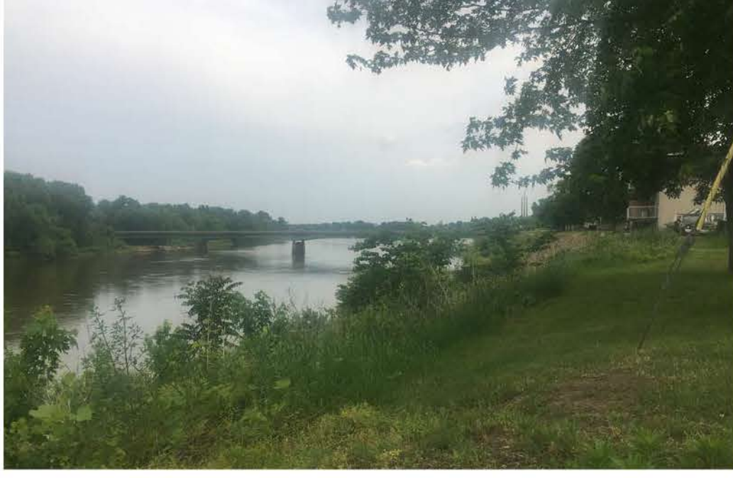
Existing view out to the bridge (See View Deck & Outlooks: B)