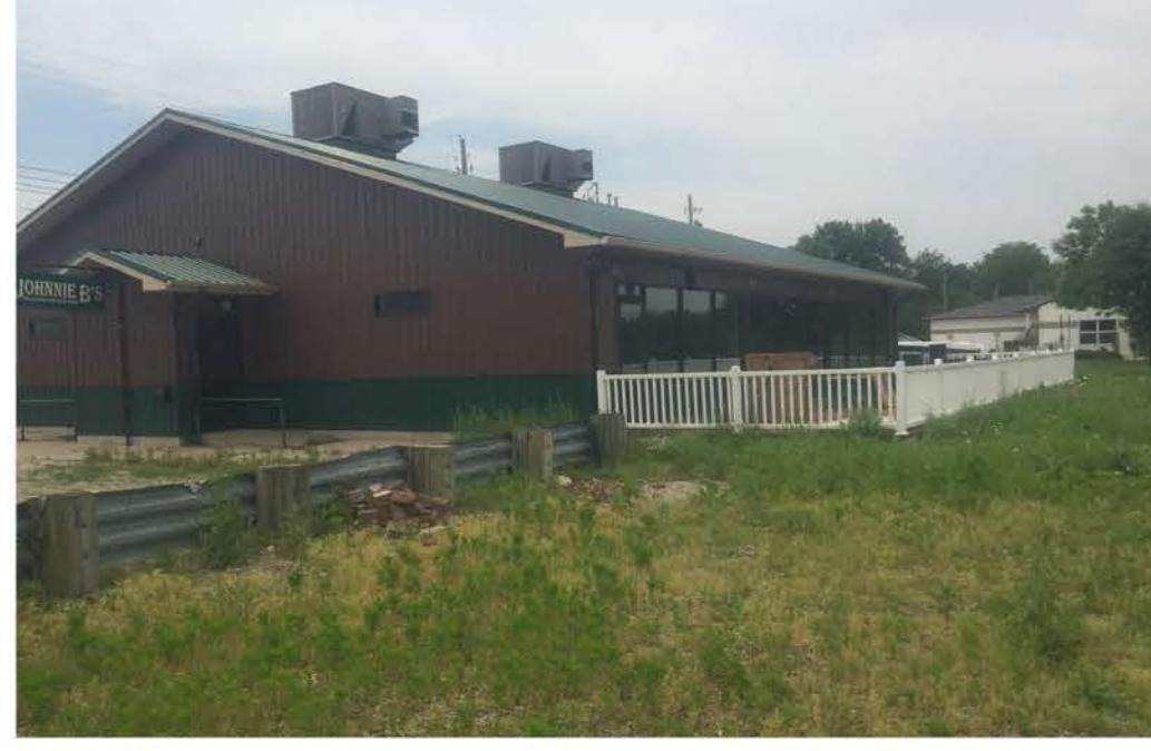
Existing Johnnie B's building (See Outdoor Cafe Connects the Existing Building: C)