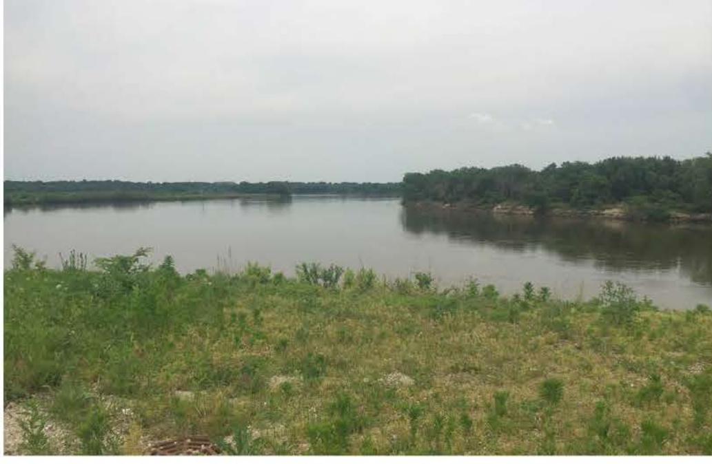
Existing view out to the river