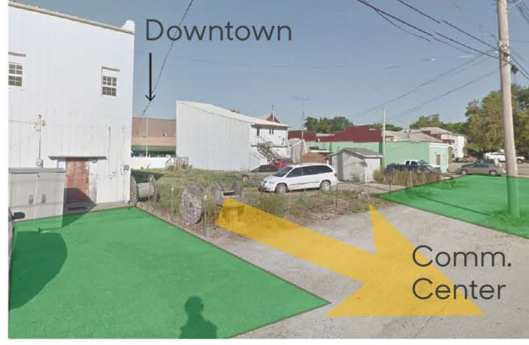
Encourage secondary "fronts" and outdoor spaces looking toward the river