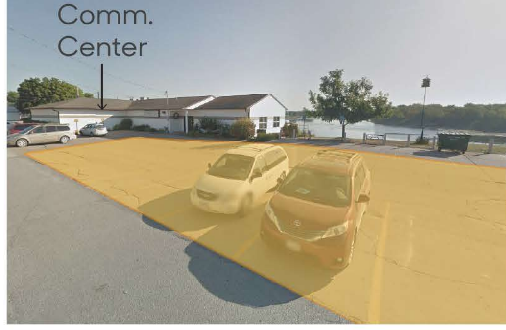
Maintain parking, but provide space for pedestrians and outdoor gathering (See Overlook Park: A)