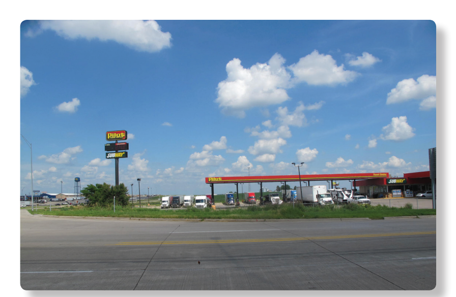
Existing I-80 eastbound Exit 284 to Walcott (looking east)

Since Y40 is a county route, the City will need to coordinate with the county before proceeding with any enhancements along this corridor.