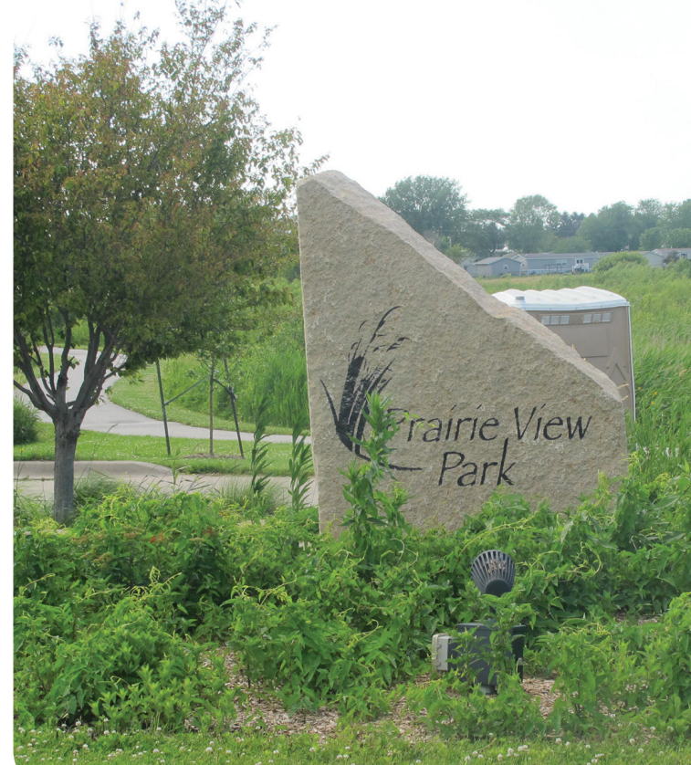
Existing park identity sign for Prairie View Park