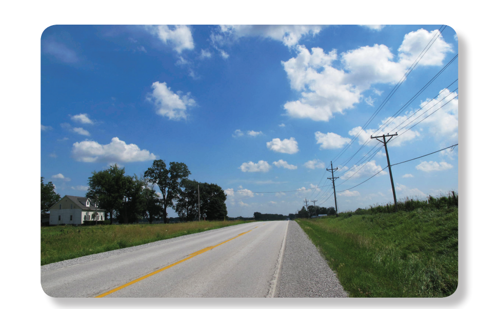
Existing 60th Avenue/Y40 corridor looking south toward Hwy. 6