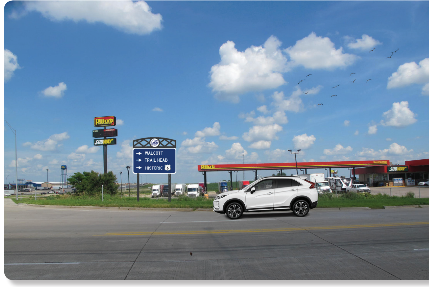
Image Edit 8a: Proposed way-finding signage at end of eastbound Exit