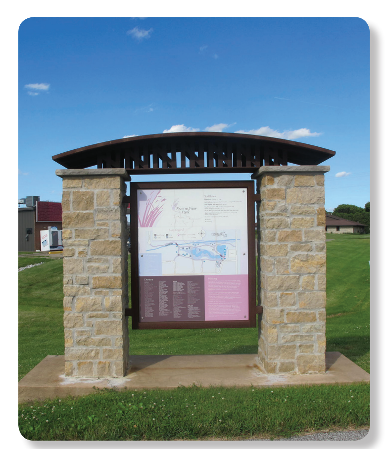
Existing informational signage in Prairie View Park

The proposed way-finding family illustrated in Figure 8a, utilizes the same materials, colors and details found in the existing signage at Prairie View Park and the new pedestrian lighting along the north end of Main Street. The city logo has also been integrated to help brand. When 2 styles are shown, one of the styles should be selected and used to keep a unified look. All signage that is located along the Highway 6 and Y40 corridors will need to follow the lowa DOT signage guidelines and be on breakaway posts.