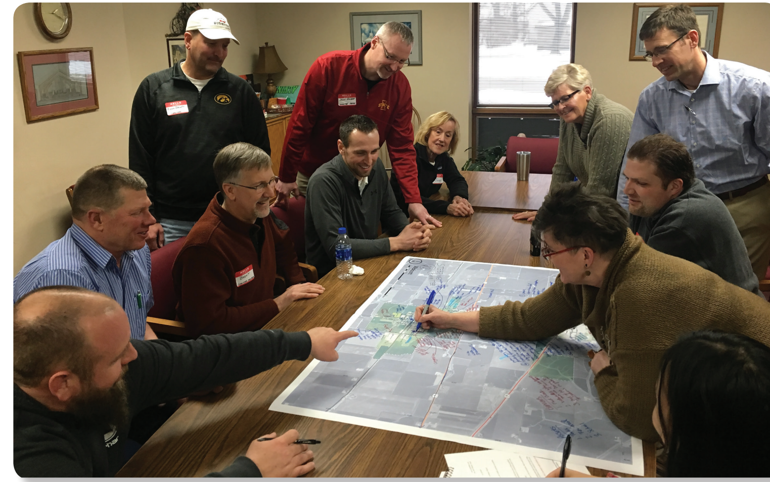
One of the various focus groups (Steering Committee) providing its input at the February 2019 TAB workshop.

Each visioning community is represented by a steering committee of local residents and stakeholders who take part in a series of meetings that are facilitated by field coordinators from Trees Forever.