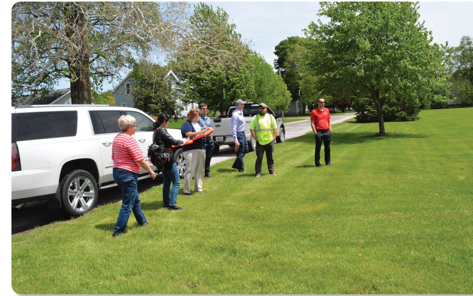
The design team and members of the steering committee review Water Tower Park during the May 2019 community tour to look at the priority project areas throughout town.

The Community Visioning program is sponsored by the Iowa Department of Transportation.