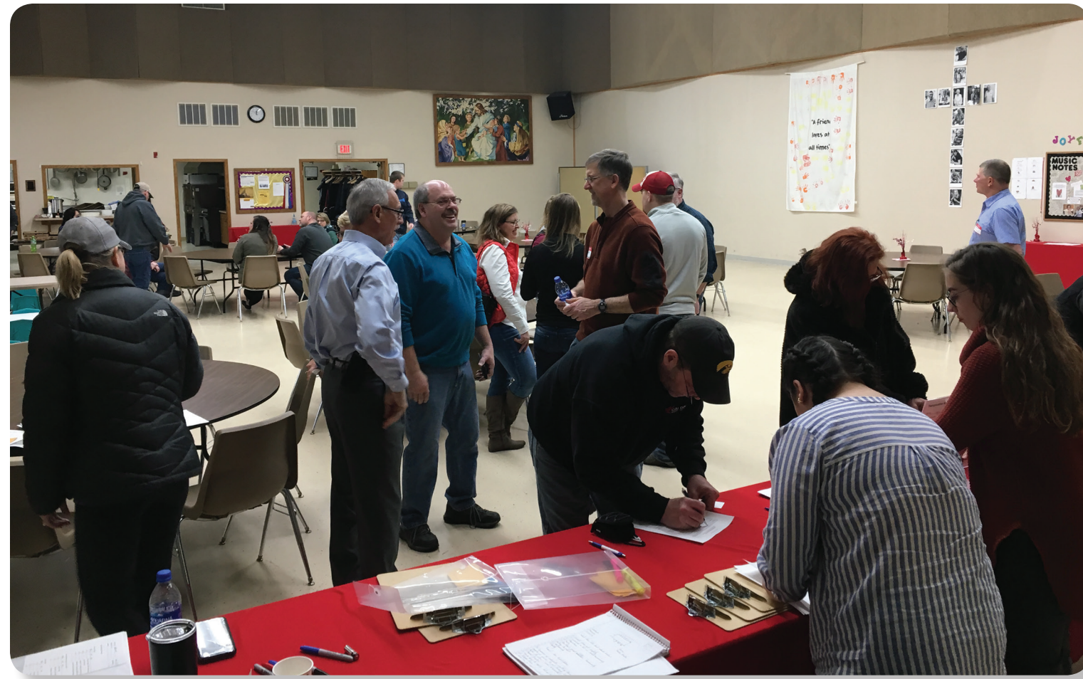
Walcott residents representing various focus groups sign in to participate in the February 2019 TAB workshop held in Walcott.