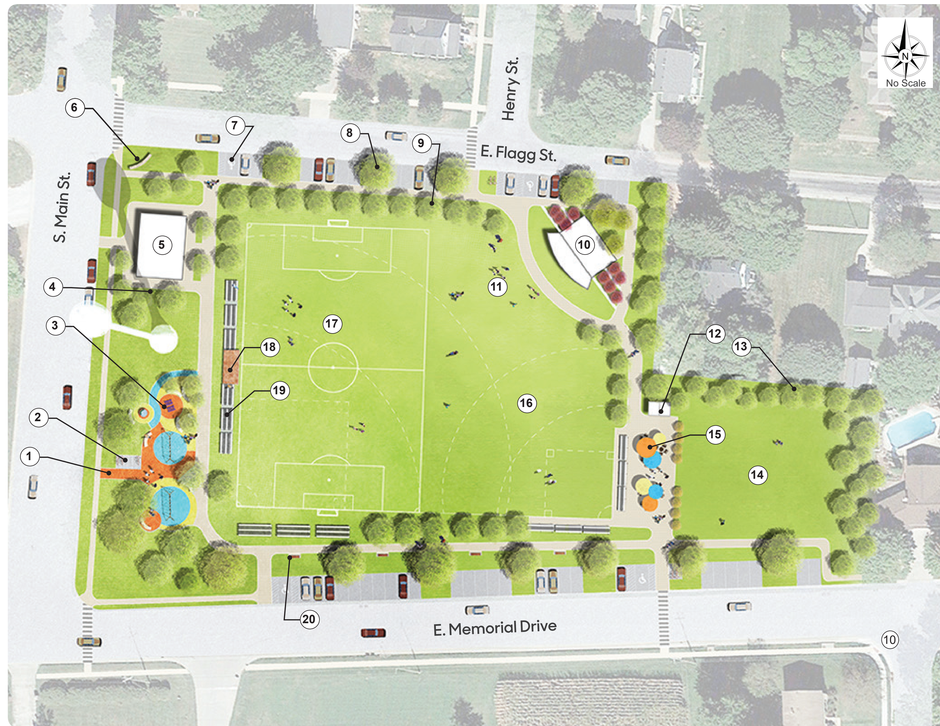
The proposed Water Tower Park Enhancement Concept Plan provides a number of different opportunities to enjoy and utilize the park

Due to the parks location, size, and layout, it provides a suitable location for an outdoor stage/bandstand. The stage/bandstand is proposed to be located on the northeast corner of the park where it will open up to the southwest in order to project any sound away from the adjacent residences. This orientation also minimizes issues with the sun being in the eyes of the spectators.