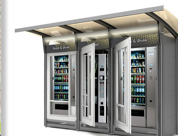
3 Vending machines