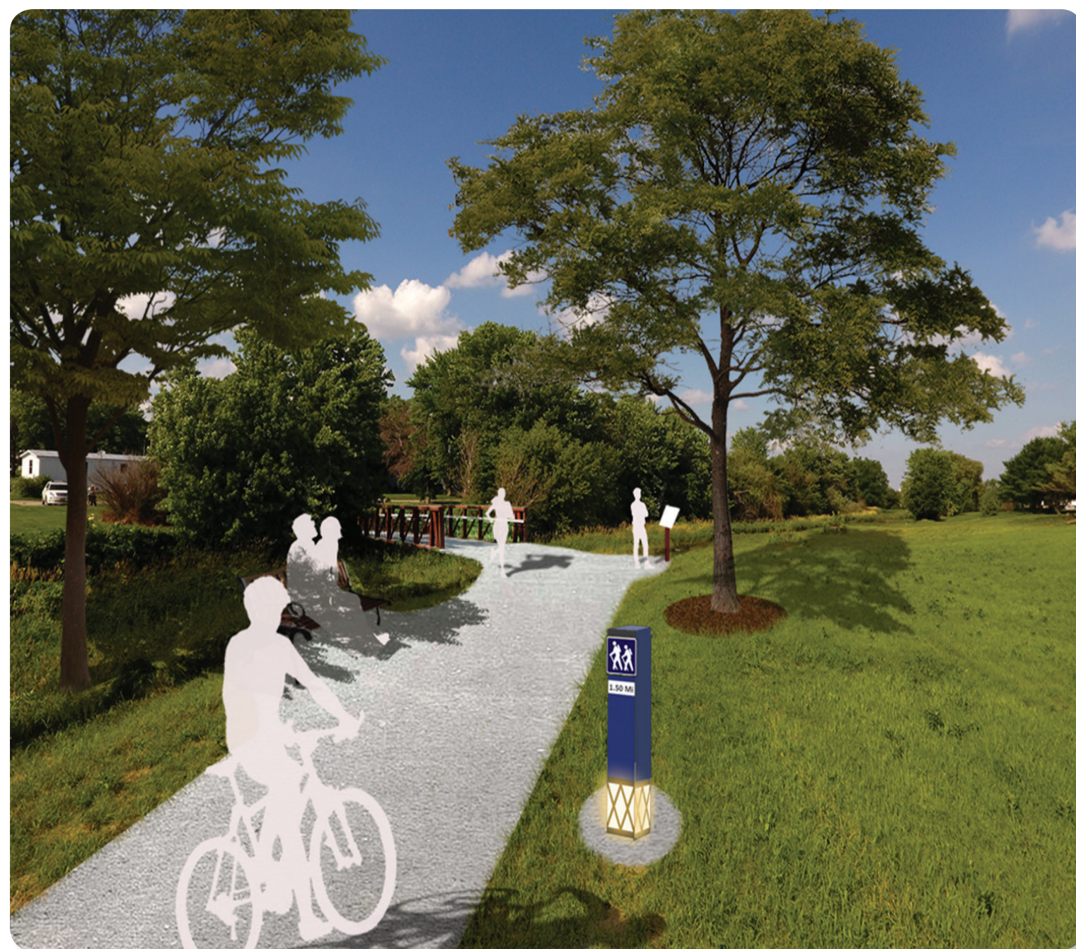
Proposed Concept illustrating trail with site amenities