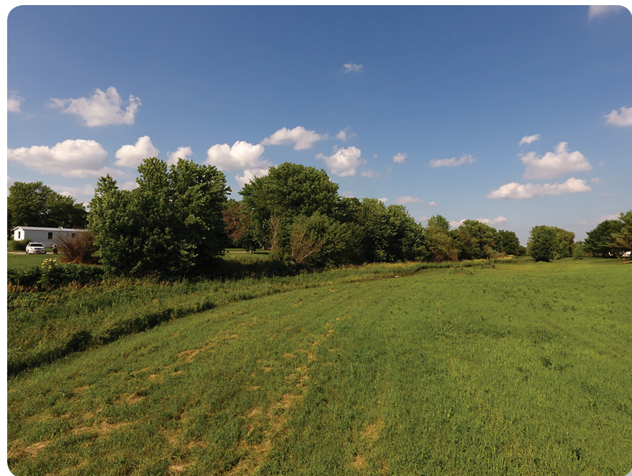
Existing photo taken south of Mud Creek (just to the west of the mobile home park), looking easterly along the creek corridor.