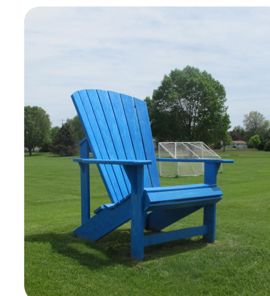
7 Large Adirondack chairs in primary colors