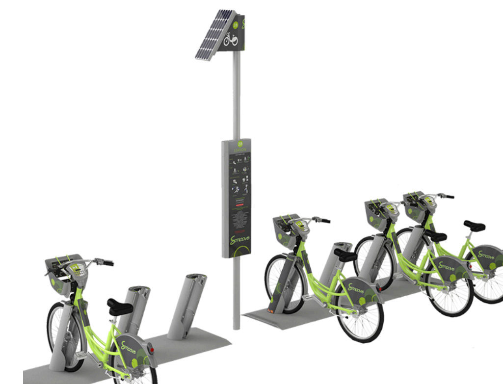
8 Rental bike station