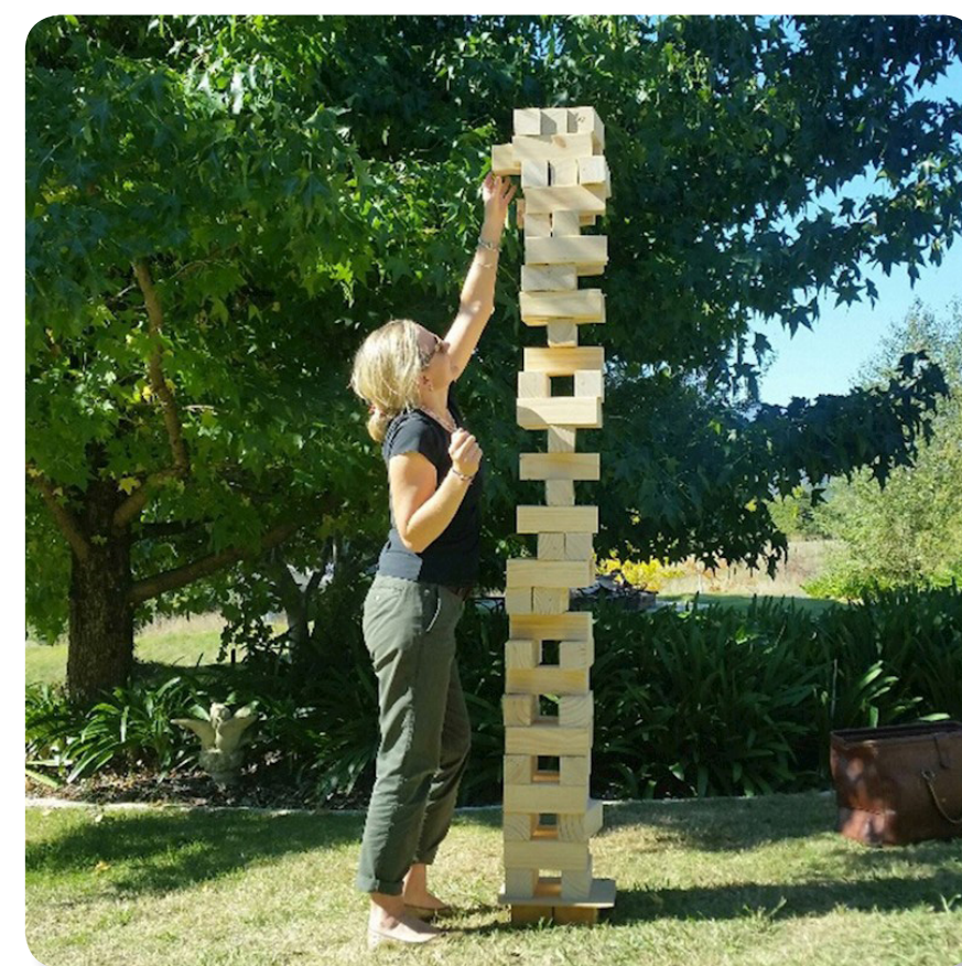
6 Large Jenga game