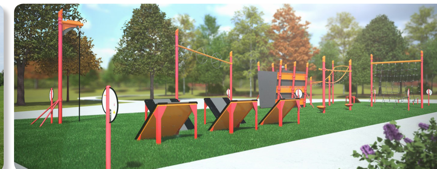
4 "Adult Playground"; install on playground surfacing (Example 1)