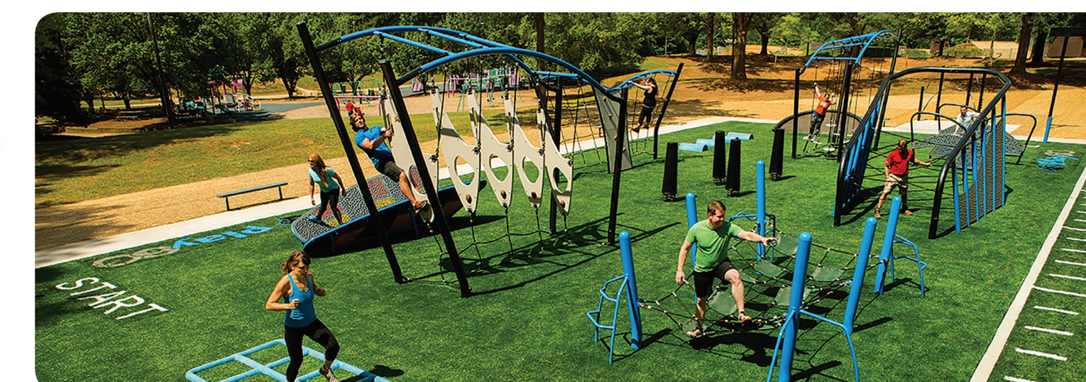
4 "Adult Playground"; install on playground surfacing (Example 2)