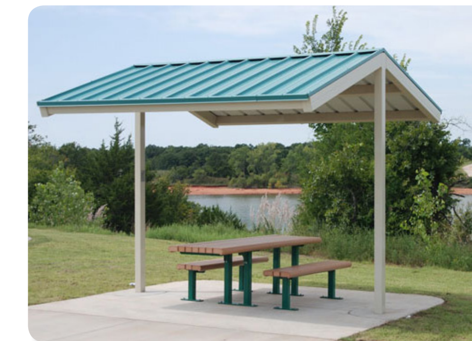
5 Single shelter to accommodate one picnic table