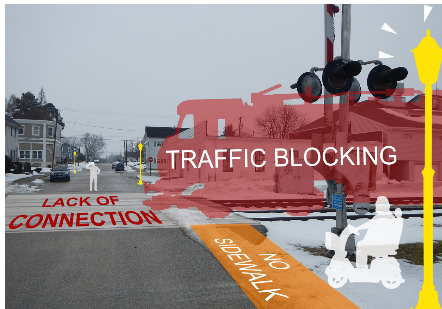
The train traffic disconnects traffic while bumpy surfaces makes crossing hard for older adults and the mobility impaired.