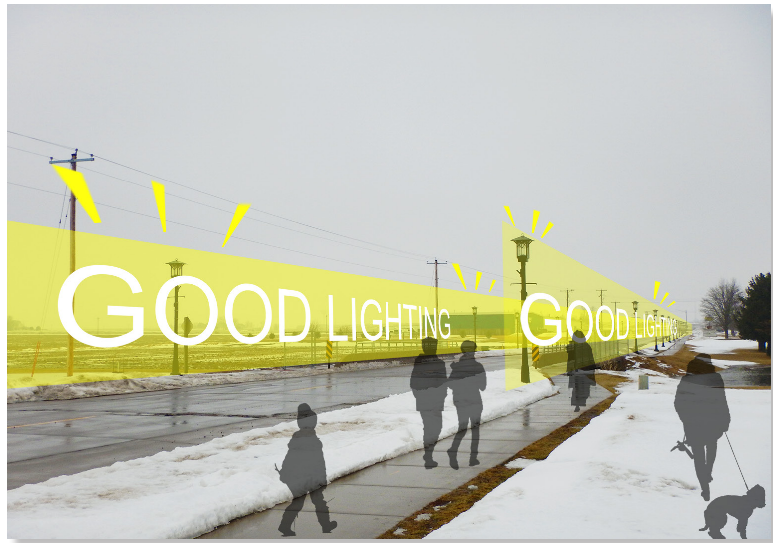
Excellent lighting and smooth sidewalks were appreciated by children, parents and the older adults.