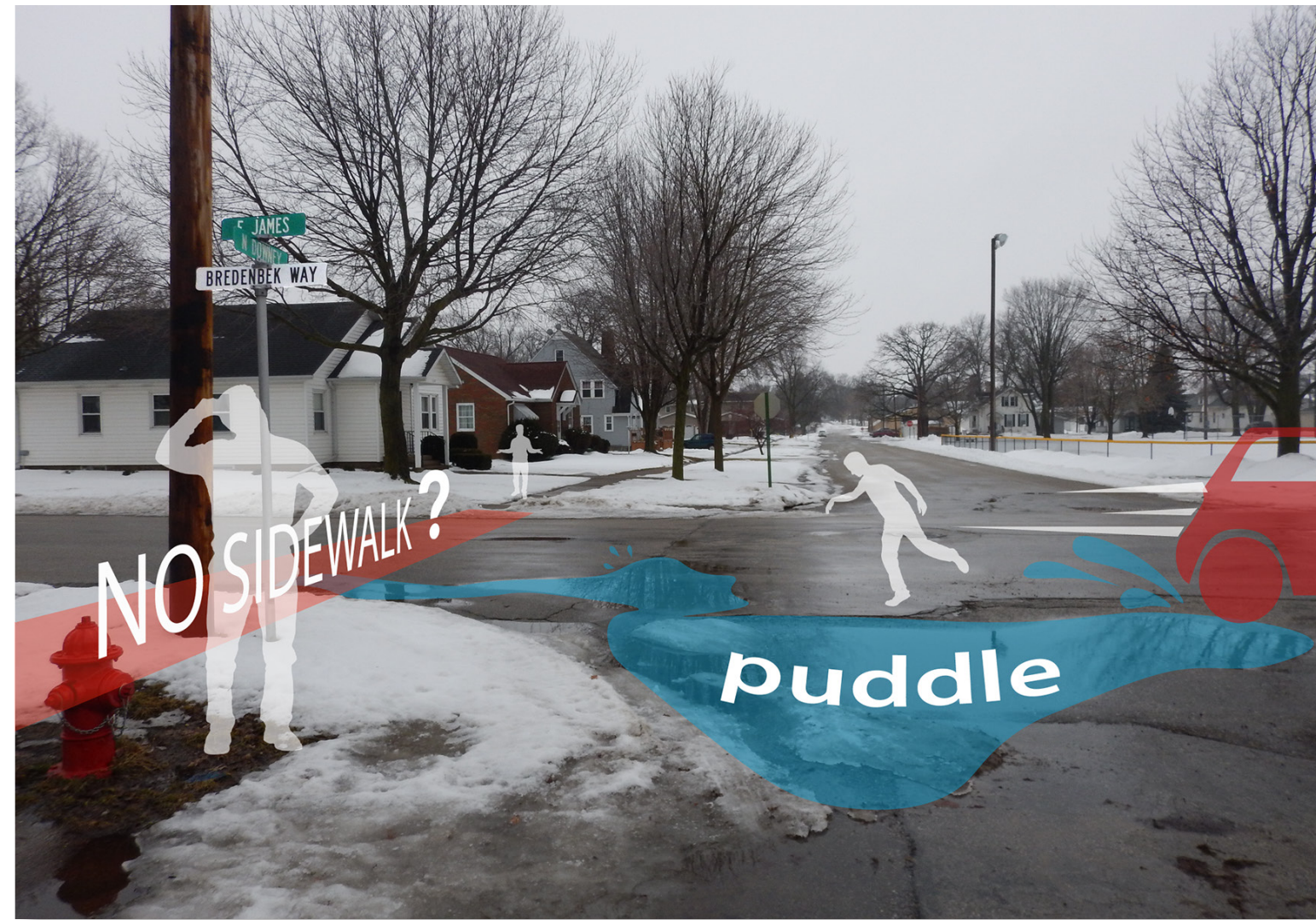
Discontinuous sidewalks and puddles (which freeze and cause slippery conditions) interrupt movement in some areas.