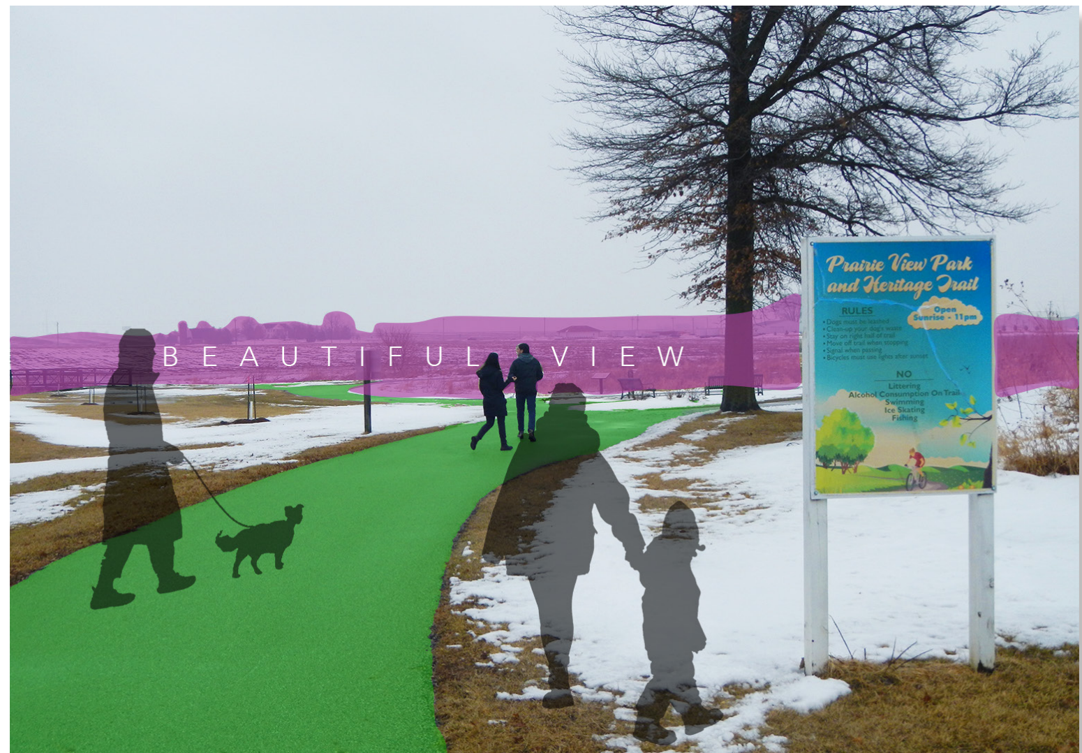
Beautiful views and wide smooth paths in parks were appreciated by all groups.