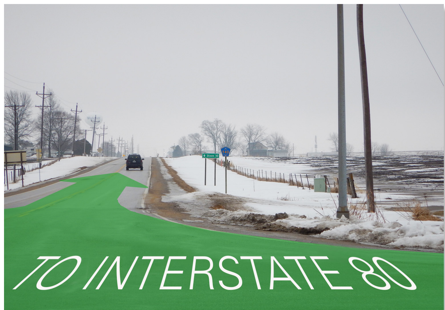
Convenient access to Davenport and the Quad Cities is appreciated.