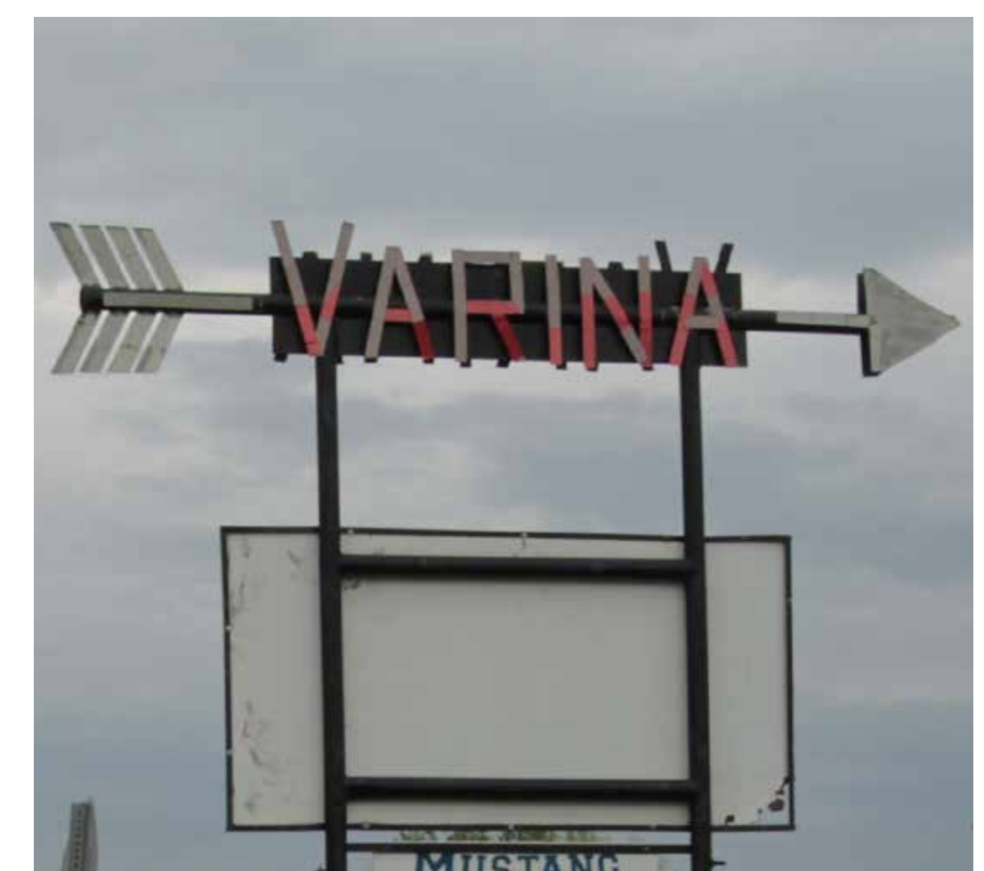
Varina's existing entry sign.