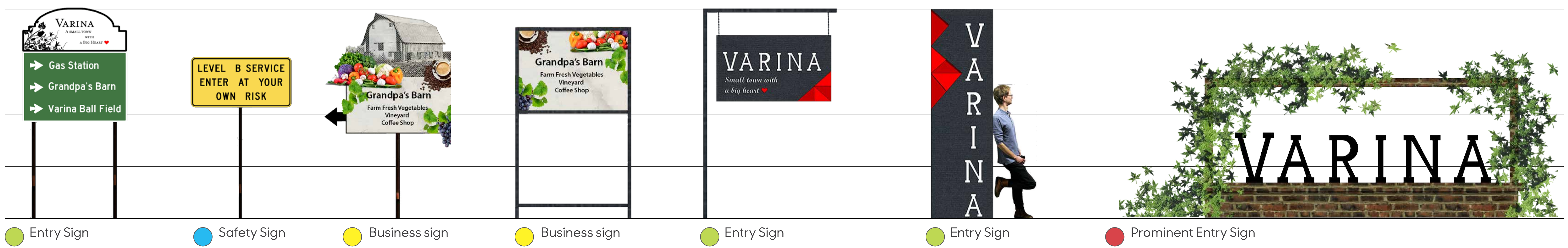
Legend: Green circle = Entry Sign, Blue circle = Safety Sign, Yellow circle = Business sign, Red circle = Prominent Entry Sign