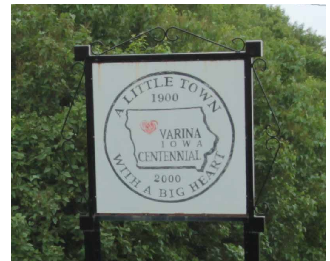
Varina's existing centennial sign.