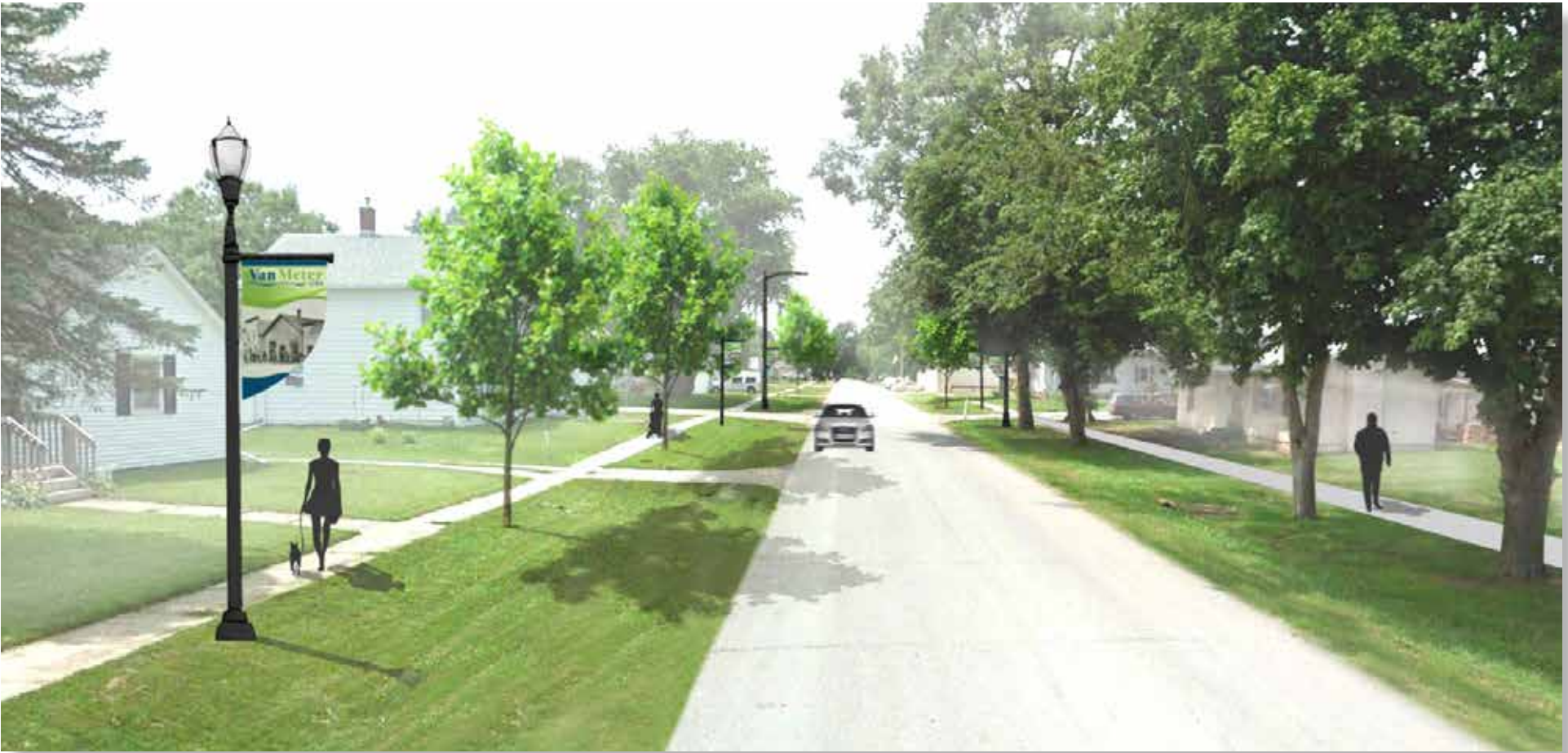
Proposed Main St. corridor improvements