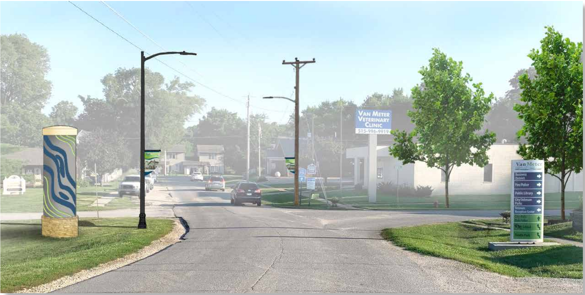
Proposed Mill St. corridor improvements