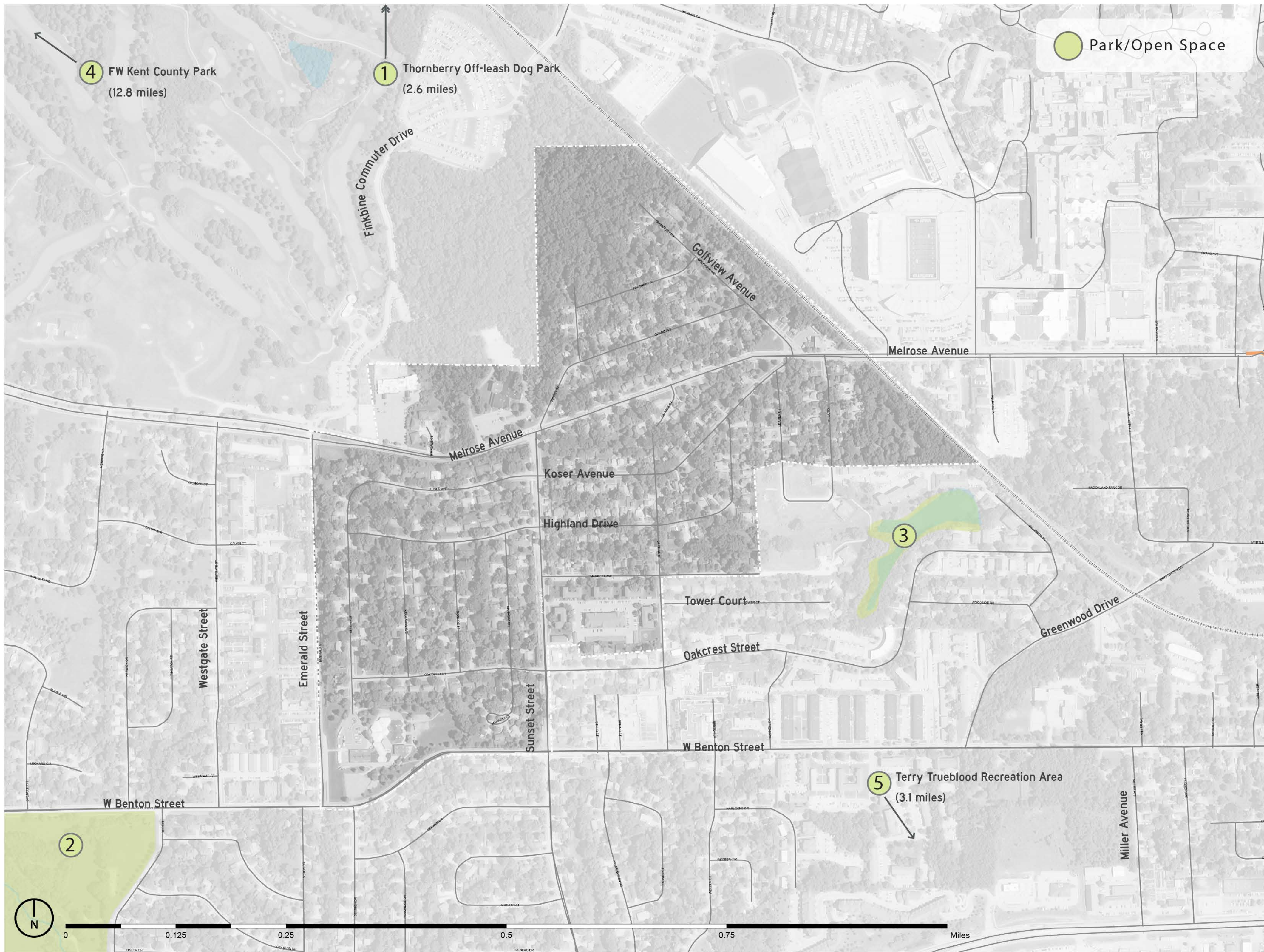
Route data derived from the 2016 Designing Livable Communities survey conducted by Iowa State University.