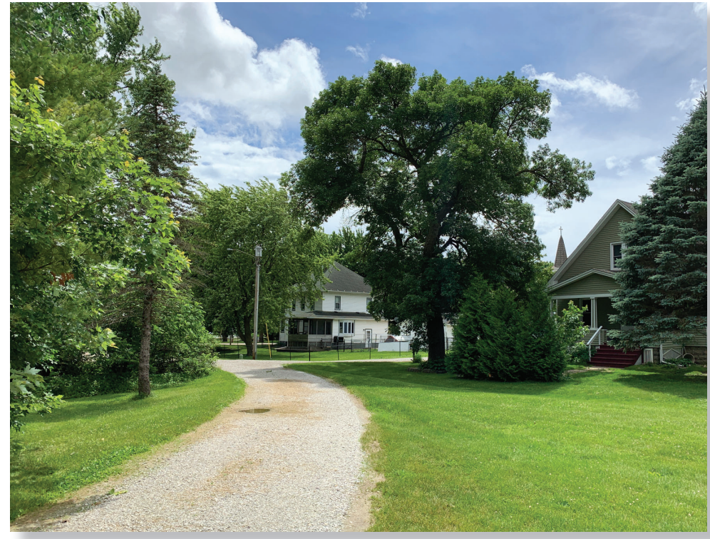
Trail Near Durant Elementary School