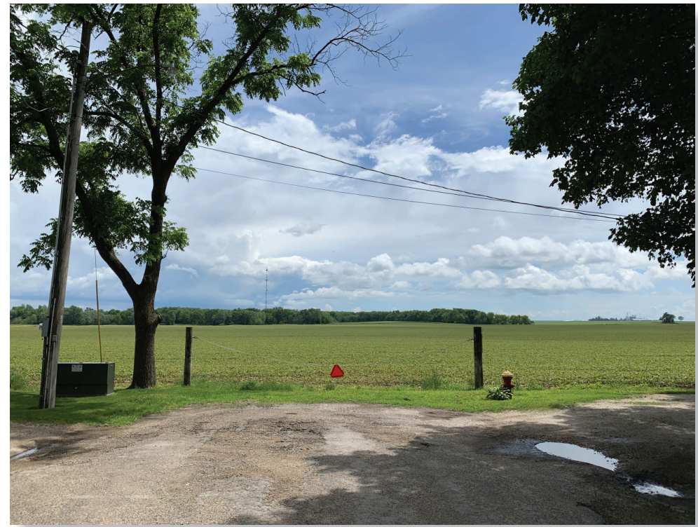
Road End of S Maple Street