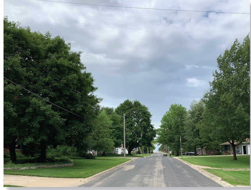
Maple Street: No Sidewalks