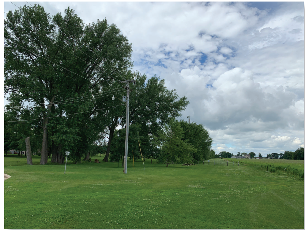
Road End of N Walnut Street

“There are parts of town where you will have 10, 12 blocks of sidewalks, and then you will have 4 with absolutely nothing, and then you will be back on sidewalk...”