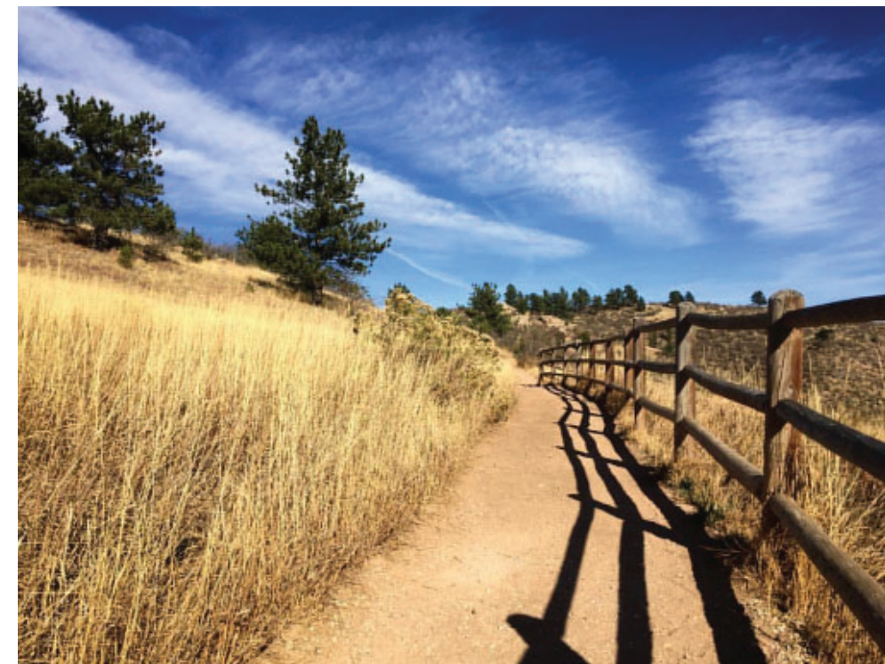
A Hiking Trail With Wood Post in Colorado