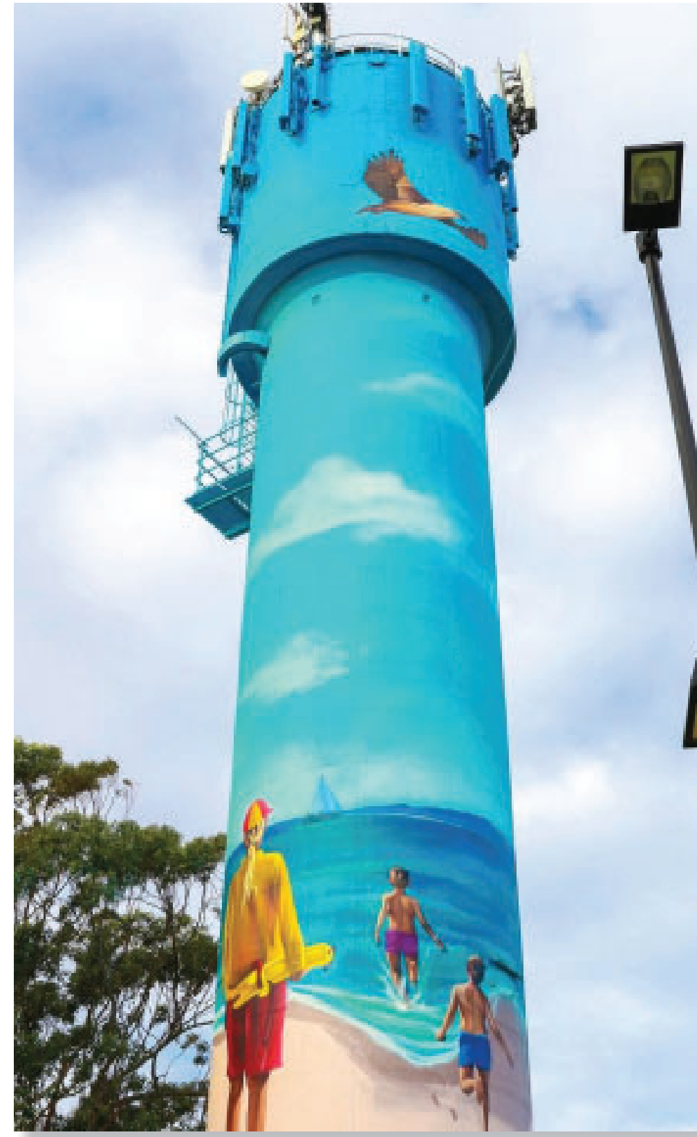
Water Tower Mural at Woorim