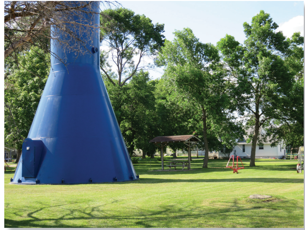
W Sixth Street: No Sidewalks