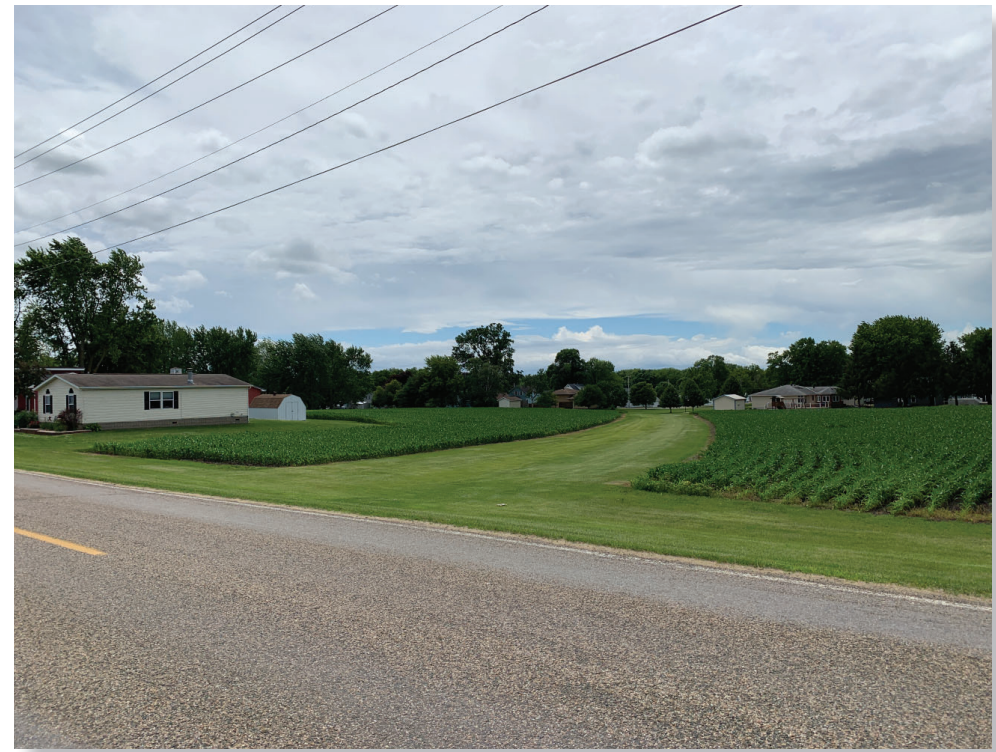
Church Land Near Pleasant Street