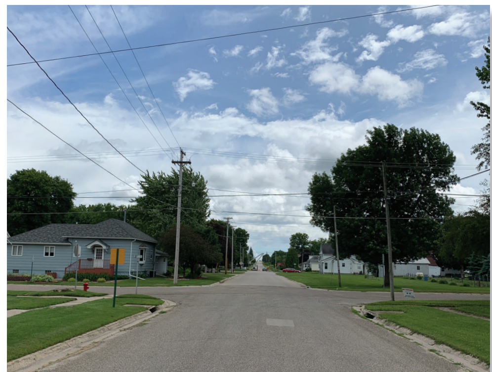
N Walnut St to Second St: No Sidewalks

“I’d like to see more and throughout the rest of the town, maybe connecting the high school, connecting to the pool, future development, even the businesses.”