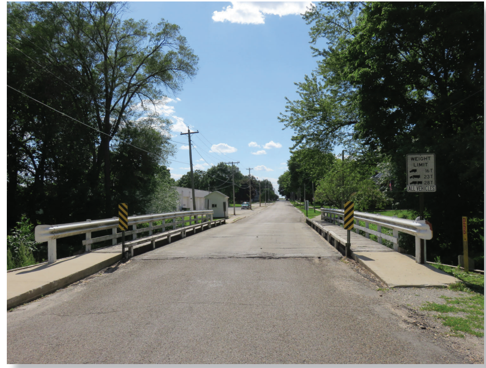
Vehicular Bridge on Fifth St