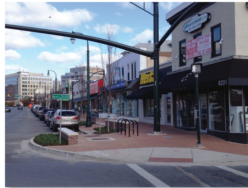
Street Bump-out at Washington, DC