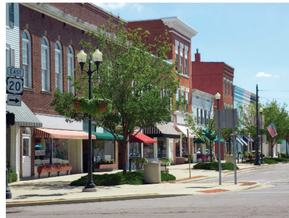
Complete Street in West Jefferson, NC