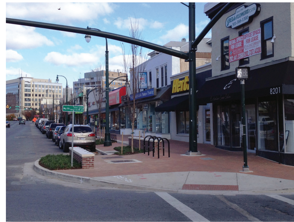
ADA Sidewalk at Beacon Hill, Seattle