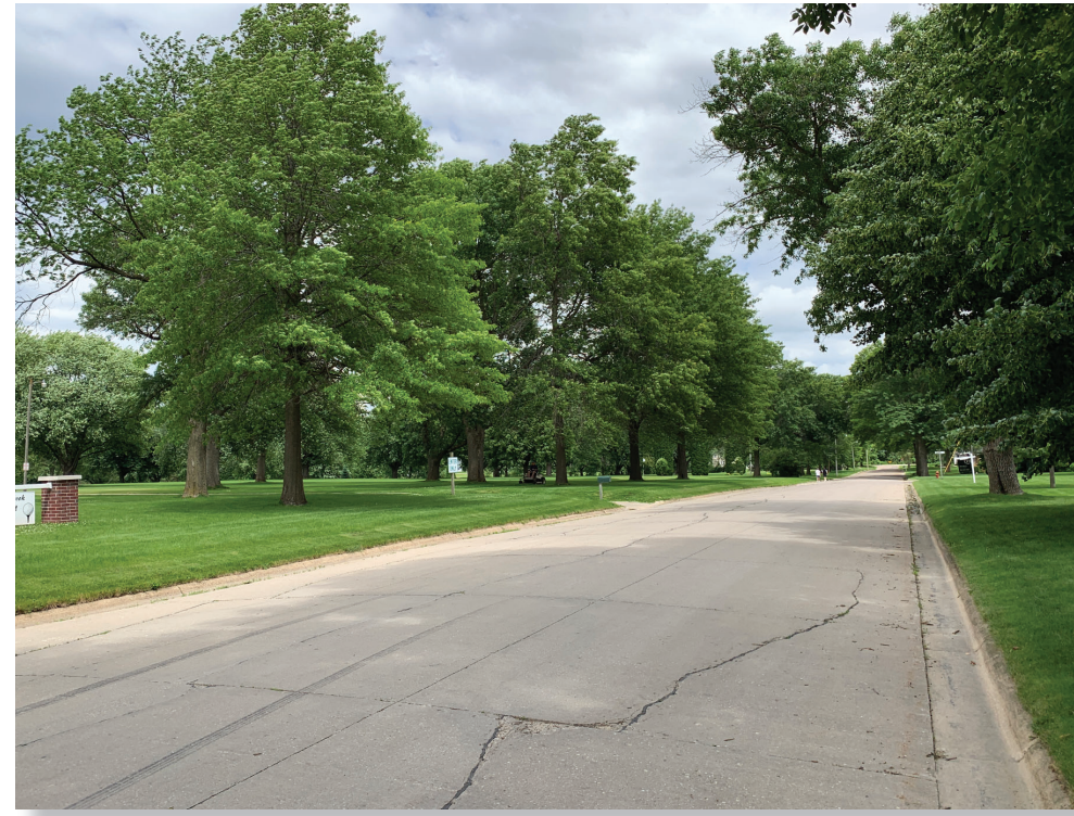
W Sixth Street: No Sidewalks