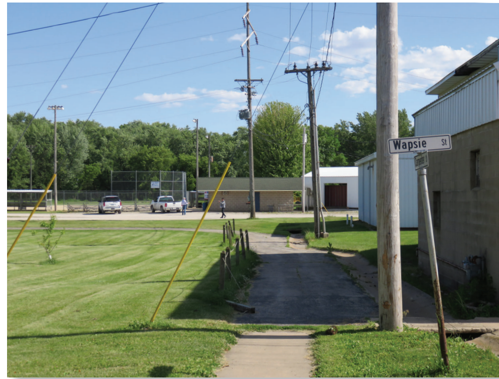
Carpenter Street to South