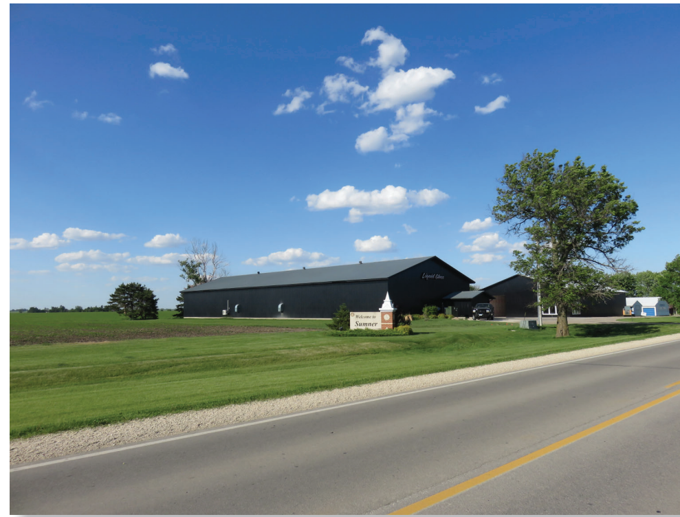
Monumental Signage on West End

“We don’t usually ride on Main Street, we just cross over it real quick and ride the back street...”