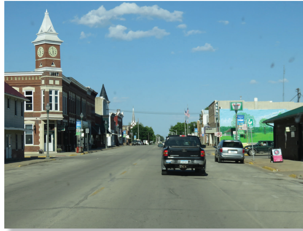
W First Street