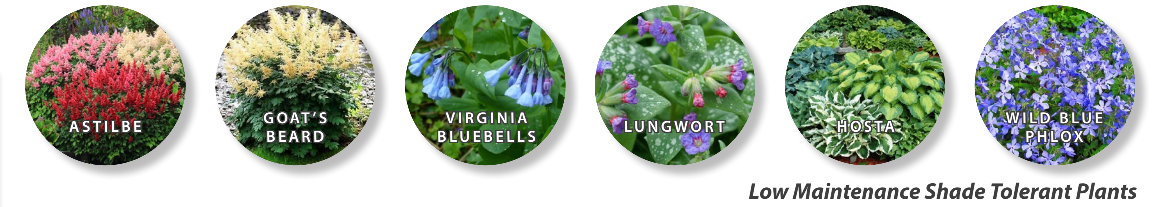
Low Maintenance Shade Tolerant Plants