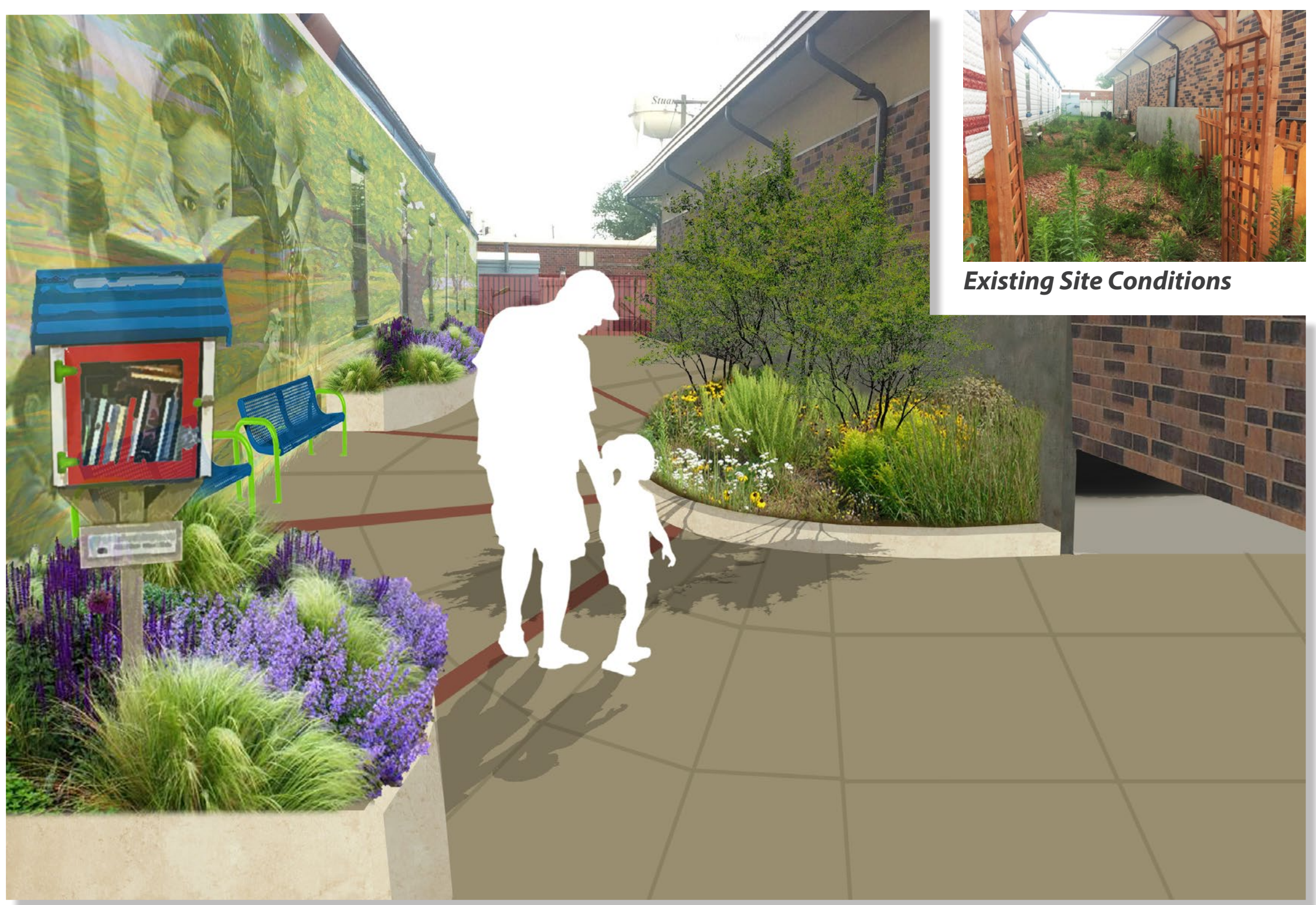
Outdoor Reading Room Entrance