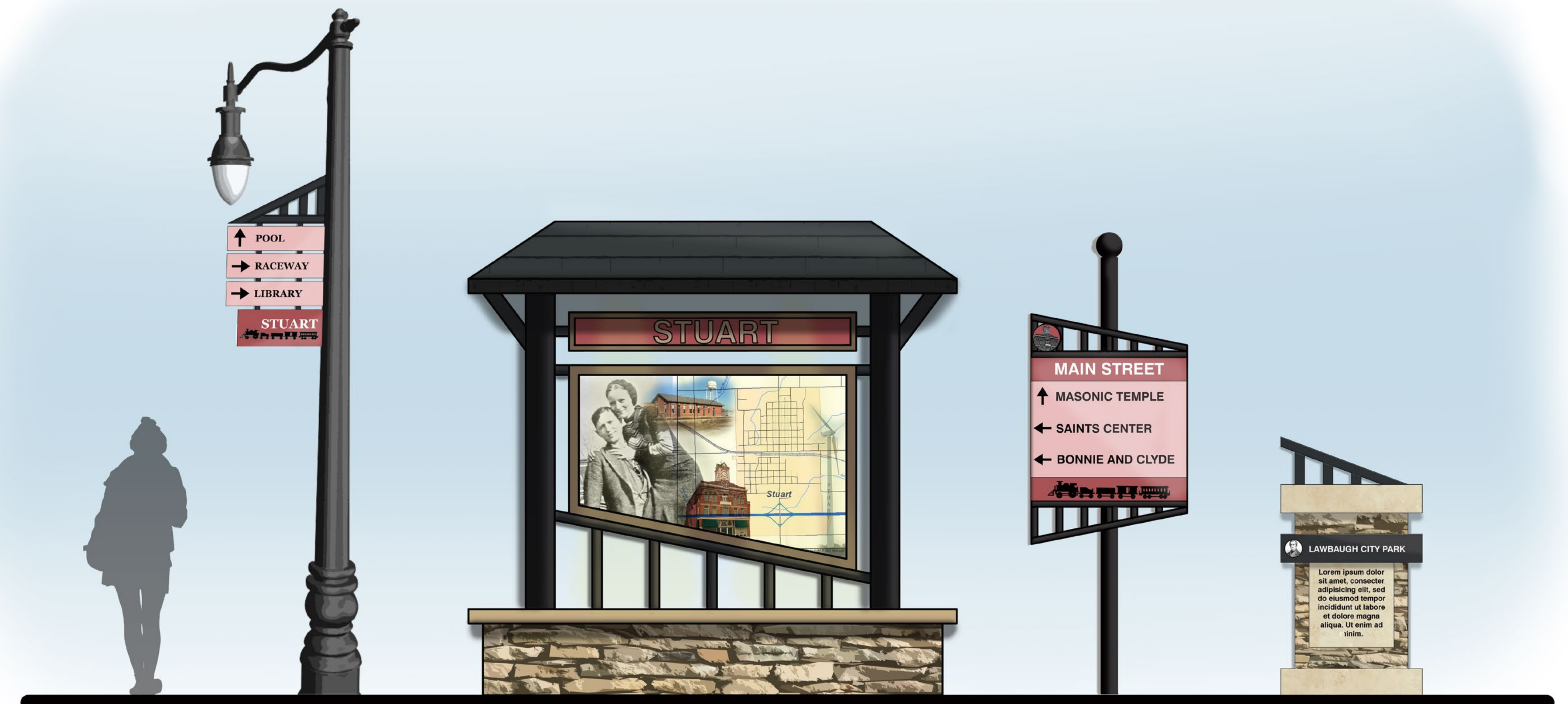
Wayfinding Signage Options: Light Pole Blade