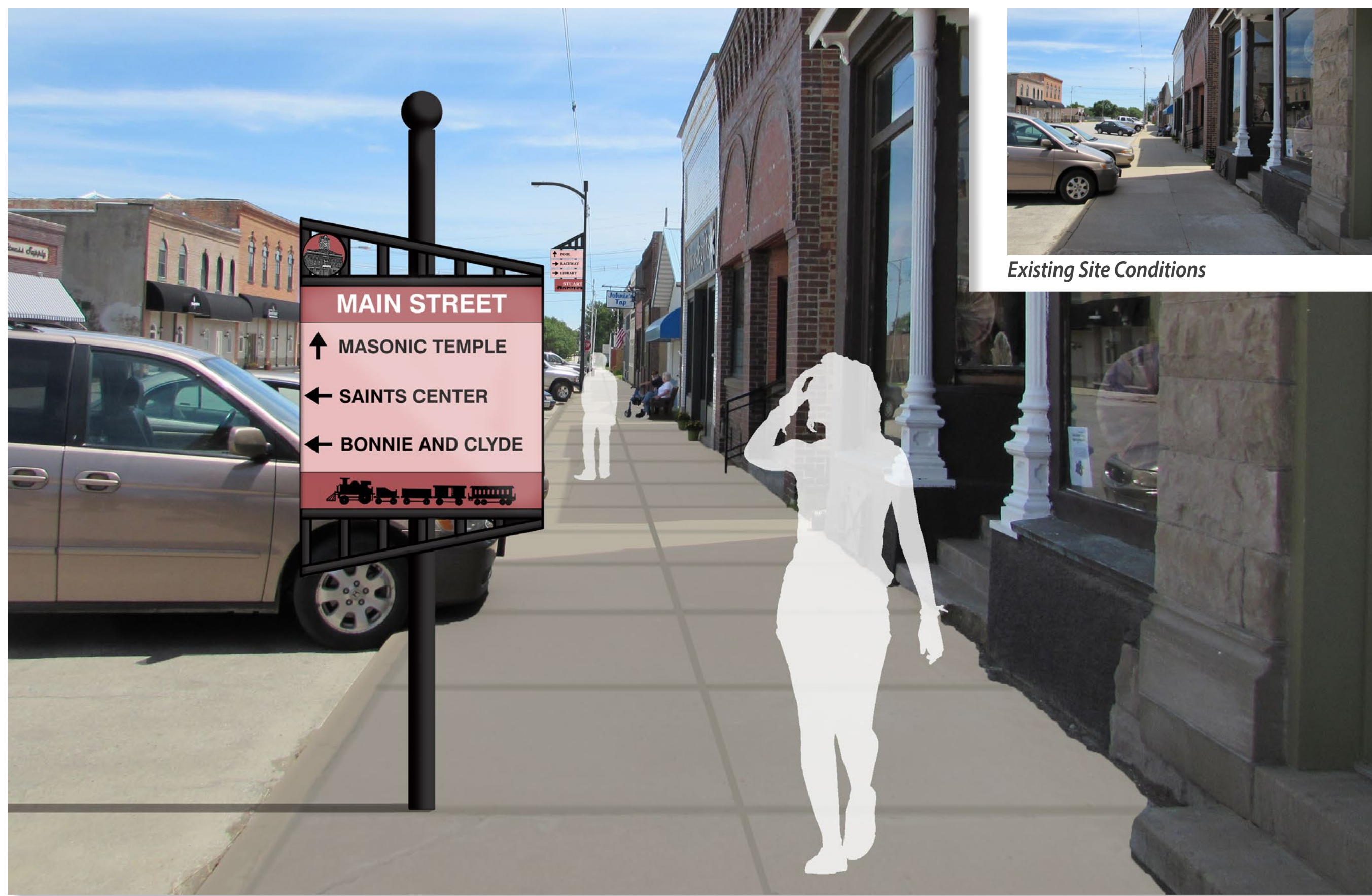
Wayfinding Directional Sign and Lightpole Blades on Main Street