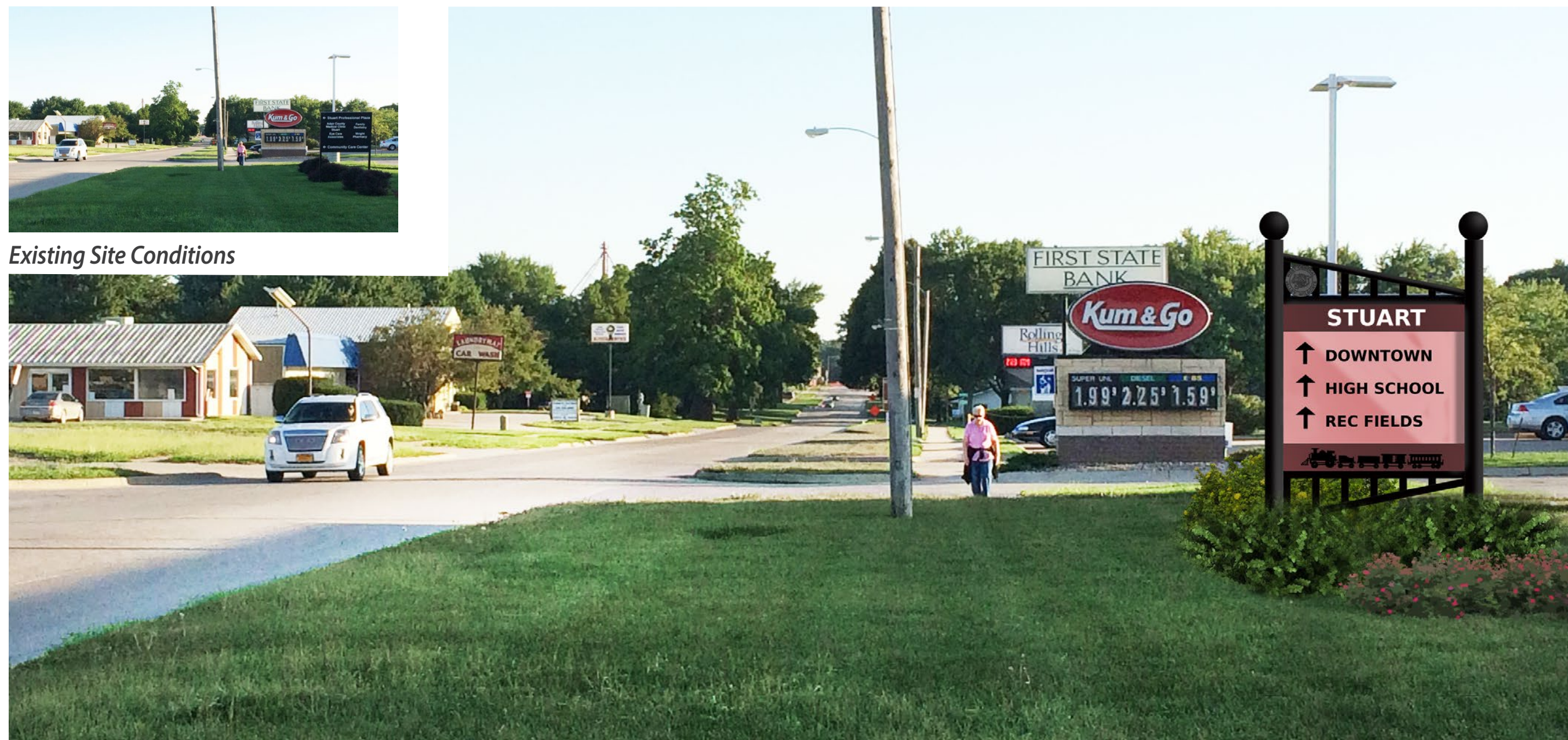
Wayfinding Directional Sign at South Entry of Town

Four types of wayfinding features have been designed to help guide people to key areas in town, such as the Masonic Temple, Saints Center for Culture and Arts, train depot, and downtown. These features include light pole blades, information kiosks, community guides, and historic information columns. All of these elements include limestone or red materials and incorporate the railroad symbol which can be found on option one in the entry sign board. The light pole blades will be located at downtown intersections. The train depot's form can be seen in the information kiosk. This kiosk may include information such as a map with points of interest or additional information about the community. While light pole blades are used to guide vehicles, community guides are used to guide pedestrians. These may be beneficial in areas like Lawbaugh City Park where there is no clear directional signage to other destinations. The historic information columns can be used near some of Stuart's most well-known historic areas, such as outside of the Bonnie and Clyde Bank Robbery location. All wayfinding options are used to enhance one's experience in Stuart.