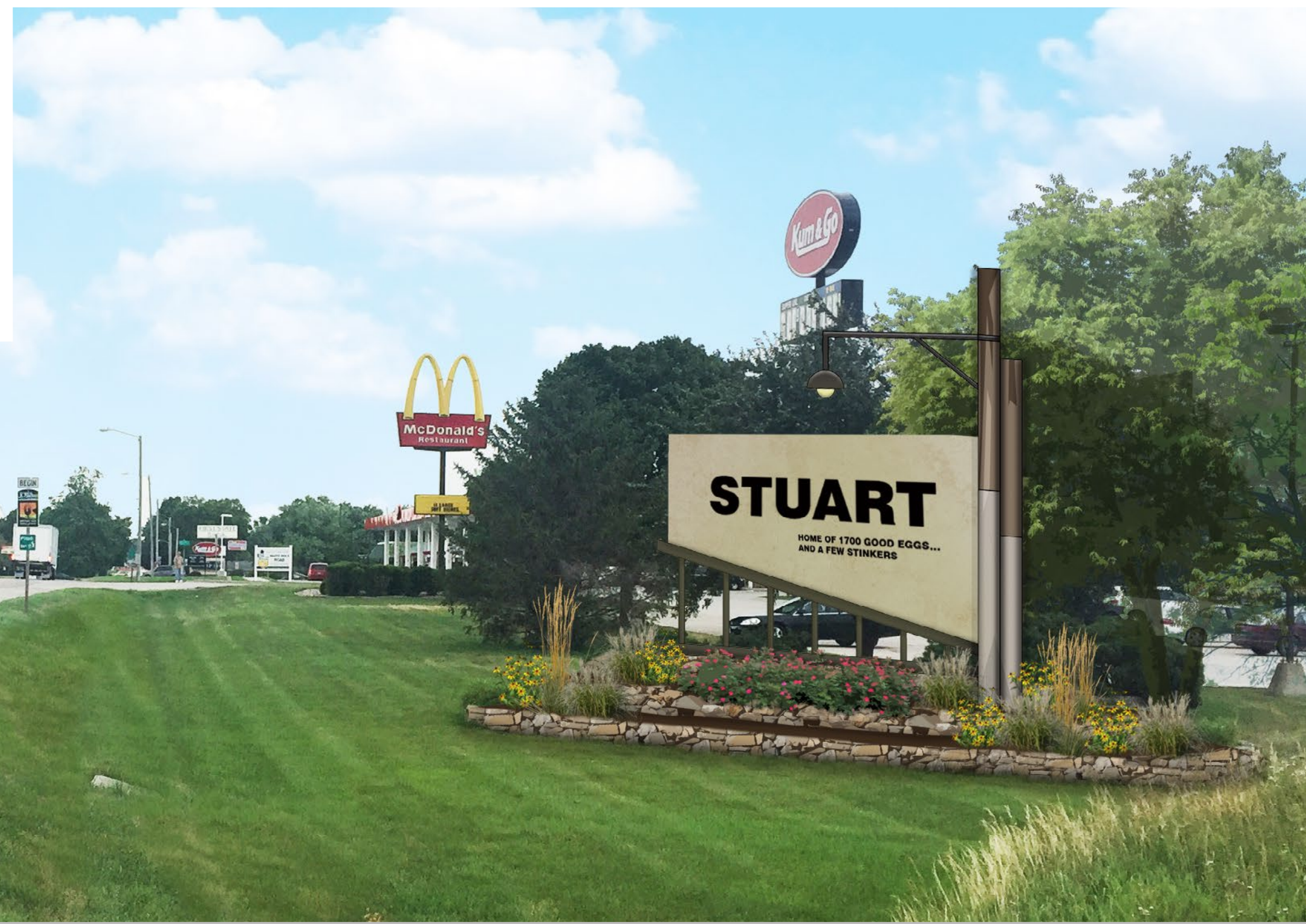
Entry Signage Near Interstate Pull Off