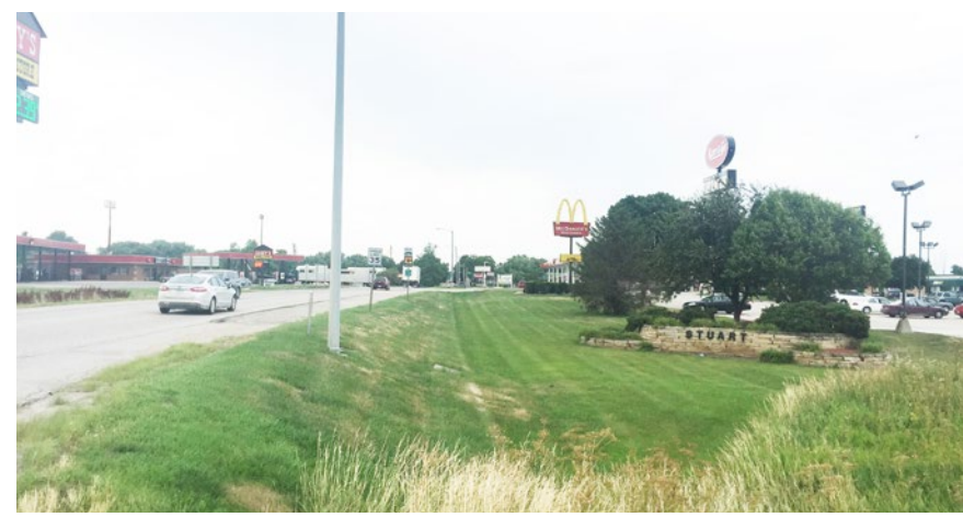
Existing Site Conditions