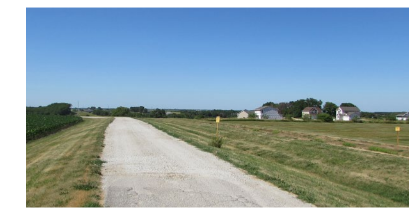
Existing Site Conditions