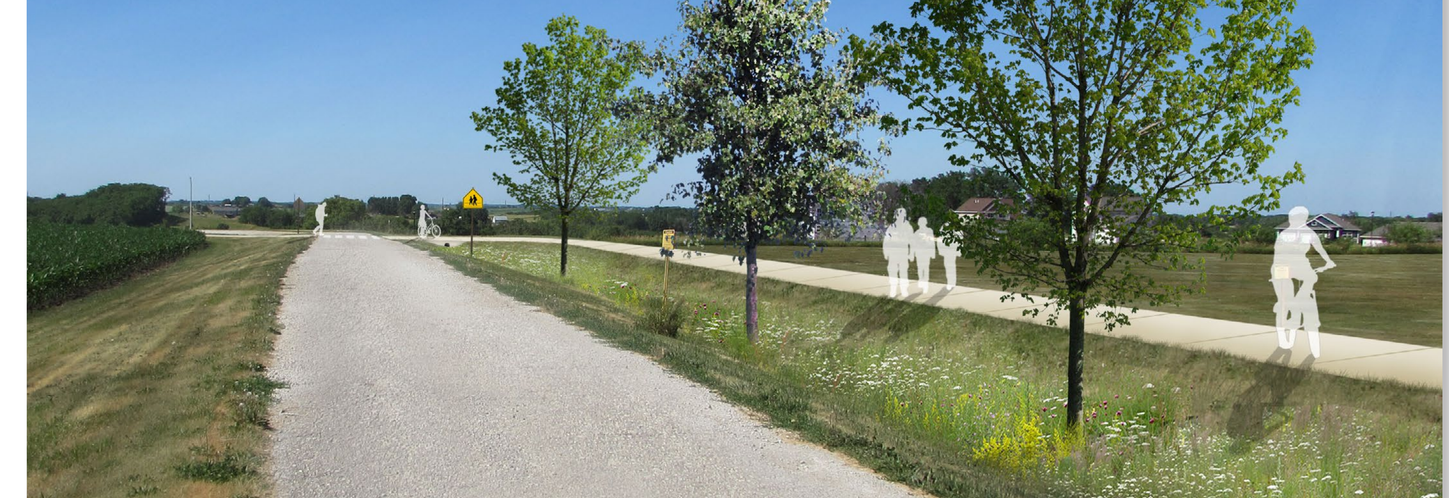
Potential connection to High School along private drive