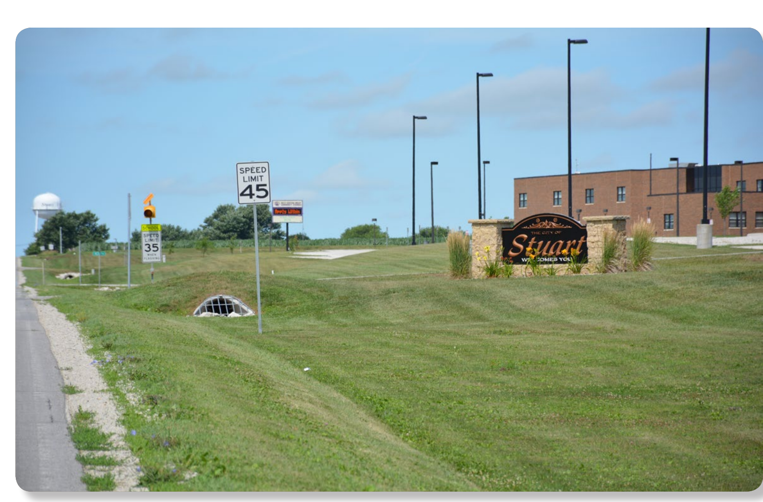
Looking West on Front Street