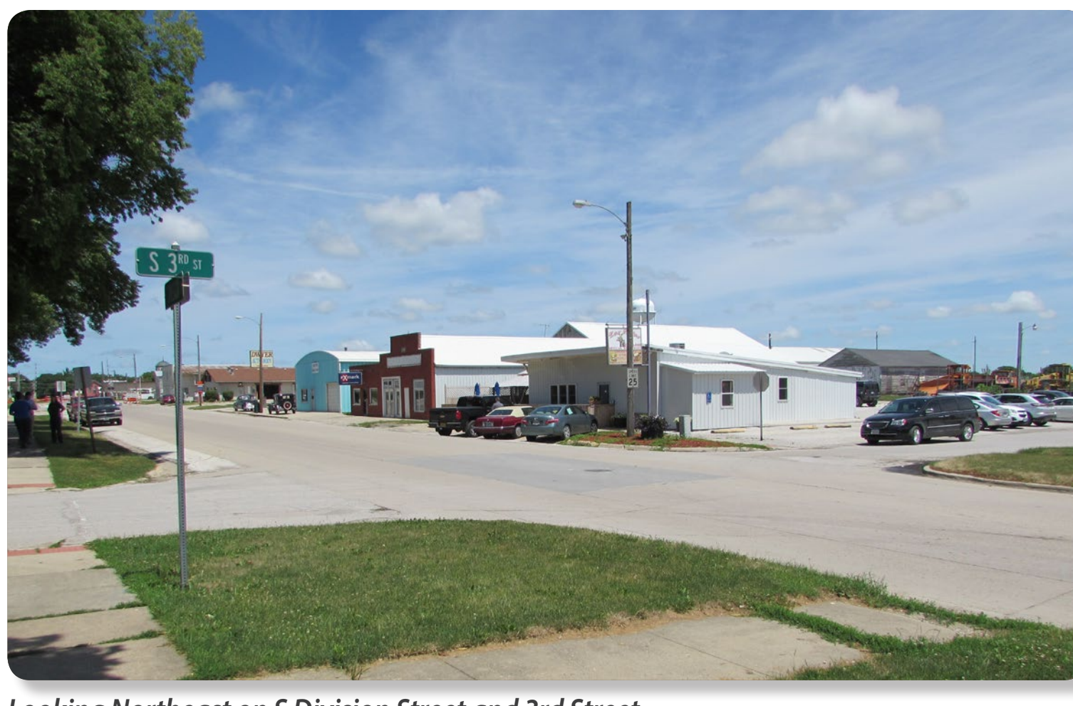
Looking Northeast on S Division Street and 3rd Street