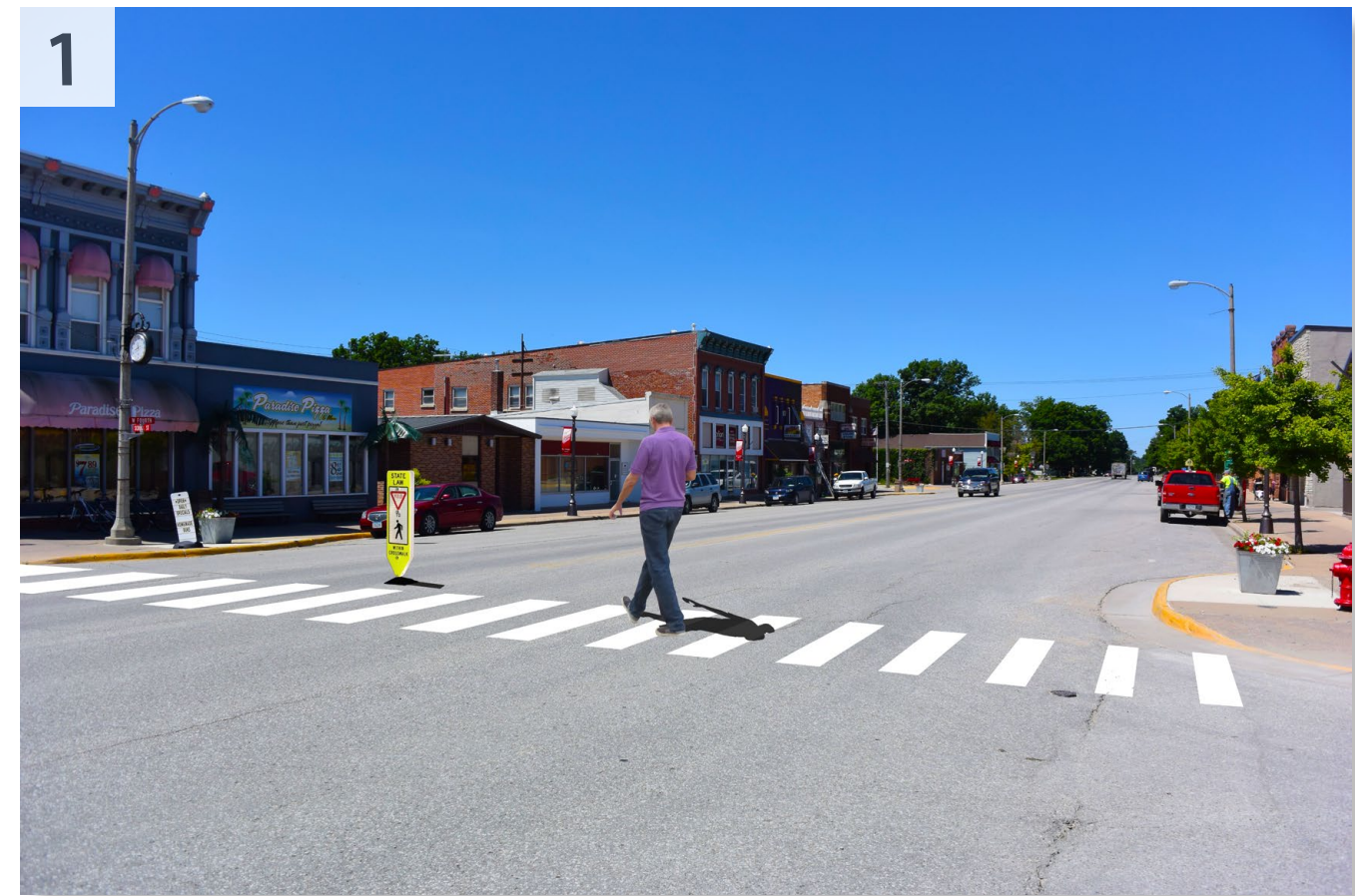
Proposed crosswalk and pedestrian signage across 4th Street

Other communities have applied pavement markings designating a "safe route to school" using footprints, school logos, and other graphics painted on the sidewalk. Other whimsical ideas that have been used include graphics depicting different methods of movement such as dancing, running, and skipping to encourage physical activities as children walk to and from school. This concept is something St. Ansgar could adopt to let kids and parents alike know this route is specifically designated as a school route and will have signage, crosswalks and other necessary precautions for pedestrians.