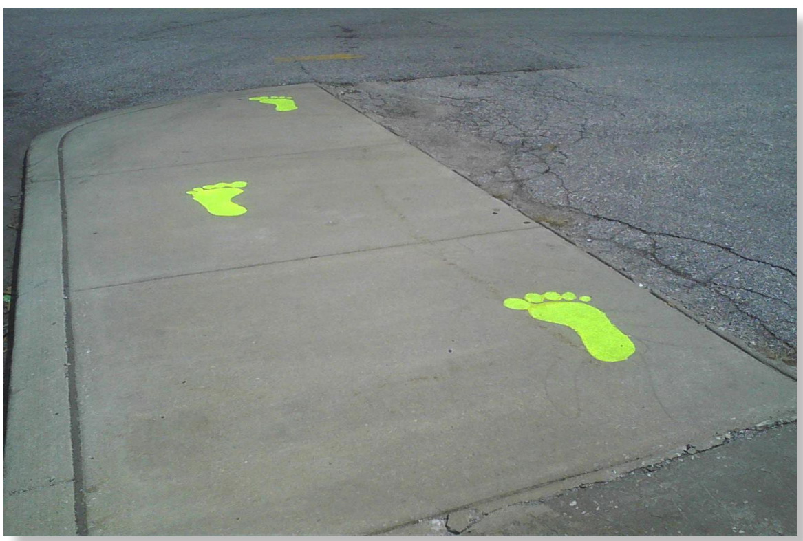
The City of Baltimore uses brightly colored painted footprints on the routes they want kids walking to school. The designated safe routes can be easily monitored and additional safety practices can be utilized, such as crosswalks and signage.