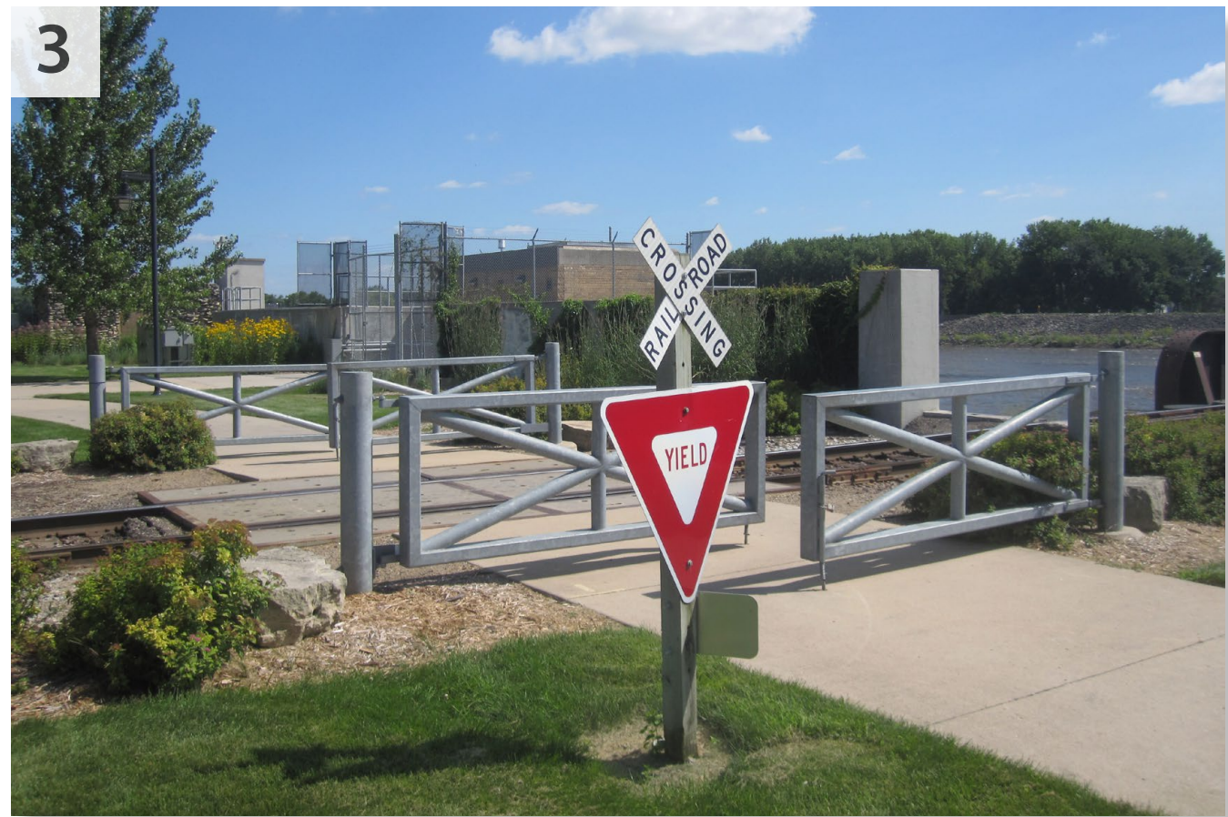
The safety of pedestrians and bicyclists crossing the railroad tracks can be improved by adding signage, barriers and level pavement transitions. An example of this from Waterloo, Iowa is seen above.