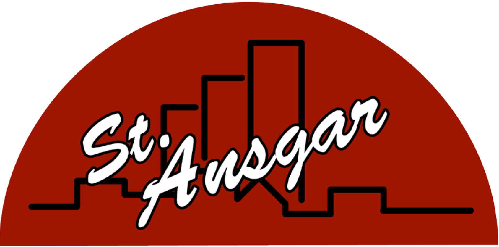
Signage cap concept using existing city logo