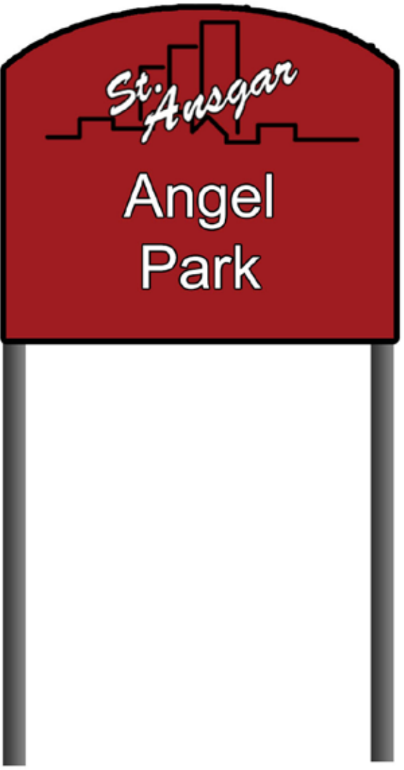
City Amenity Sign