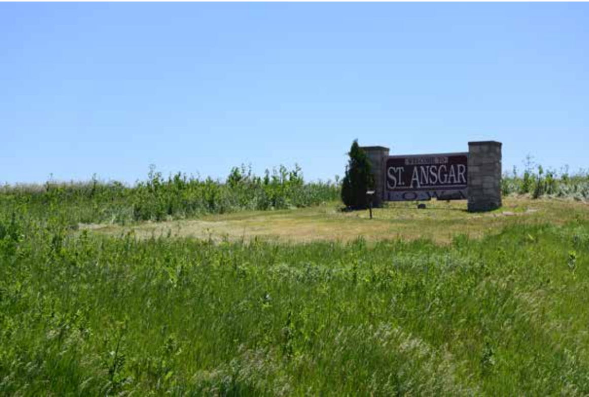
Existing north entrance sign