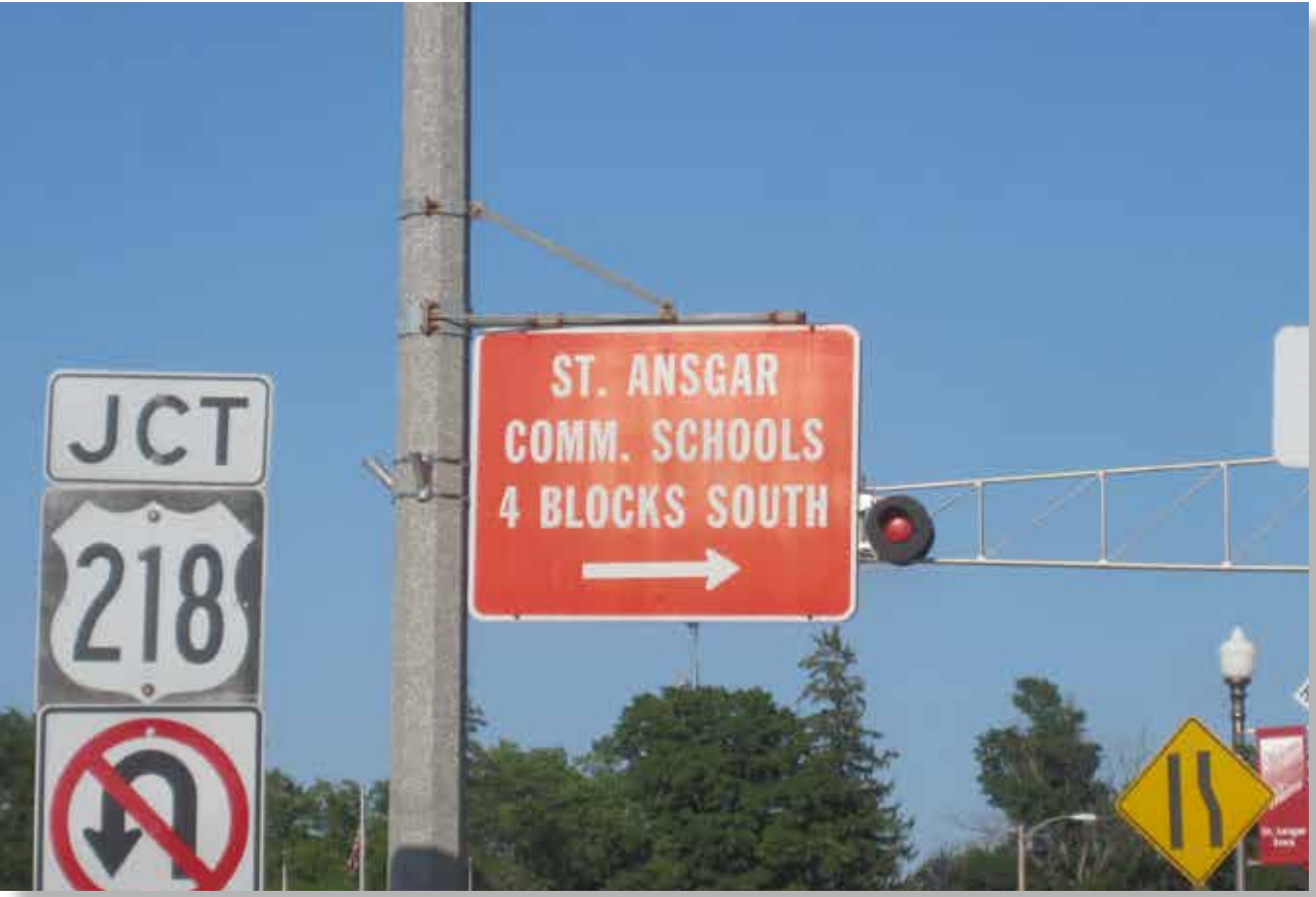
Existing way-finding signage

The use of consistent wayfinding signage throughout the community would direct residents and visitors to the town's amenities using a combination of free-standing and pole-mounted directional signage. The design team used the community's school colors and existing logo to create a signage cap theme that could be used in all future signage. The final concept should follow the Manual of Uniform Traffic Control Devices guidelines and have 3M reflective finishes for visibility at night.