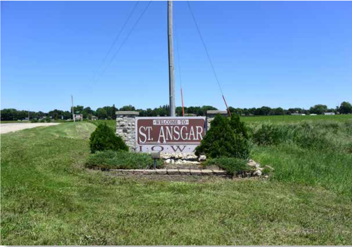
Existing south entrance sign