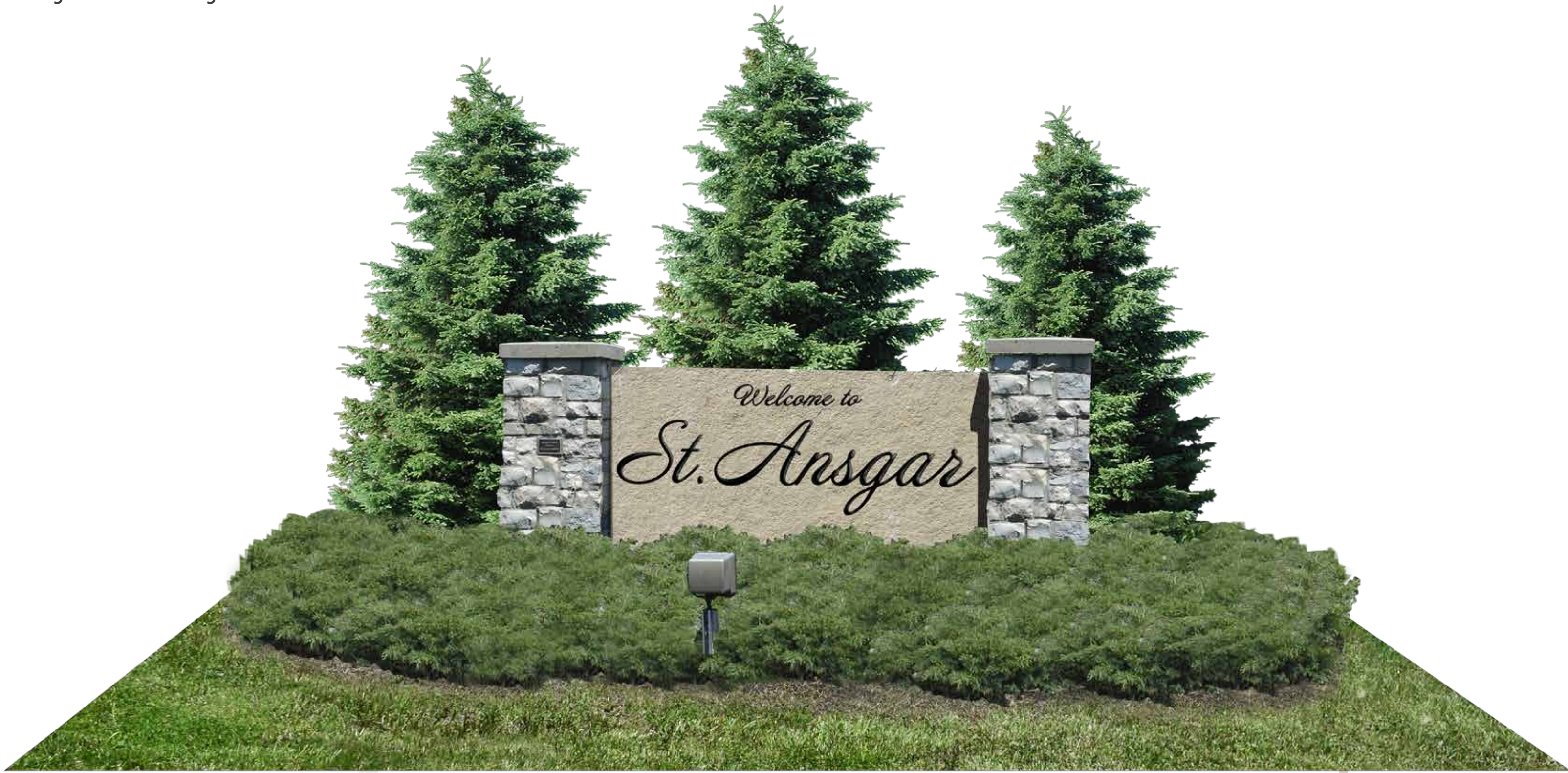
Proposed sign concept using the existing stone columns