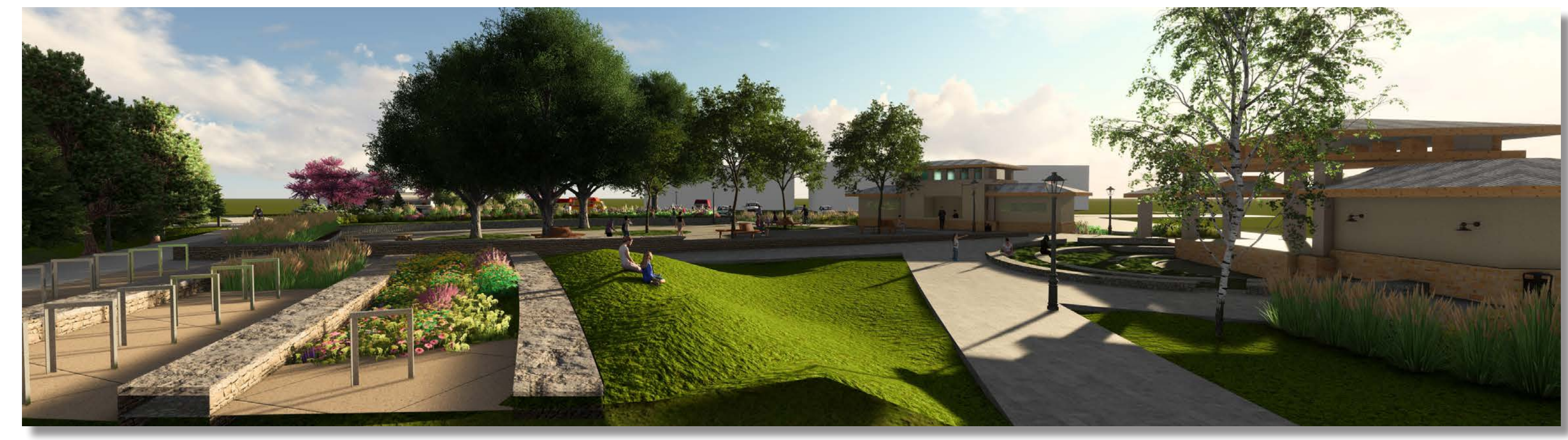
2.) View looking north of the amphitheater, restroom, open lawn, and bike parking area.