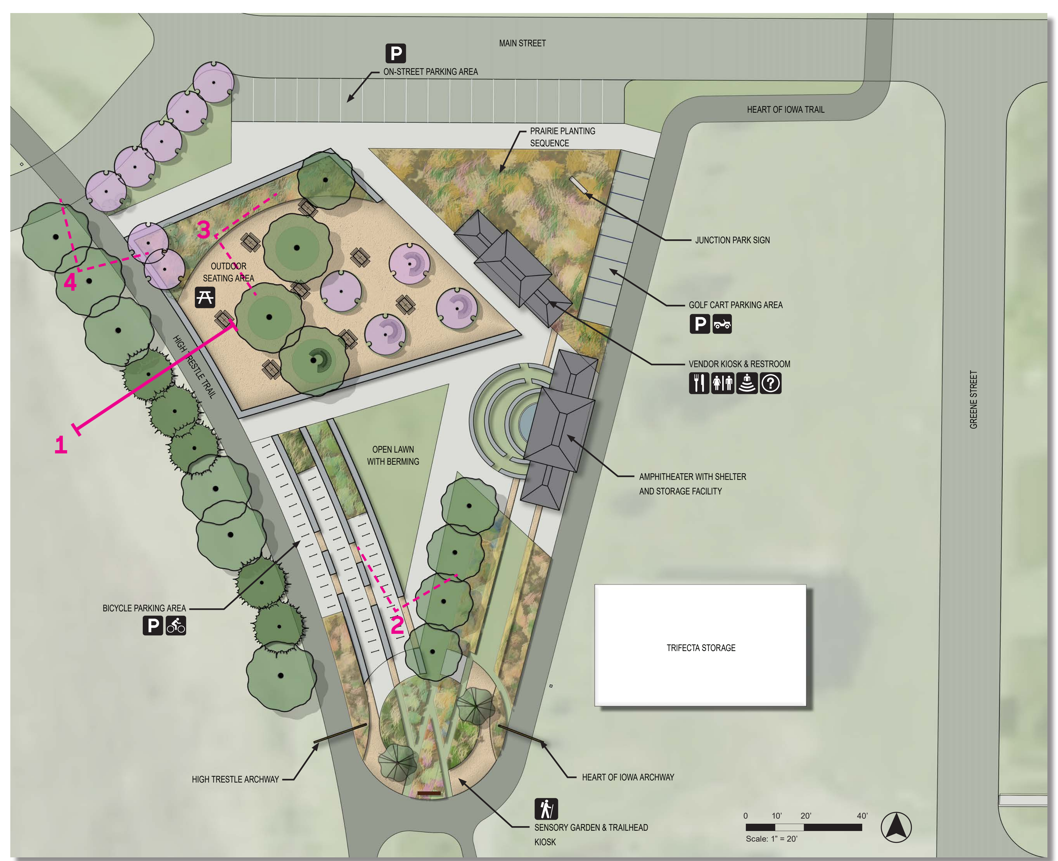
Site plan at Junction Park Trailhead.