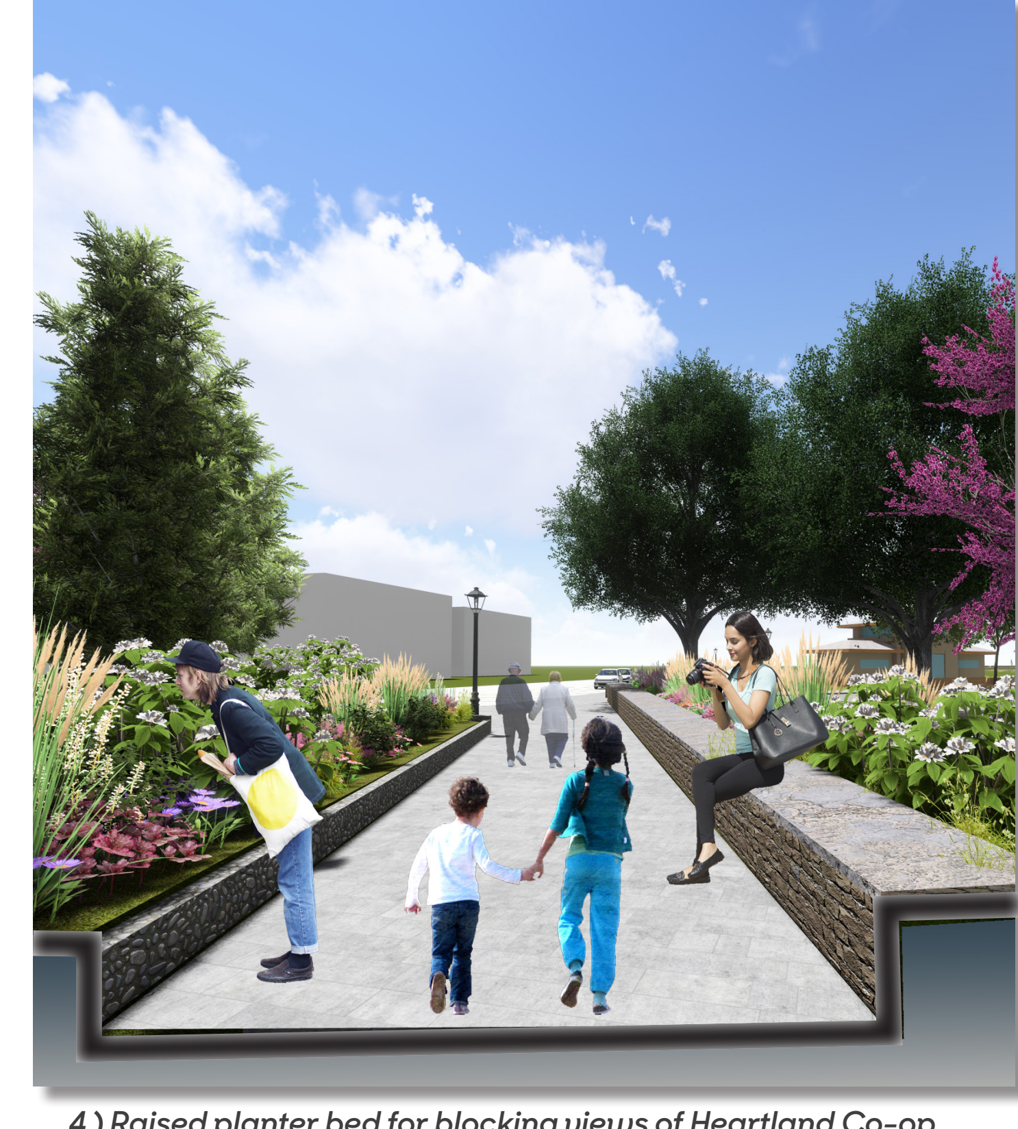
4.) Raised planter bed for blocking views of Heartland Co-op to the west.