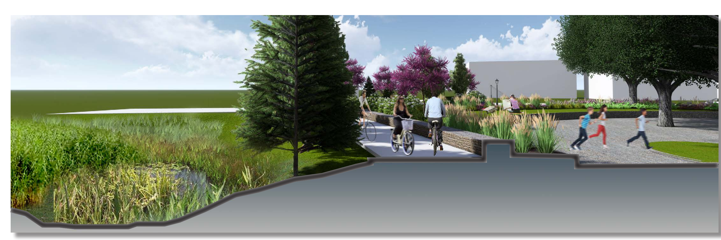
1,) Cross section looking northeast along High Trestle Trail.

The junction features a historic depot-inspired concessions building with restroom and a band shelter with amphitheater. The outdoor seating area is shaded by oaks and ornamental trees to provide a beautiful three-season space for outdoor events. The open lawn and bike parking support larger trail-related events. The sensory garden has paths and an information kiosk to direct visitors to town amenities.