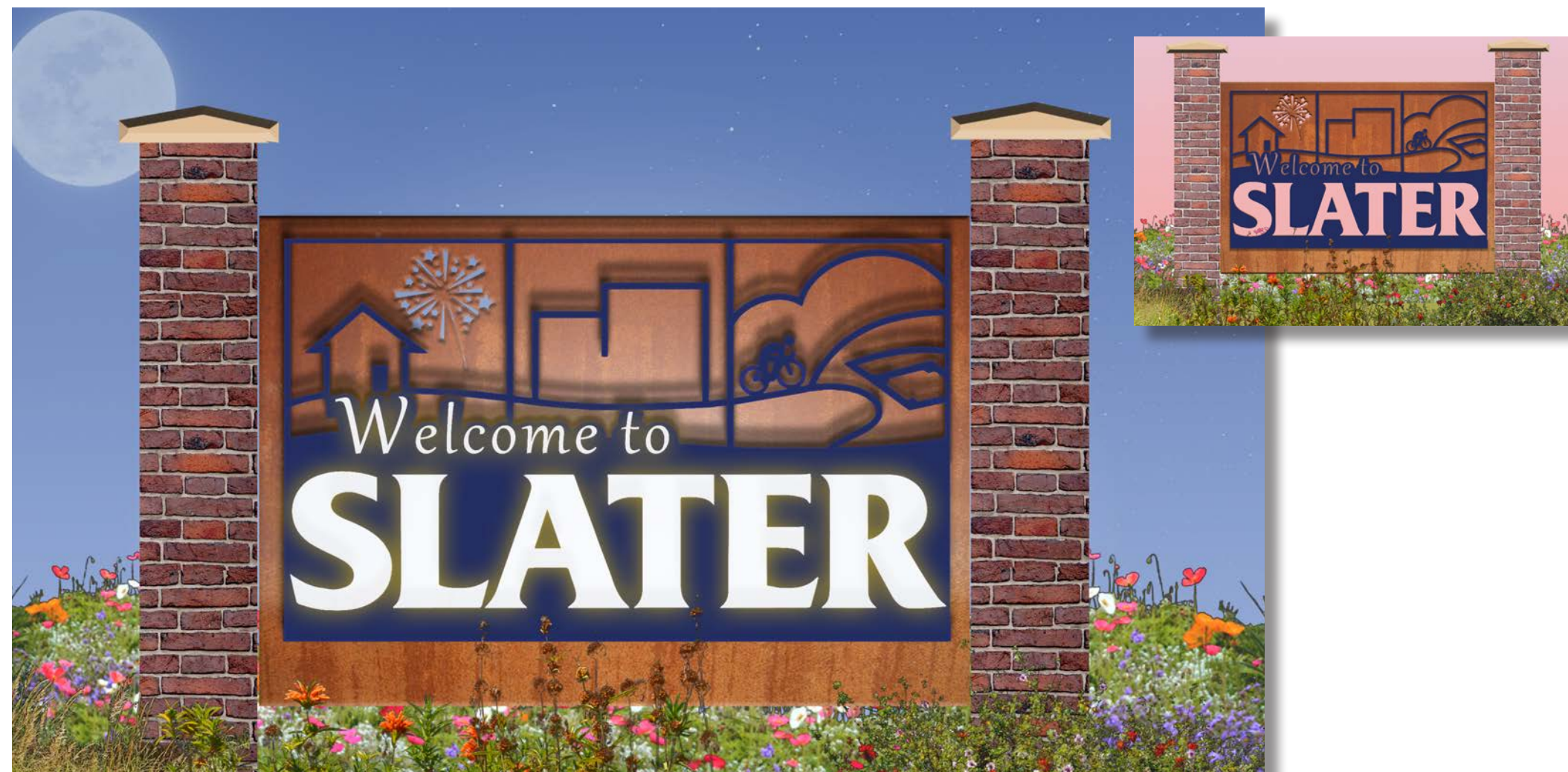
★ Entry signs with Slater identity married with rail-trail weathered steel use existing brick columns.