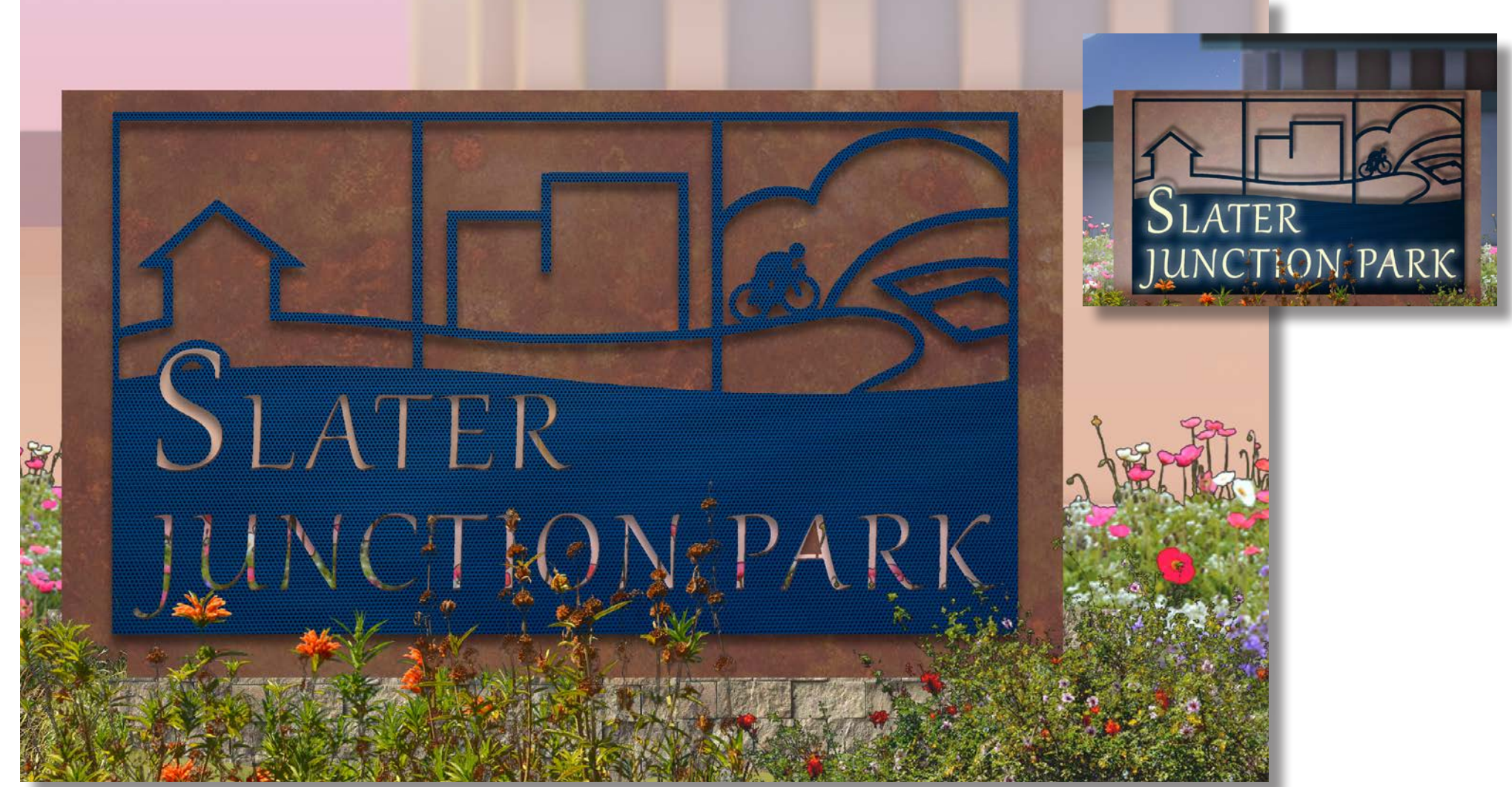
● Proposed illuminated park signs tie Slater identity with the rail-trail aesthetic. (day and night views).