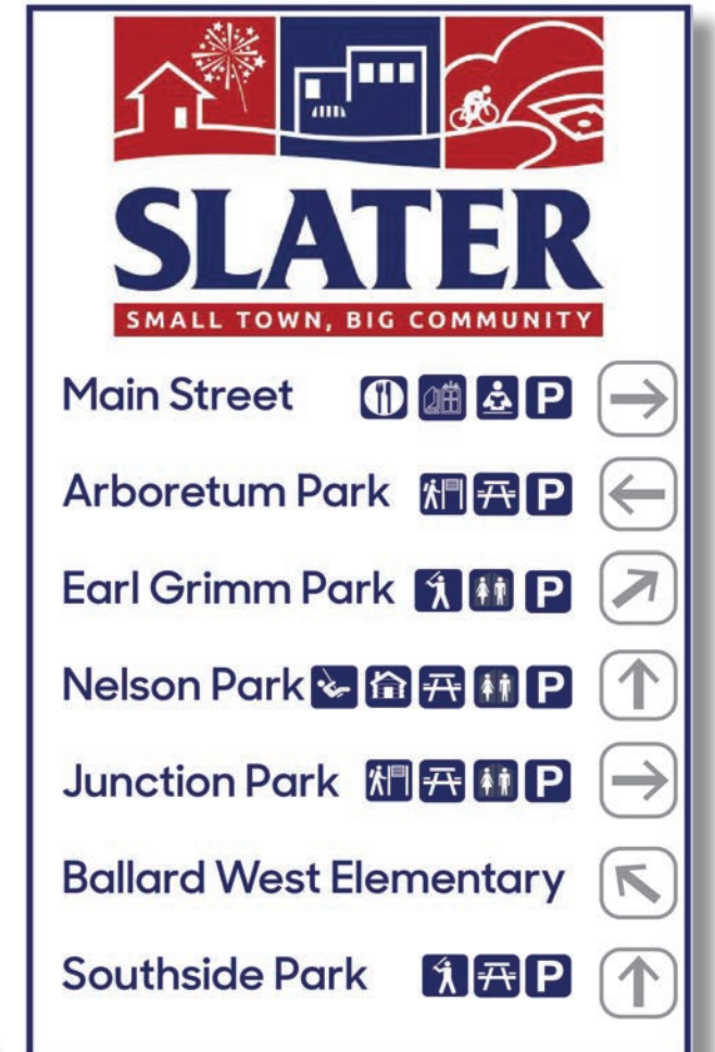
Primary way-finding sign directs visitors to Slater’s key points. Example entering Slater from the north on Linn St.