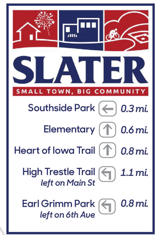
Secondary way-finding signs give directions to attractions. Example from Linn St at 10th Ave.