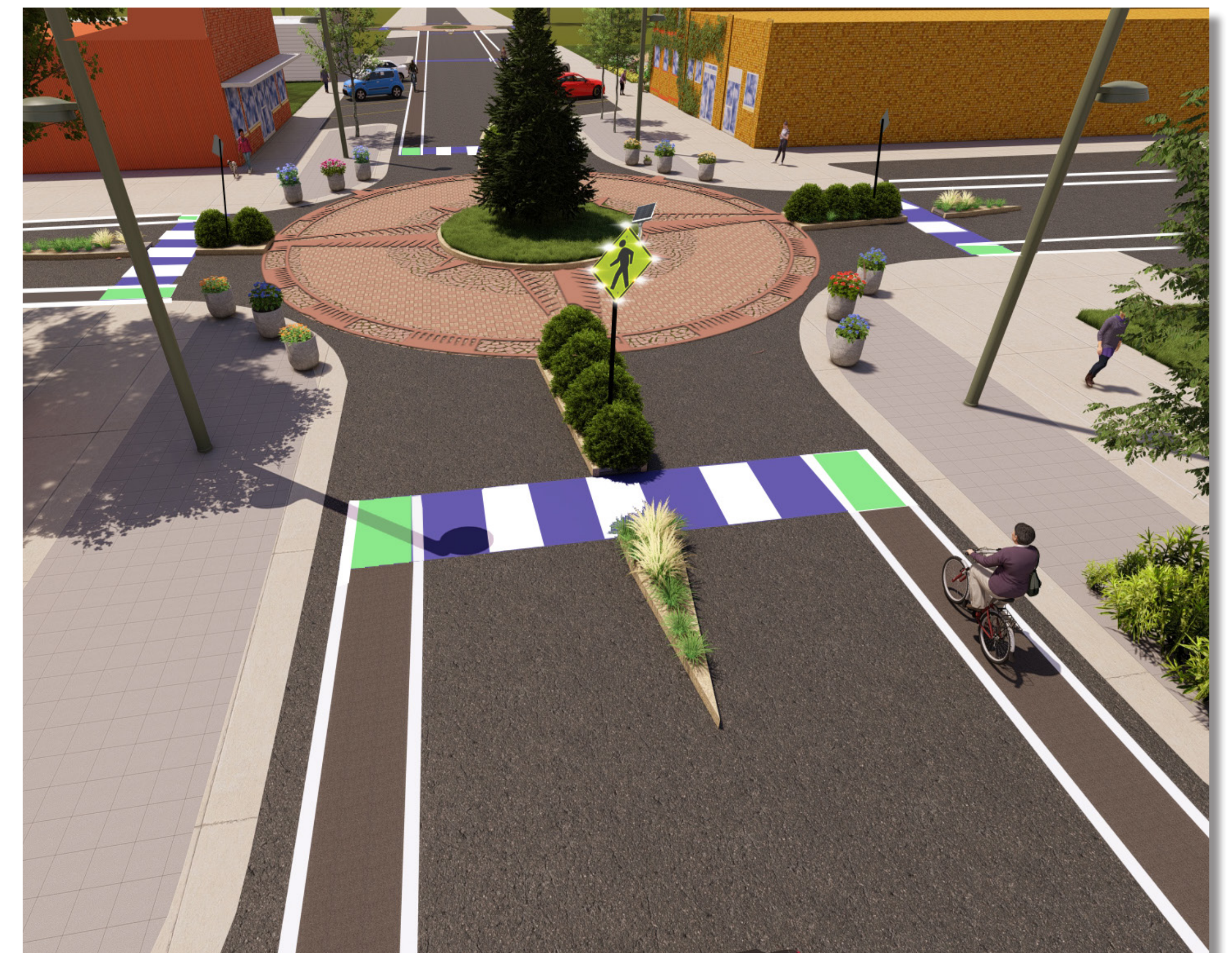
At the intersections of Marshall and Story with Main Street, more permanent roundabouts are proposed, which intend to improve flow and safety while serving as locations for seasonal decoration. This is a view looking east down Main Street at Marshall St.