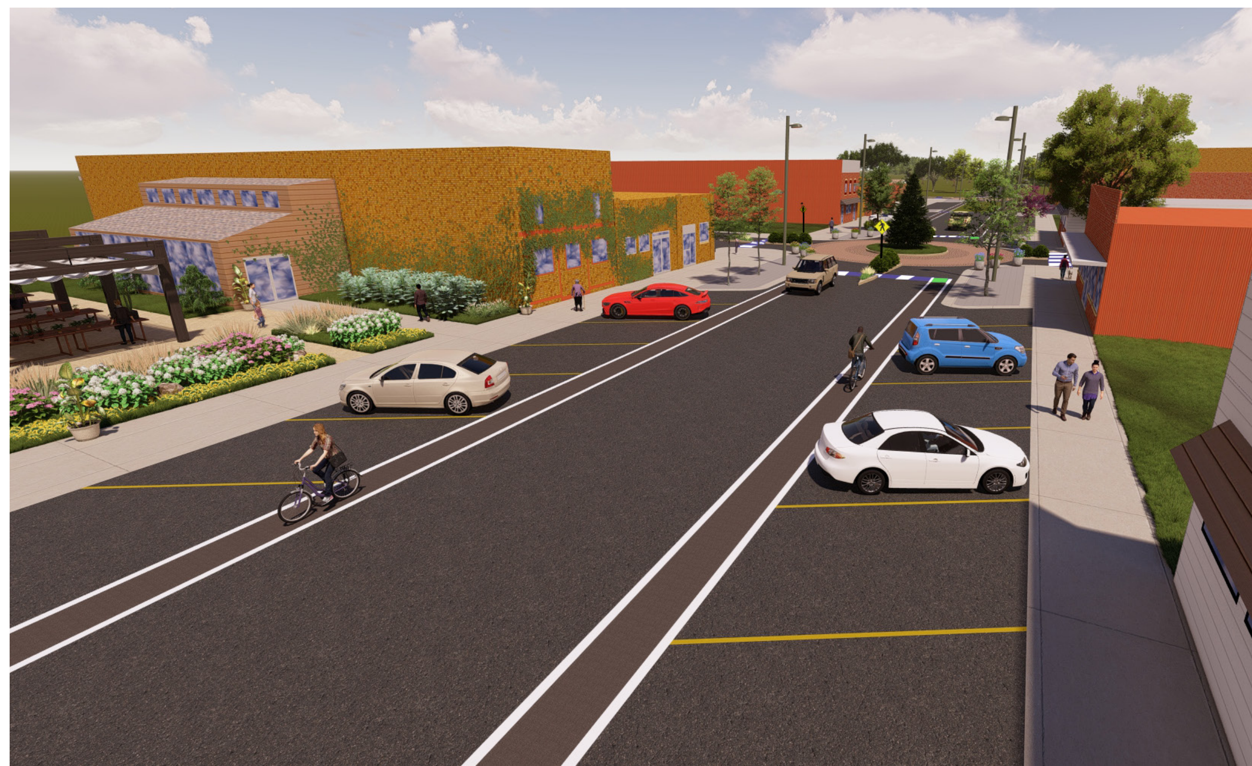
Main Street in its current state is roughly 30 feet wide, which means that biking lanes, crosswalks, and plantings can be designated throughout the ROW to slow down vehicular traffic. This is a view looking west down Main Street towards Marshall Street

Parking at Earl Grimm Park is updated with paving and diagonal parking spaces. Bioswales and trees mitigate stormwater and hot pavement.