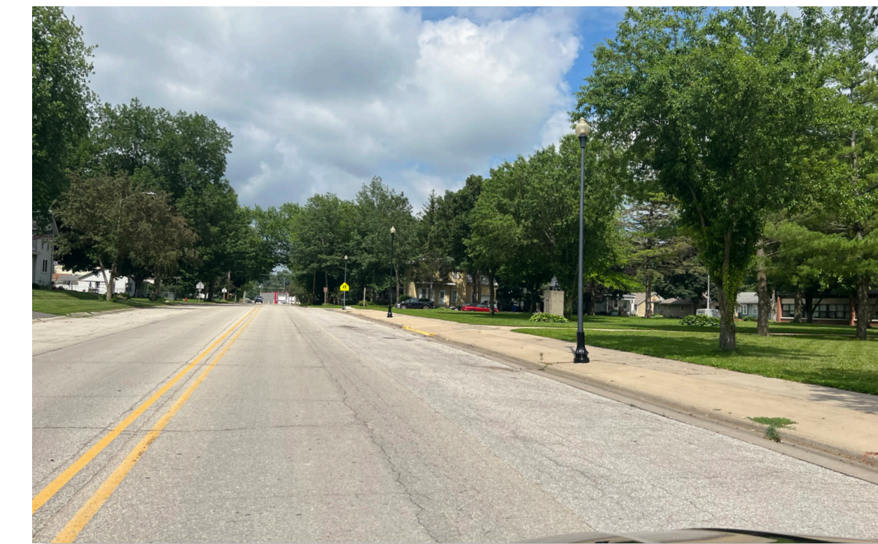
(D) Cherry Street near Shell Rock Elementary