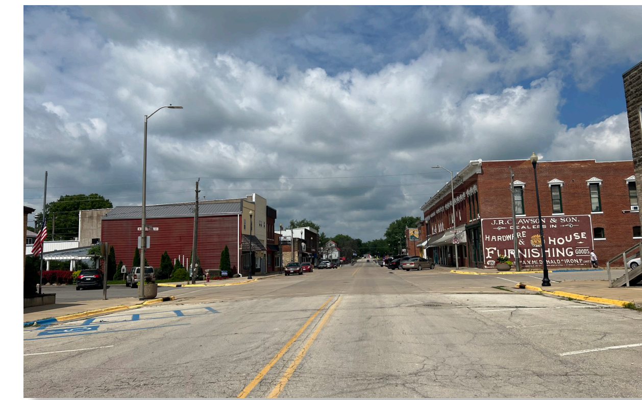
(A) Cherry Street and Washington Intersection