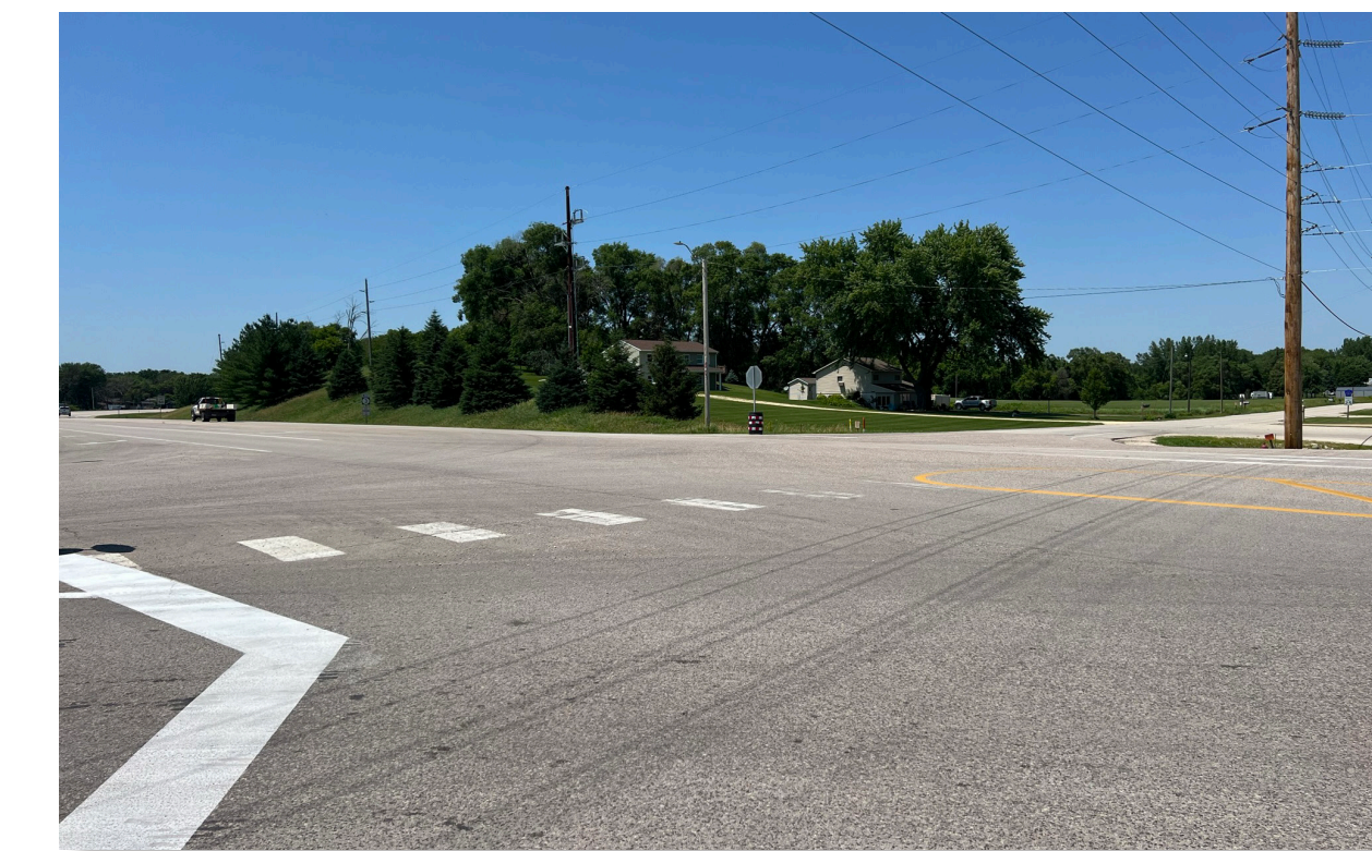
(B) Looking west on Highway 3