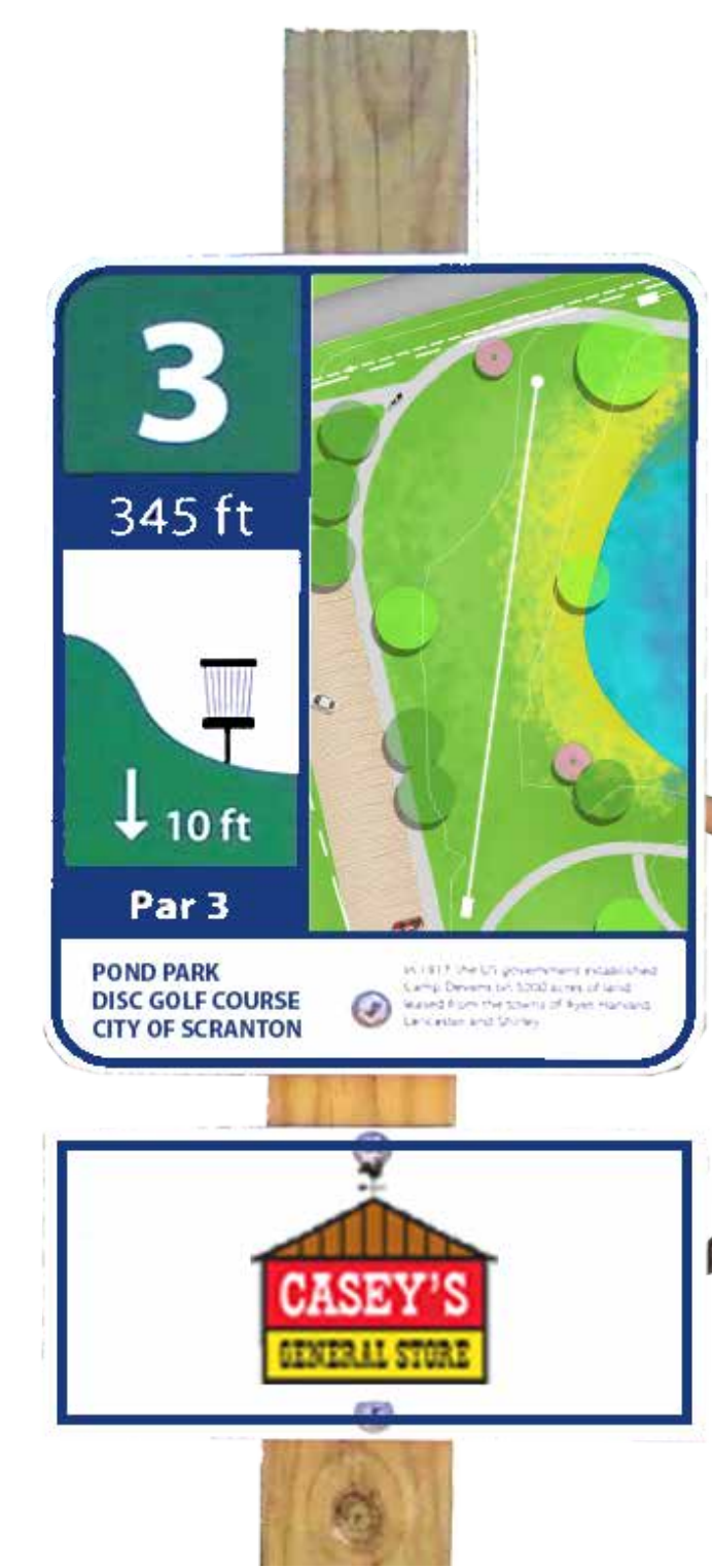
Example disc golf signage.