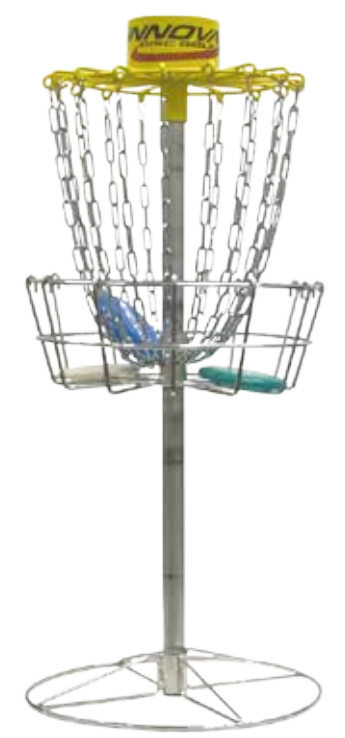
Disc golf basket.