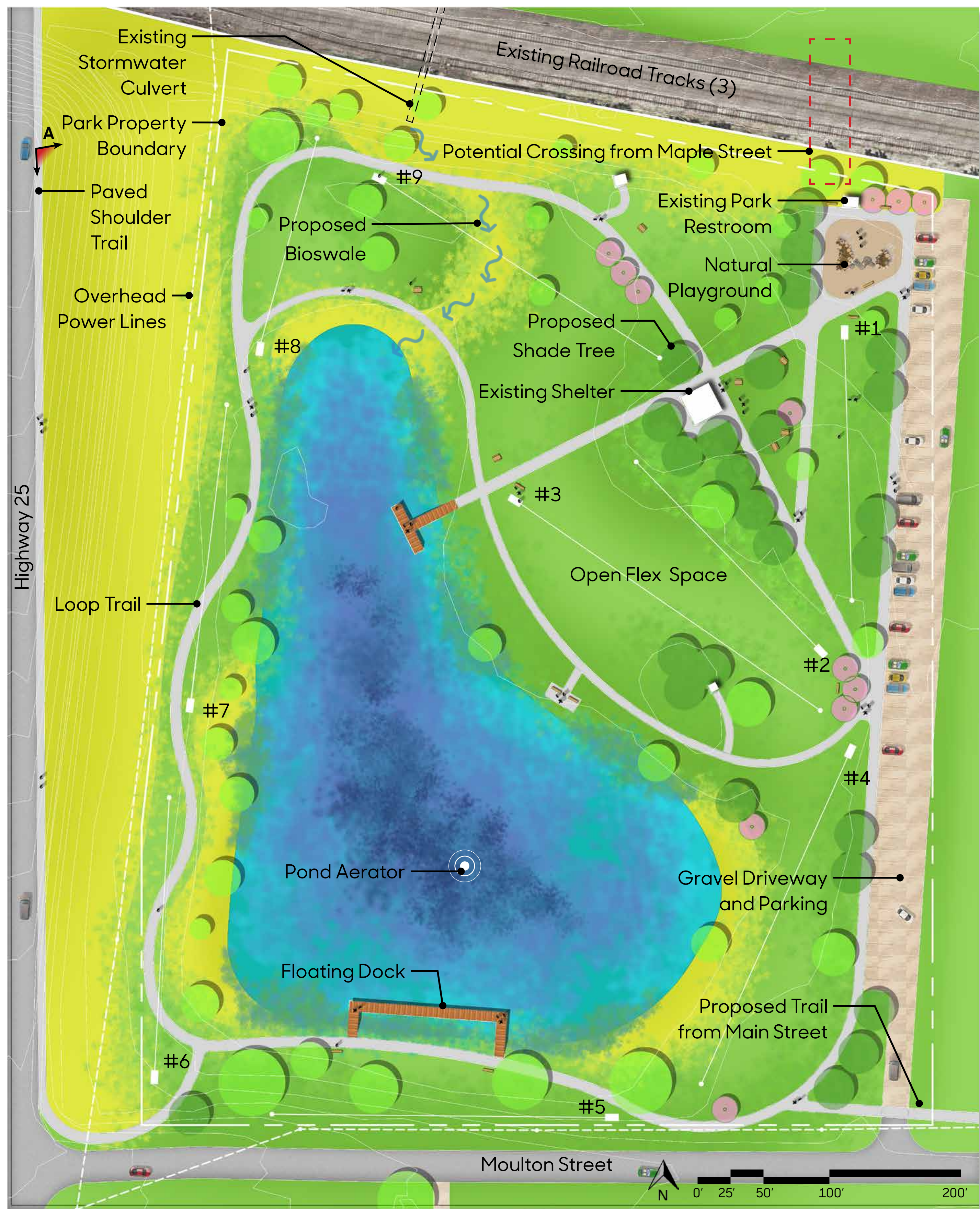
After: Improved Pedestrian Access to Pond Park from Maple Street