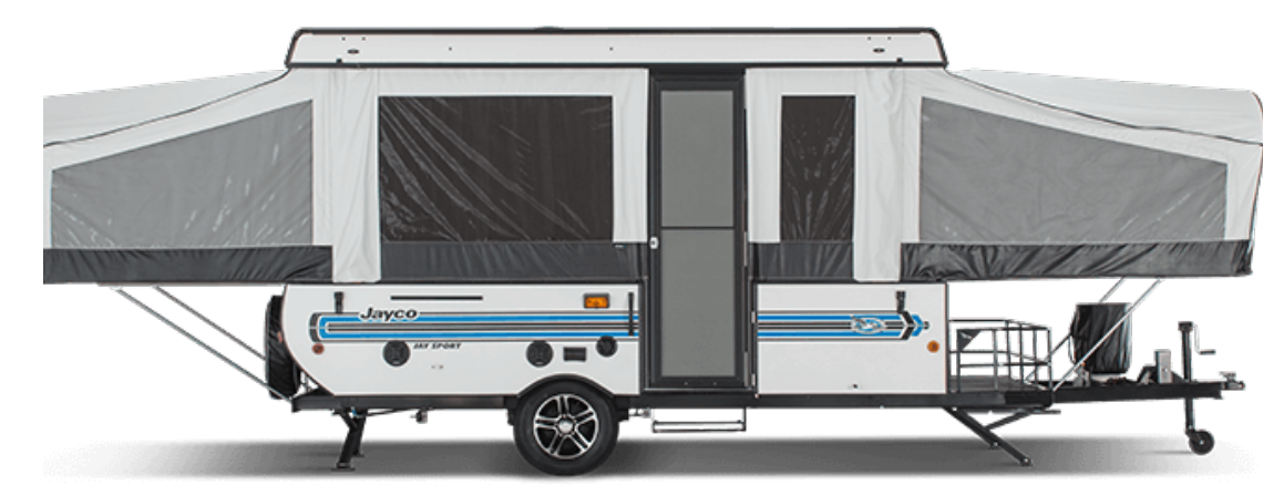
Potential camping at Pond Park.

The area often floods and is used as a stormwater detention facility. Based on the Needs Assessment, Scranton residents prefer to embellish Pond park with additional recreation features while providing a sustainable approach to stormwater needs. A nine-hole disc golf course is proposed alongside a recreation trail around the pond. Floating docks a proposed to bring users closer to the water. A pond aerator is identified to add more oxygen to its water. Additionally, the option of public camping at the park shall be carefully considered, but is a viable possibility.