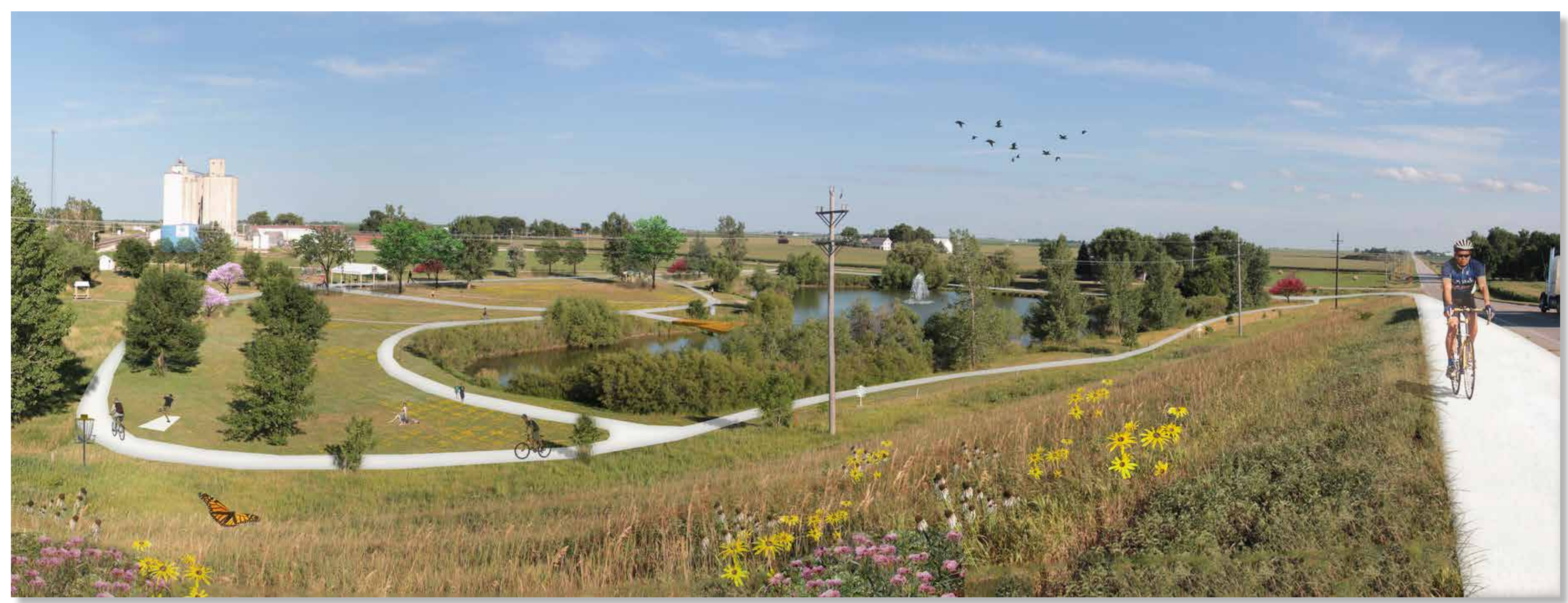
Perspective A: Pond Park with proposed trail routing as see from the viaduct. Pending future viaduct improvements, a paved shoulder trail would be installed on the east side.