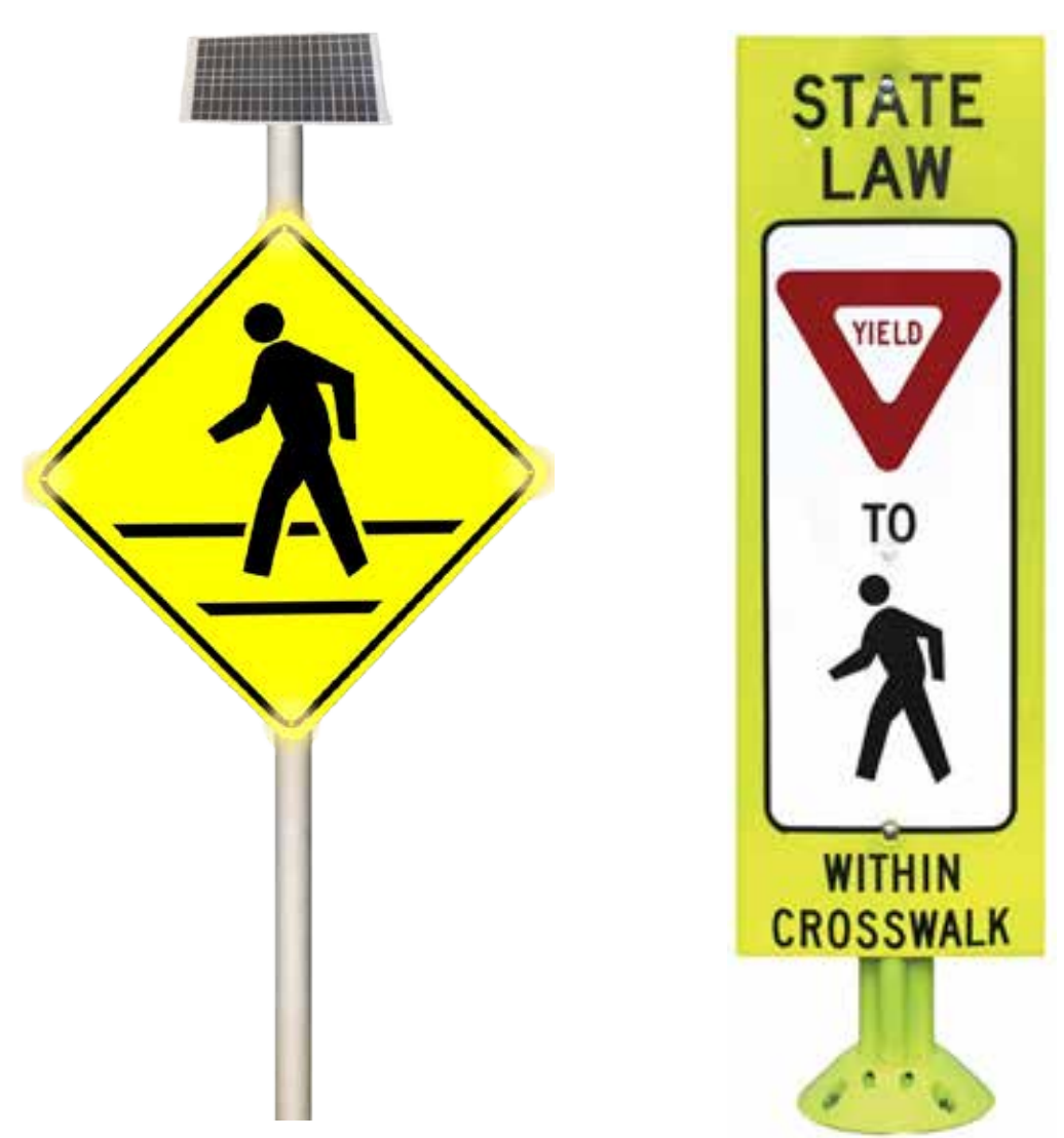
Flashing signs draw attention to pedestrians crossing as well as material changes such as brick or colorful paintings.

Providing signage that makes vehicles aware of walkers/bikers results in a much safer environment. To the right are examples of potential signs and material alterations to be used at these intersections.