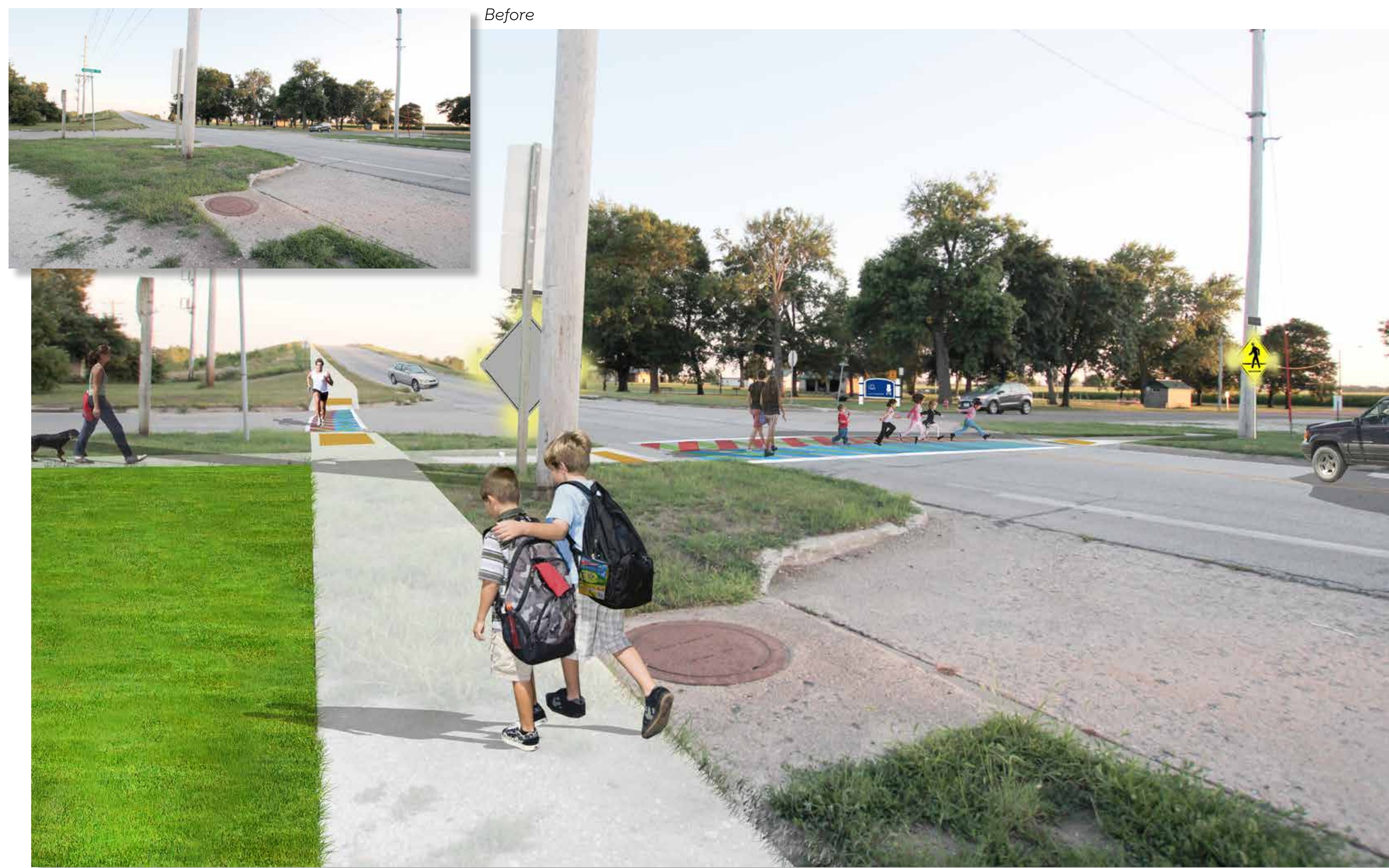
Perspective A: Proposed crossing at Highway 25 and Madison to access City Park and Casey's.