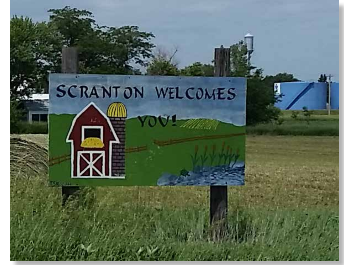
Existing South Entry Sign