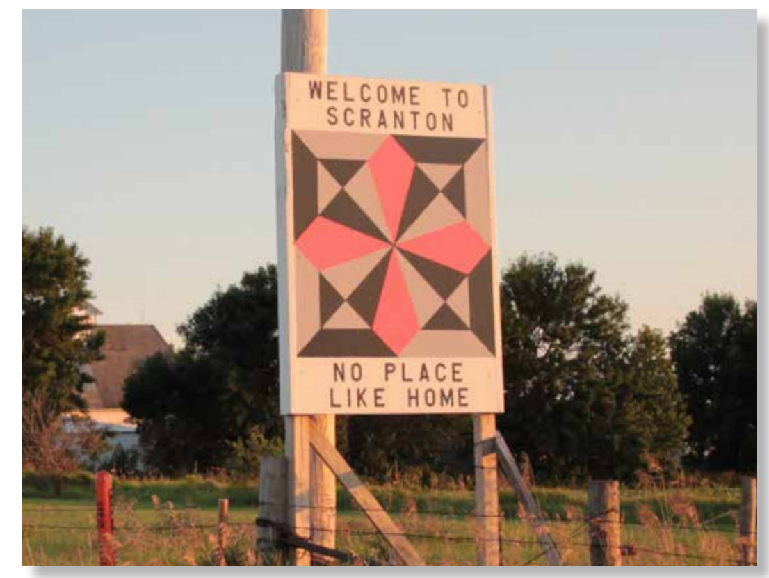
Existing North Entry Sign