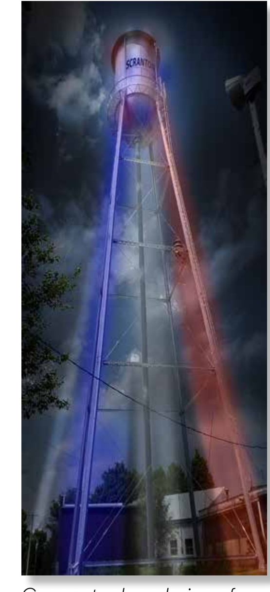
Conceptual rendering of water tower with color-changing LED lighting.

Additionally, several stormwater Best Management Practices are proposed along the Main Street corridor. As seen in the perspective, one is directly in front of the water tower grounds. This is a prime opportunity to inform the public on how this technique works to mitigate flooding and provide more vegetation along the street.