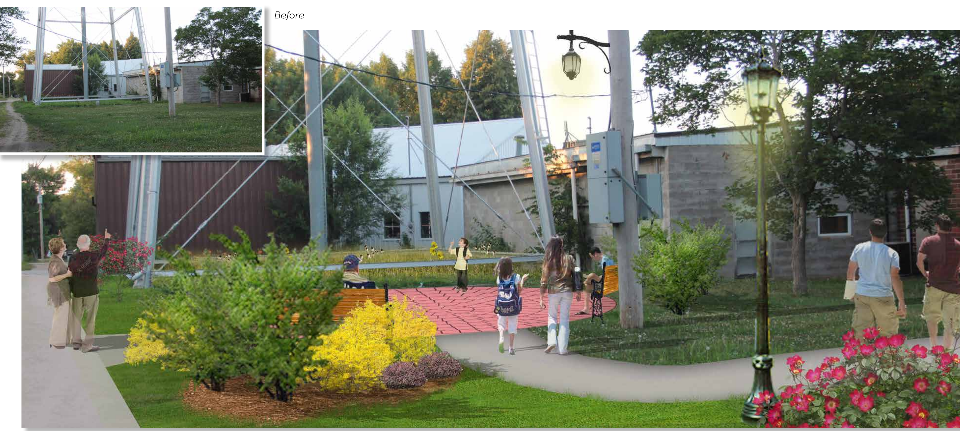
Perspective B: Seating area with plantings underneath the tower.