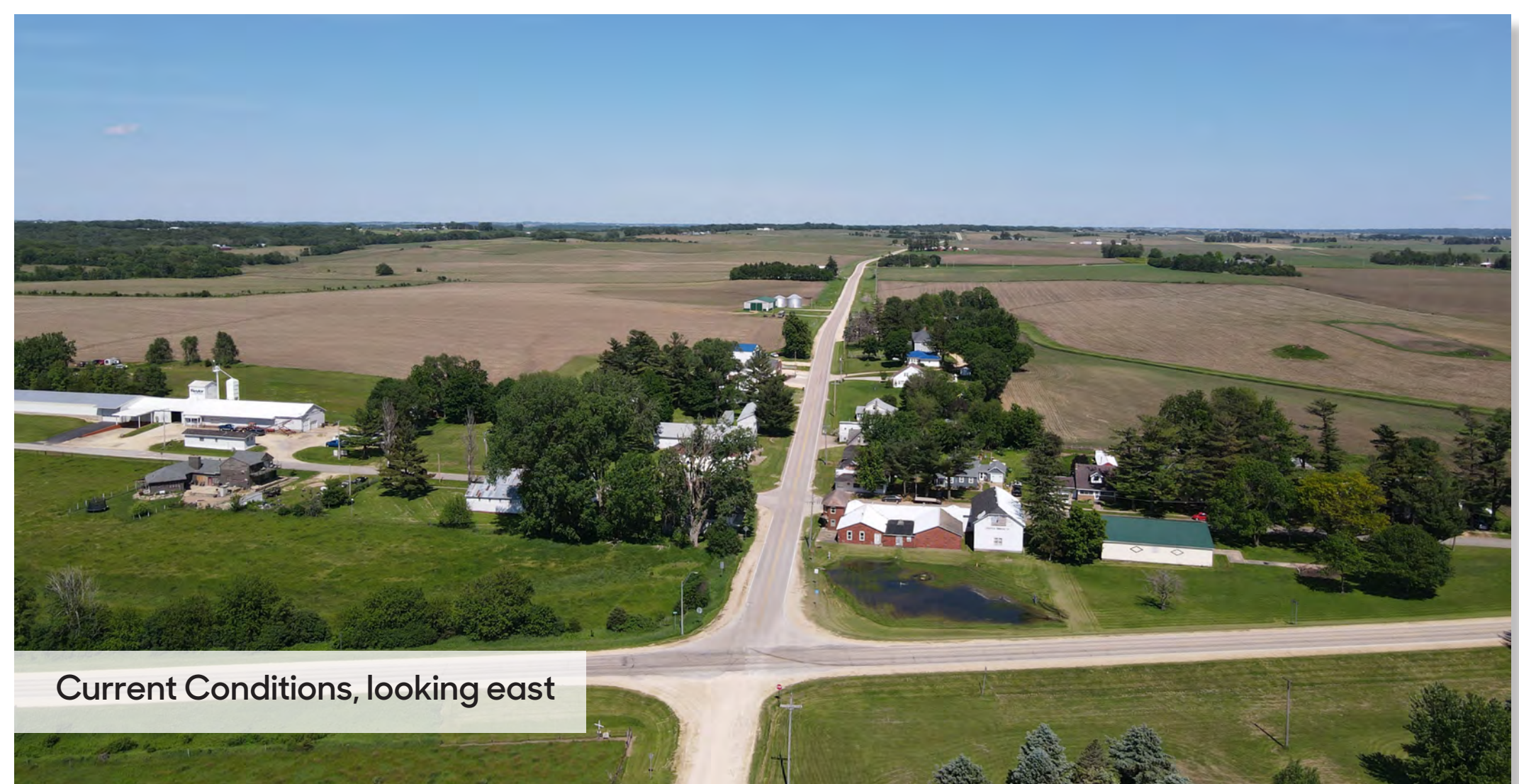
Current Conditions, looking east