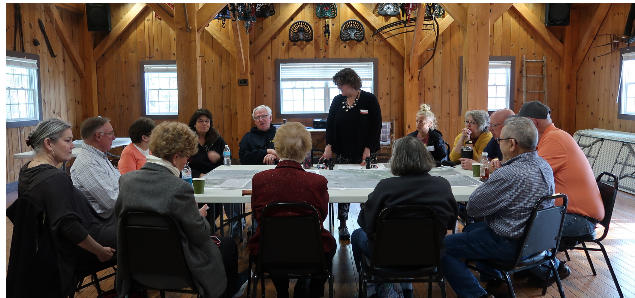
The Scotch Grove focus groups engaged four user types (older adults, active users, parents, and the steering committee) on transportation-related issues.

Scotch Grove is unique in that it is the second unincorporated community to participate in the Community Visioning Program and the first community to approach the program from both a village and township scale. With this position, in coordination with the steering committee members, Trees Forever, and the Community Visioning team, the design team took special consideration in gathering feedback and input on the three priority projects. A recap of the Community Visioning process shows where and how this content was gathered; all of which informed the content found on the following boards. The project is broken up into three main phases over the course of one year.