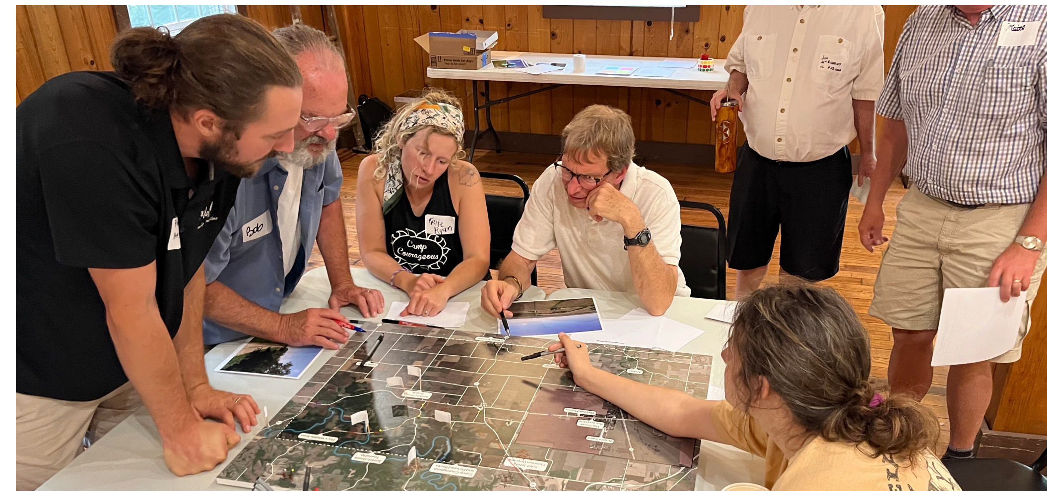
During the design charrette portion of the design workshop, residents drew and mapped their ideas for the three priority projects directly onto maps of the village and township.

Assessments and Program Overview meeting where the design team and Trees Forever met with members of the steering committee to review the content that had been discussed up to this point. The design team held the 30 June 2022 design workshop at Camp Courageous and invited members of the community to participate. The design team developed four interactive activities based on the three priority projects (a regional trail system, the Village Crossroads, and Historic Depot Park) identified by the steering committee in phase one. The activities included: community input questions, "Time and Place Mapping," a design charrette, and ranking the three priority projects using the nominal group method.