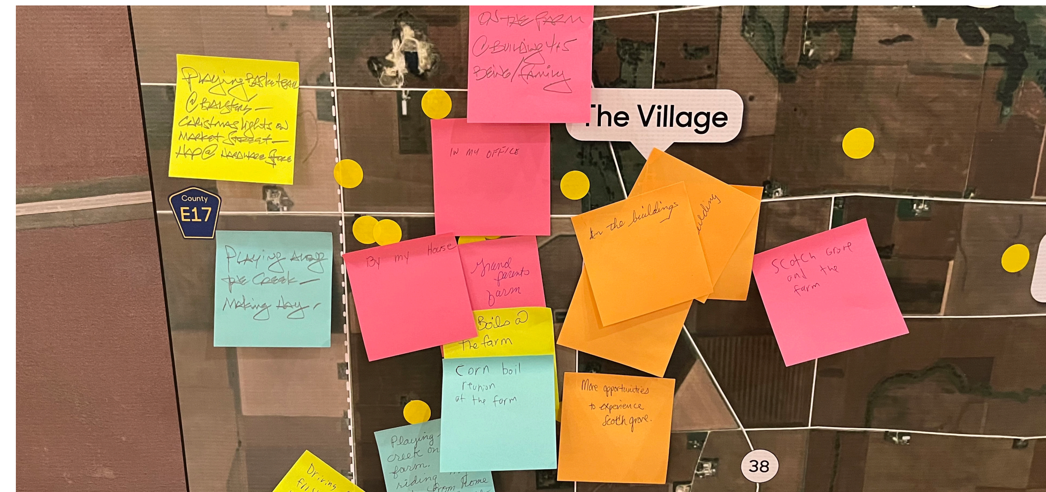
During the "Time and Place mapping" portion of the design workshop, Scotch Grove residents were invited to indicate their family, geographic, and anecdotal histories of the Scotch Grove Township.