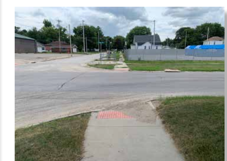
Bottom: Existing conditions show no pedestrian safety measures in place