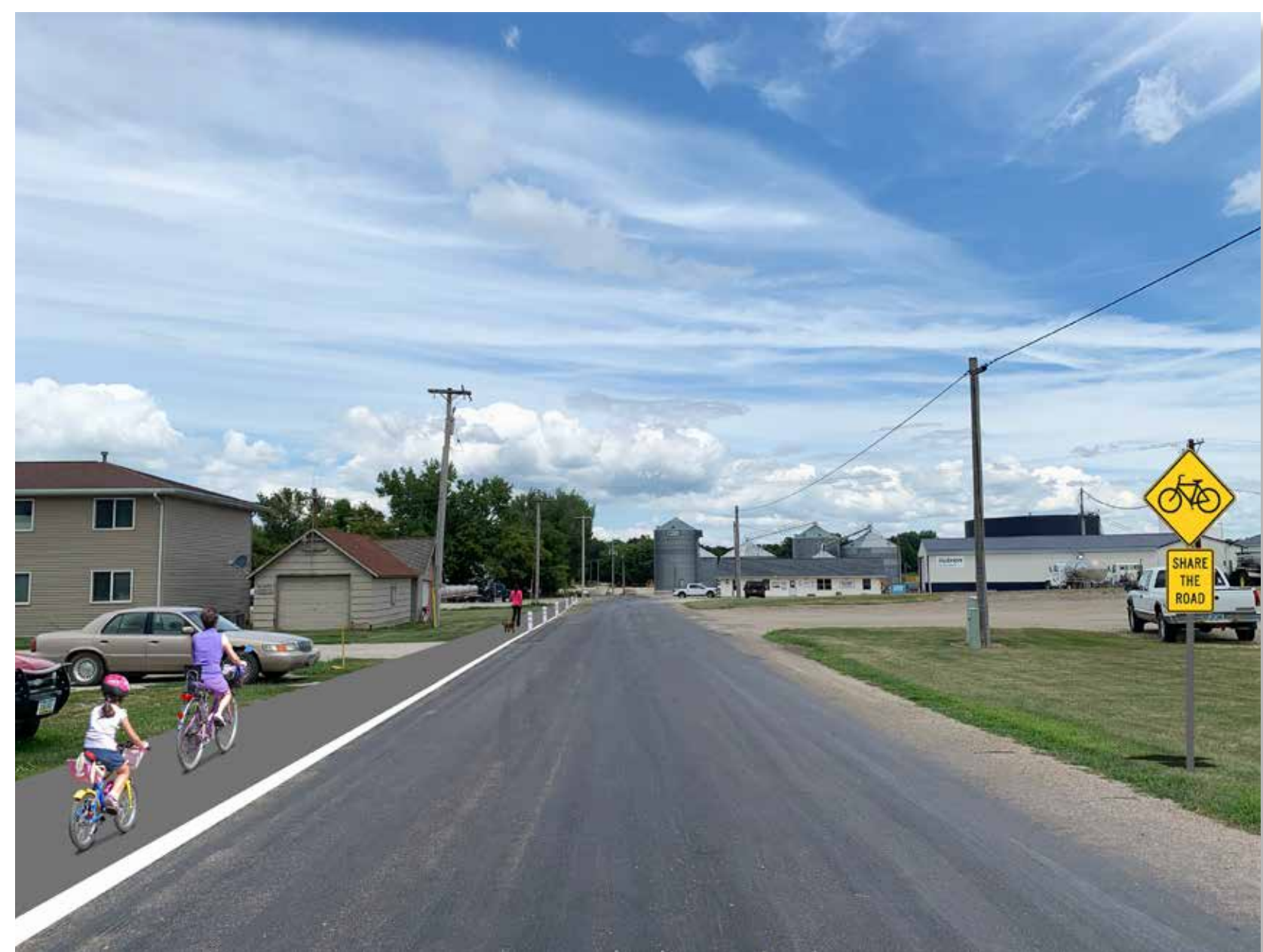
(A) Left: Proposed designated pedestrian lane to Strohbahn Park and Pioneer Trailhead with bollards to protect pedestrians from truck traffic to the east