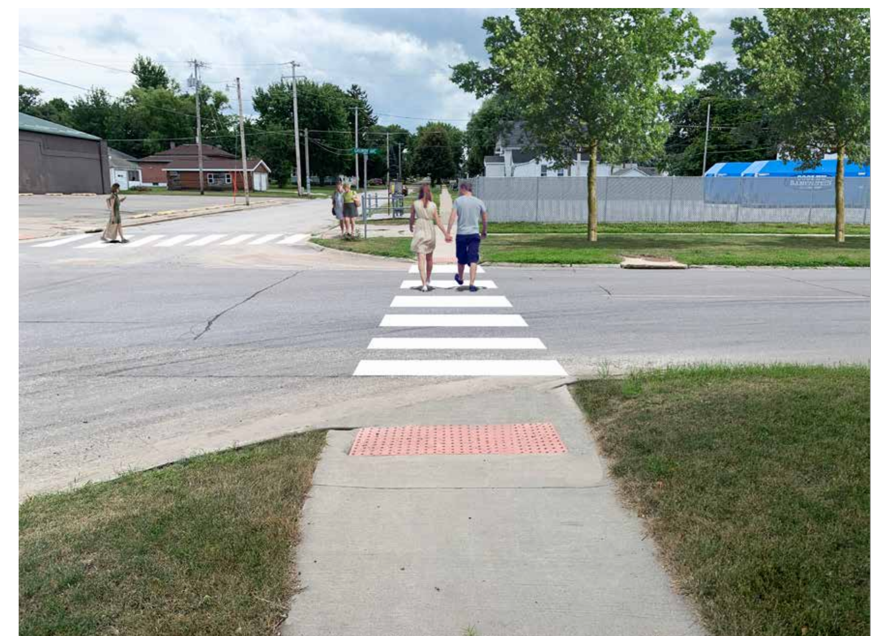
(B) Left: Proposed designated pedestrian crossing on U.S. Highway 175 to Strohbahn Park and Pioneer Trailhead