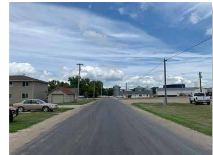
Bottom: Existing conditions show no pedestrian safety measures in place