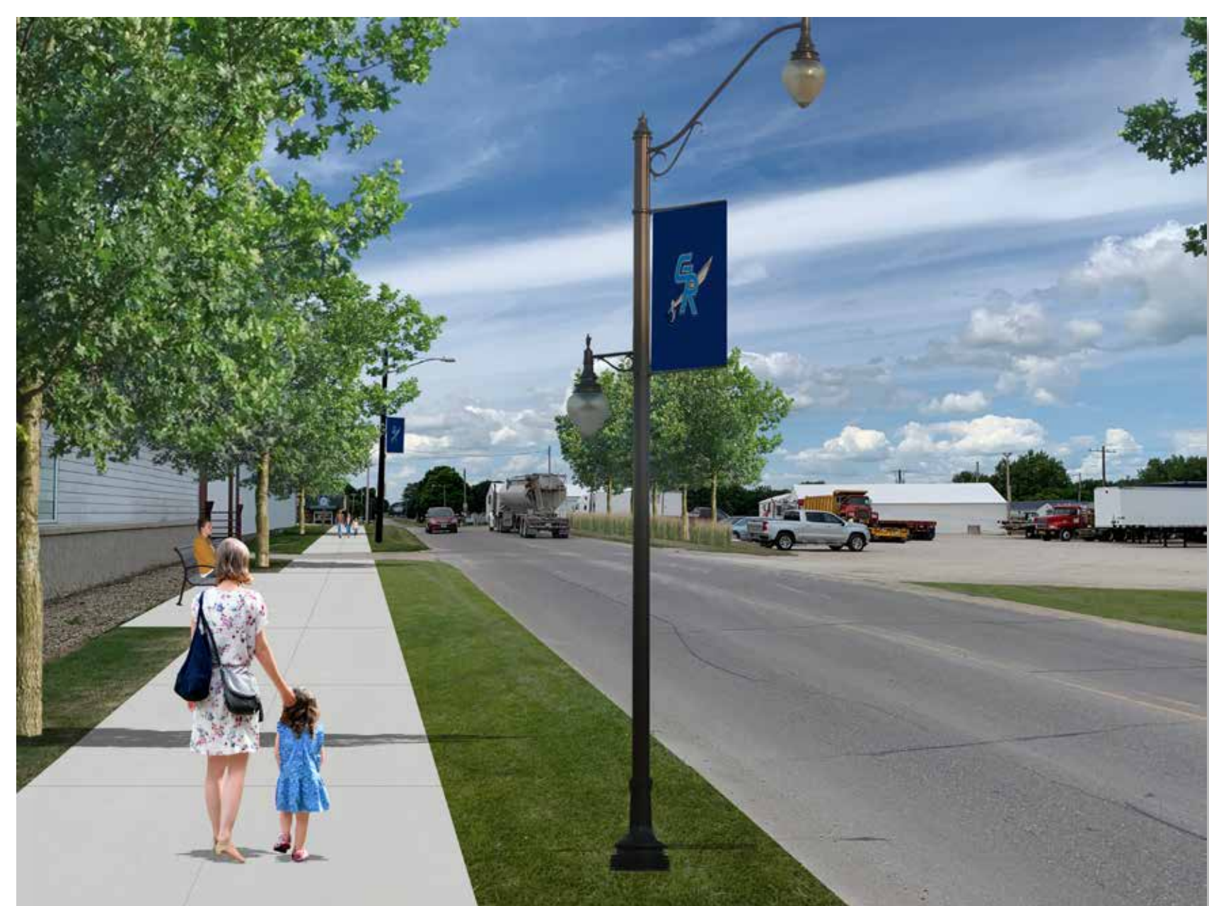
(C) Left: Proposed pedestrian corridor on the south side of U.S. Highway 175 to Broad Street Bottom: Existing conditions