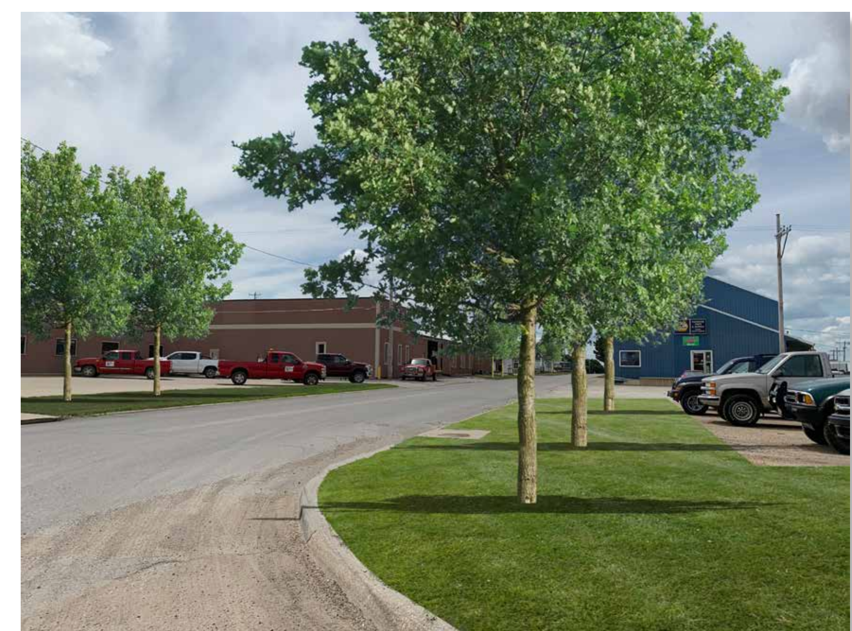
(D) Left: Proposed tree plantings and green space define the entrance and parking area Bottom: Existing conditions