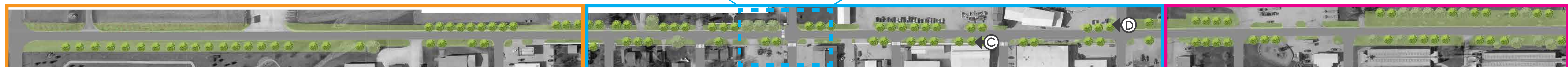
Colored frame around portions of U.S. Highway 175 represent the portion shown at a larger scale on U.S. Highway Corridor, Board 8