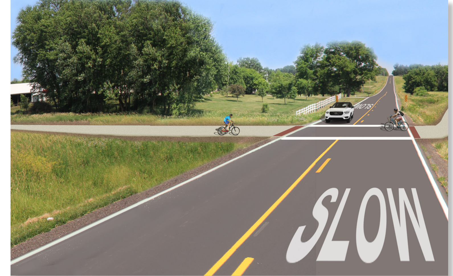
Perspective B: NW 126th Ave

to the Neal Smith Trail if they're heading south on the High Trestle Trail, and would also create an accessible connection to the new Big Creek Technology Campus.