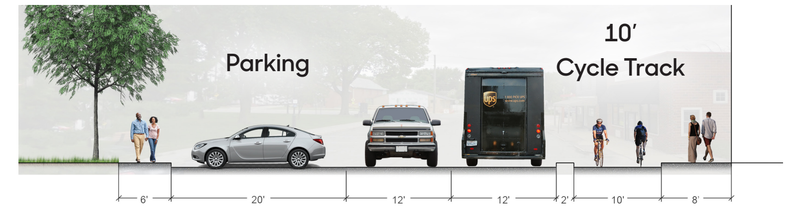
Broadway Section A-A'