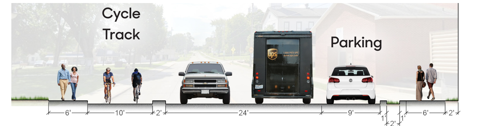
3rd St Section B-B'