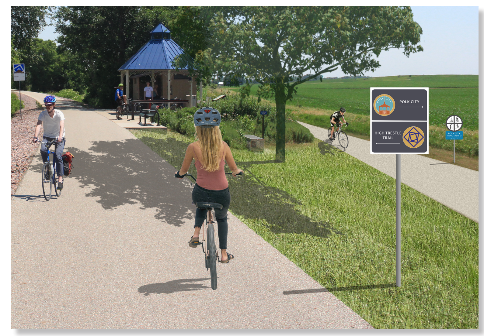
Perspective A: Polk City Trail at Oasis