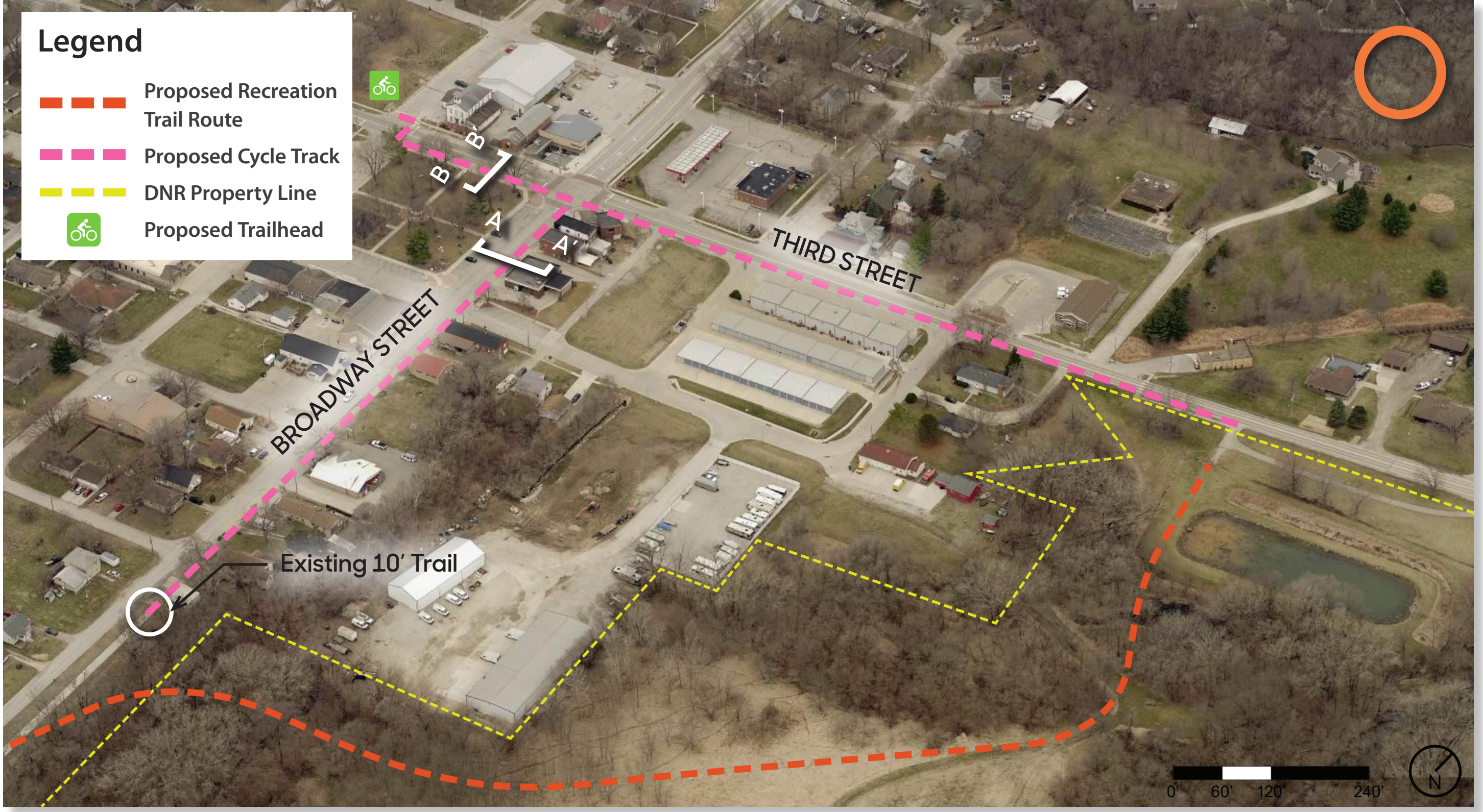
Broadway and 3rd Axon