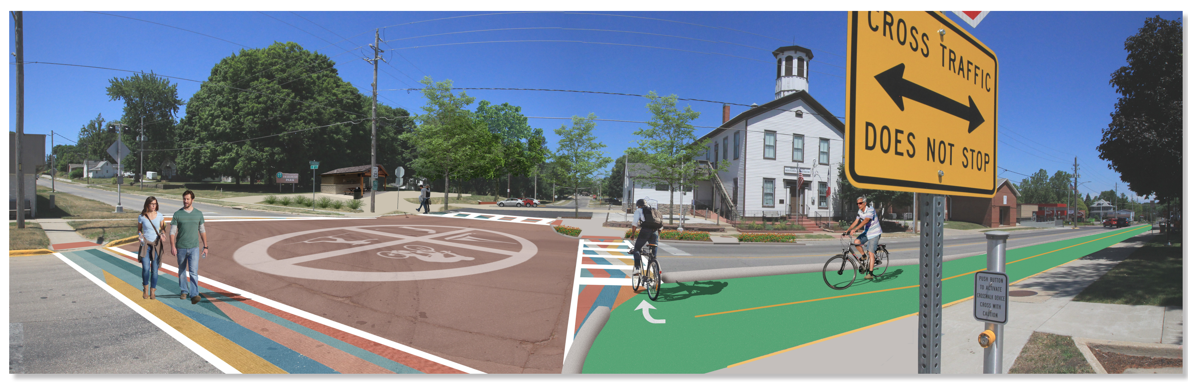
Trailhead and Cycle Track Perspective