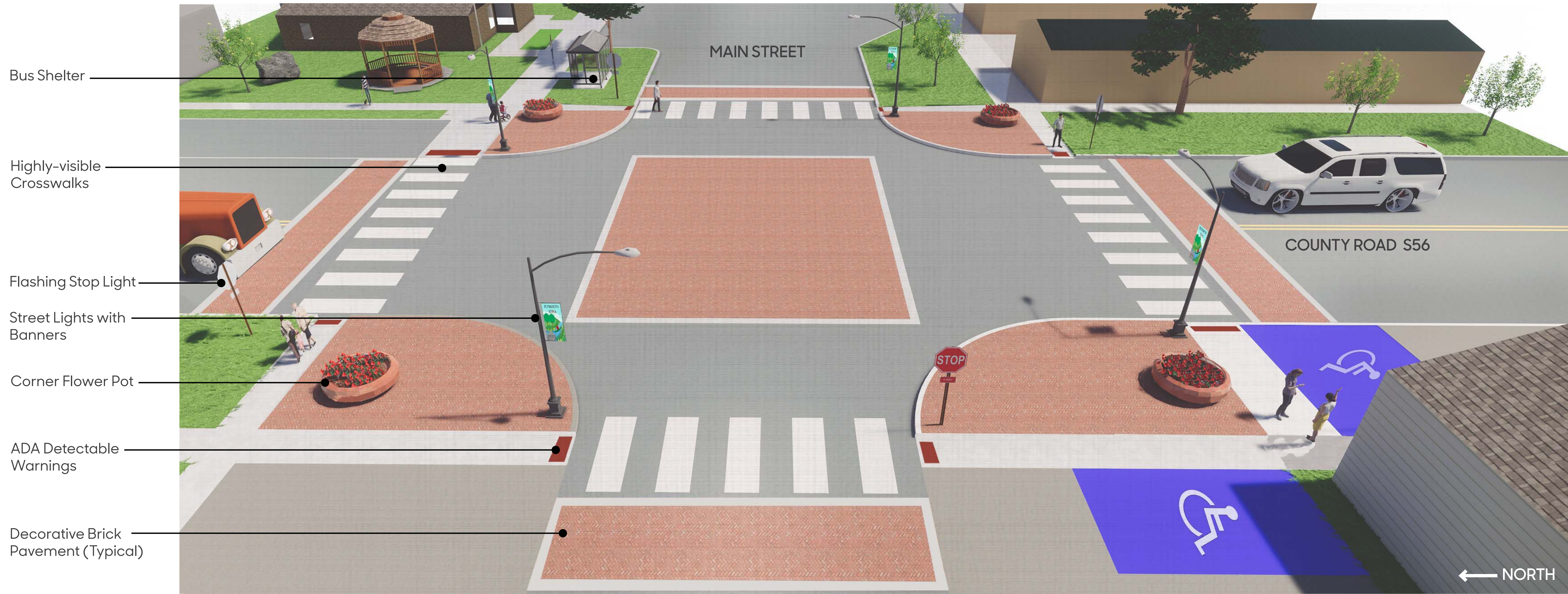
Proposed improvements to the intersection of Main Street and County Road S56