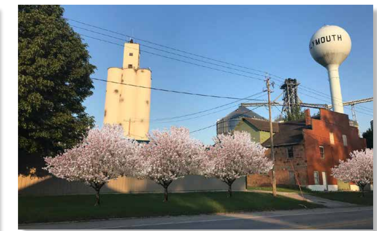
Proposed ornamental tree plantings under the power lines along County Road S56