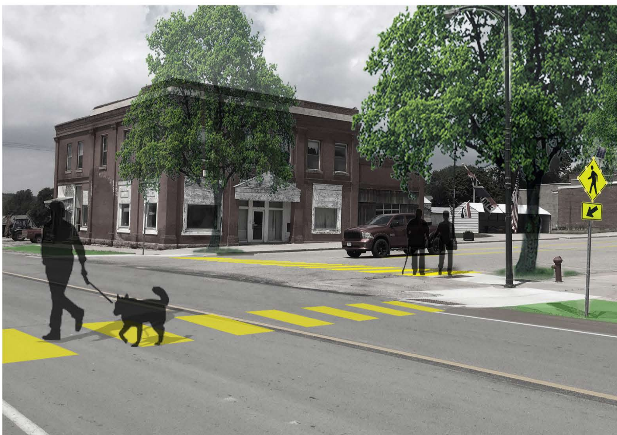
HWY 10 Looking Northwest