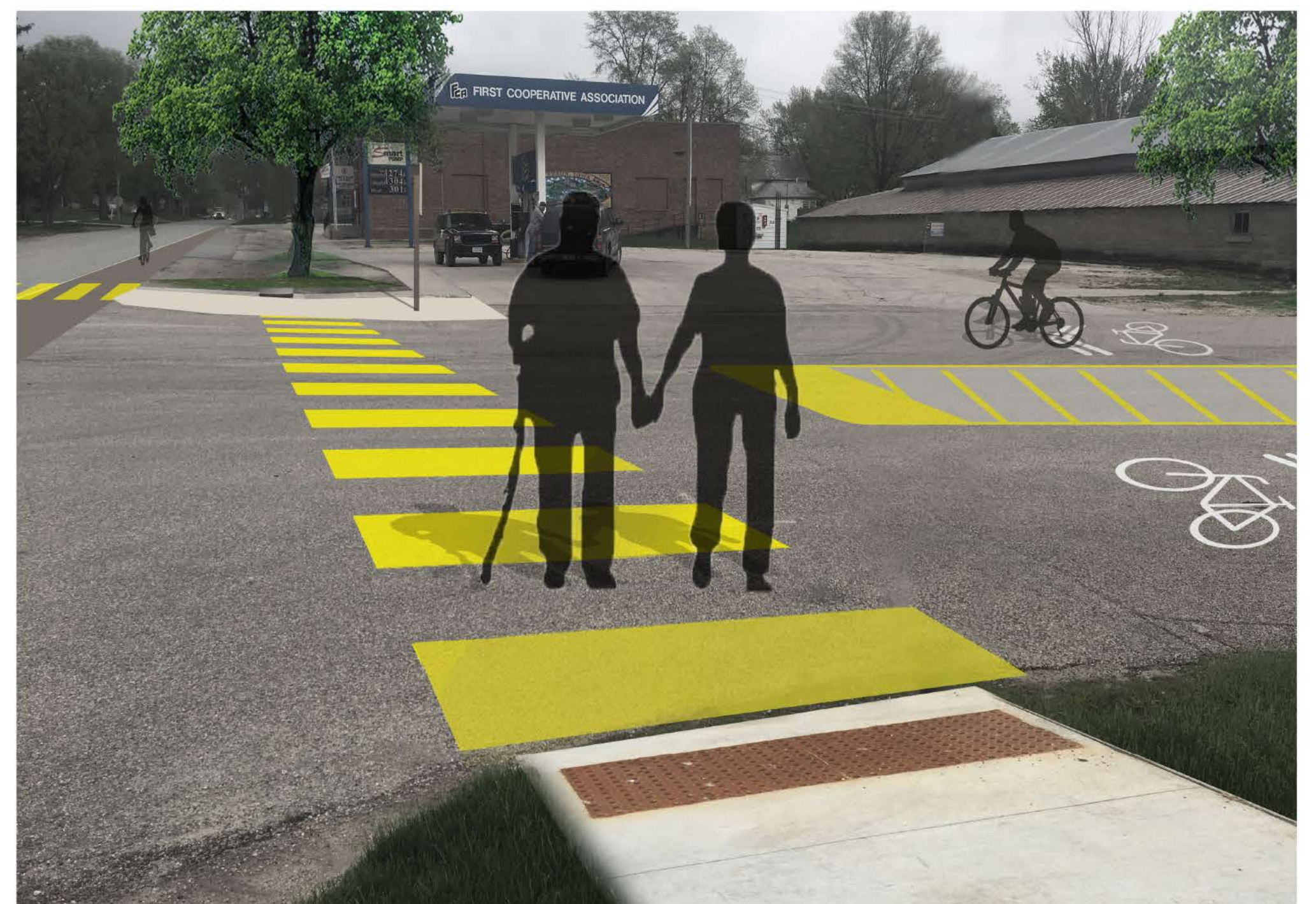
South Side of Main Street Looking East