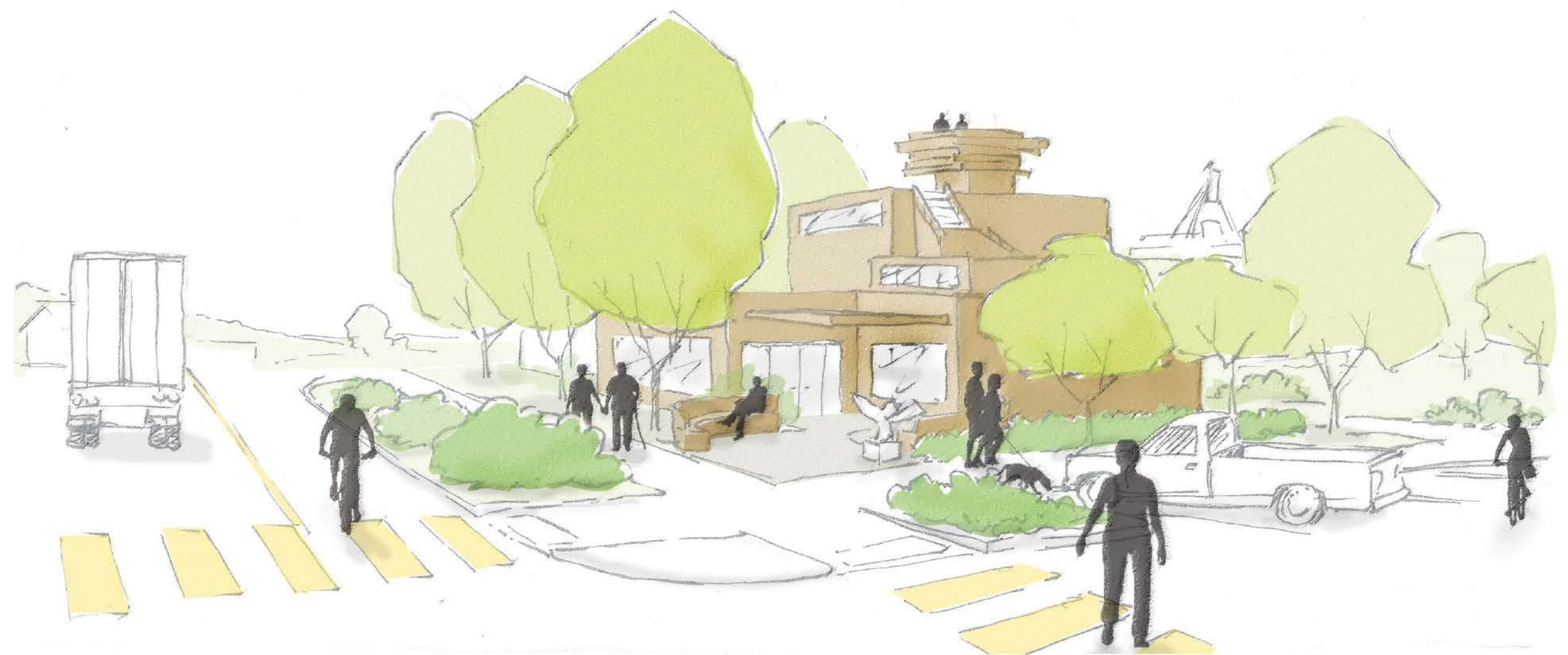
MAIN STREET CORNER WITH COMMUNITY BUILDING