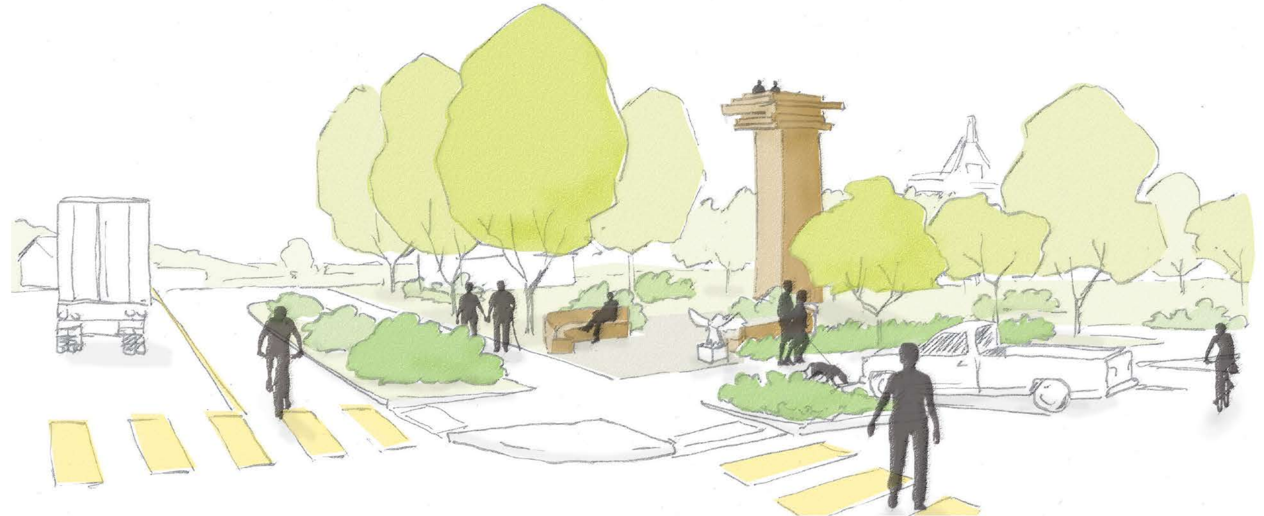
MAIN STREET CORNER WITH OPEN PLAZA AND TOWER

Establishing the corner of HWY 10 and Main Street as a civic space will ensure its longevity and importance within the community. This could be accomplished through a park space that builds on the community identity and contains a key attraction such as the tower. It could also become a civic building such as a community center, city hall or fire station. Each of these structure concepts could retain the plaza, surrounding gardens and benches. They could also incorporate the tower look out into the structure and provide a sheltered area for students to wait for the bus.