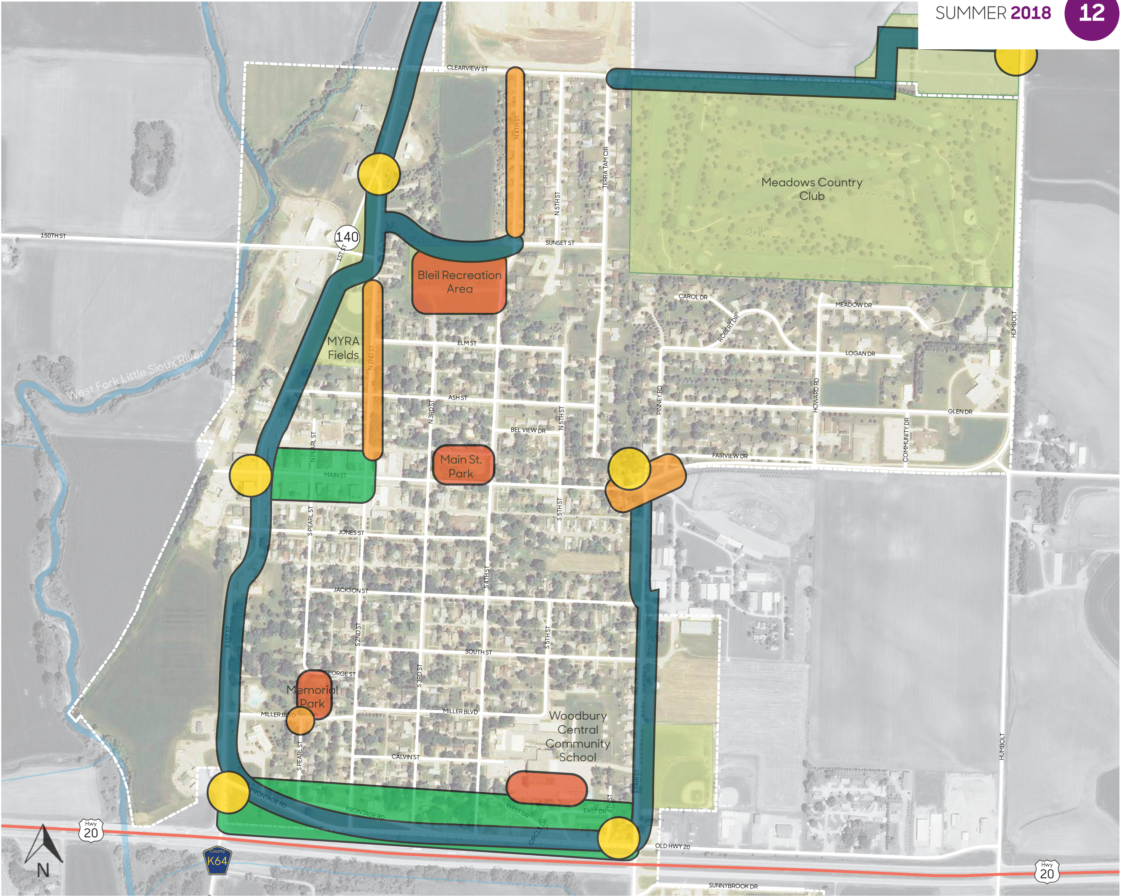
Moville map highlighting the Community Visioning Project Areas - Not to Scale.