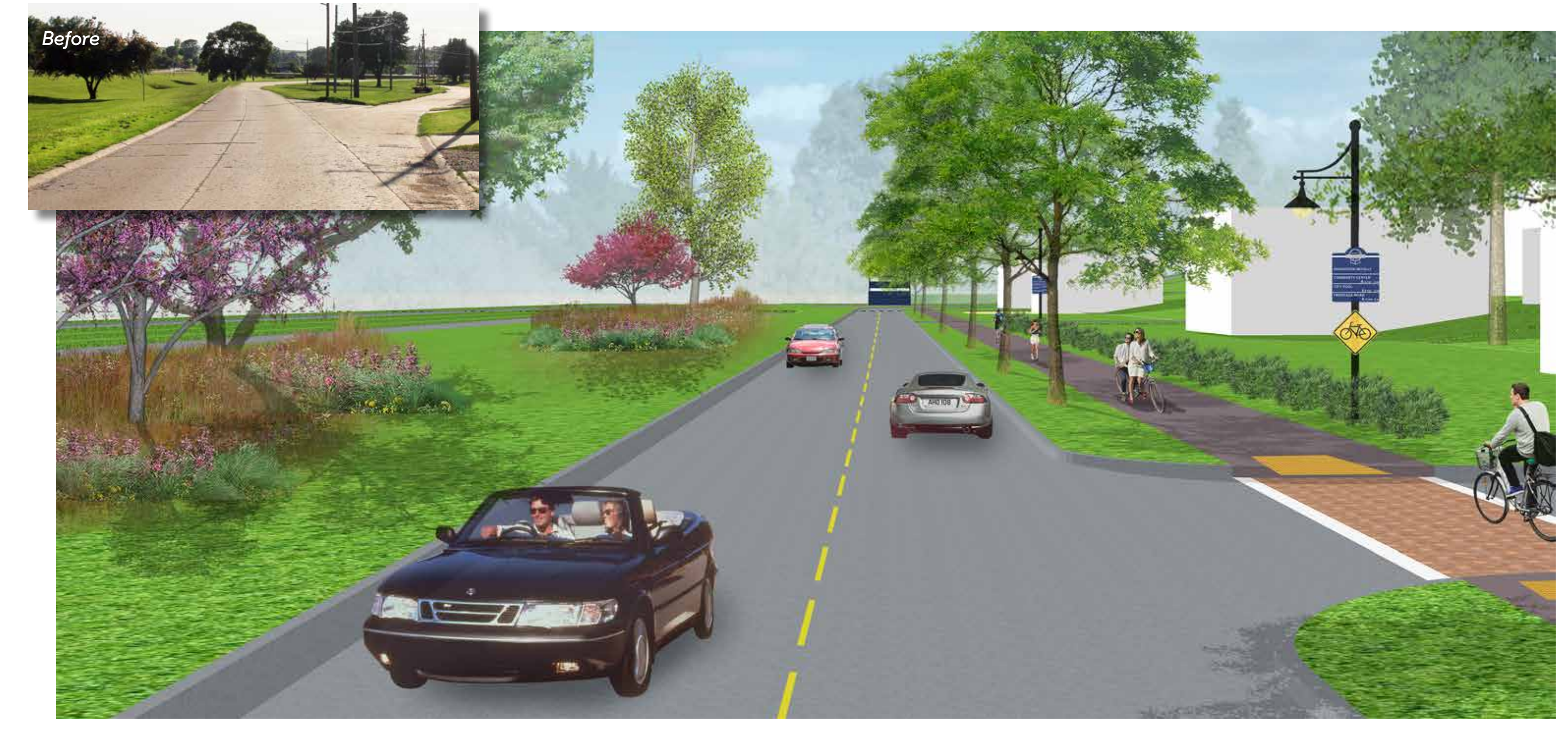
Perspective A showing proposed reorganization of Frontage Road looking west towards Pearl Street with a separated bike lane and way-finding signage.