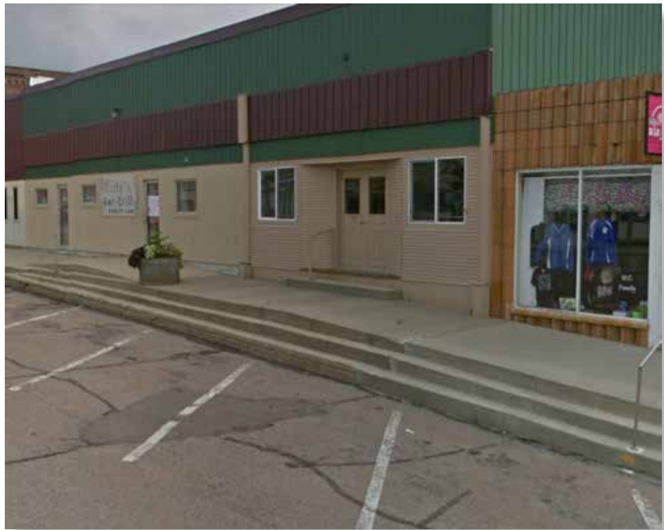
Perspective A showing the existing streetscape condition with steps.