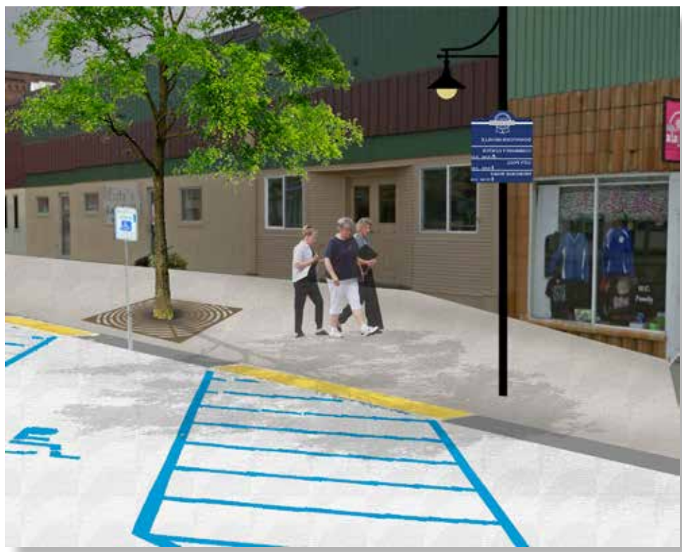
Proposed streetscape conditions with no steps by raising the elevation along the south side of Main Street.