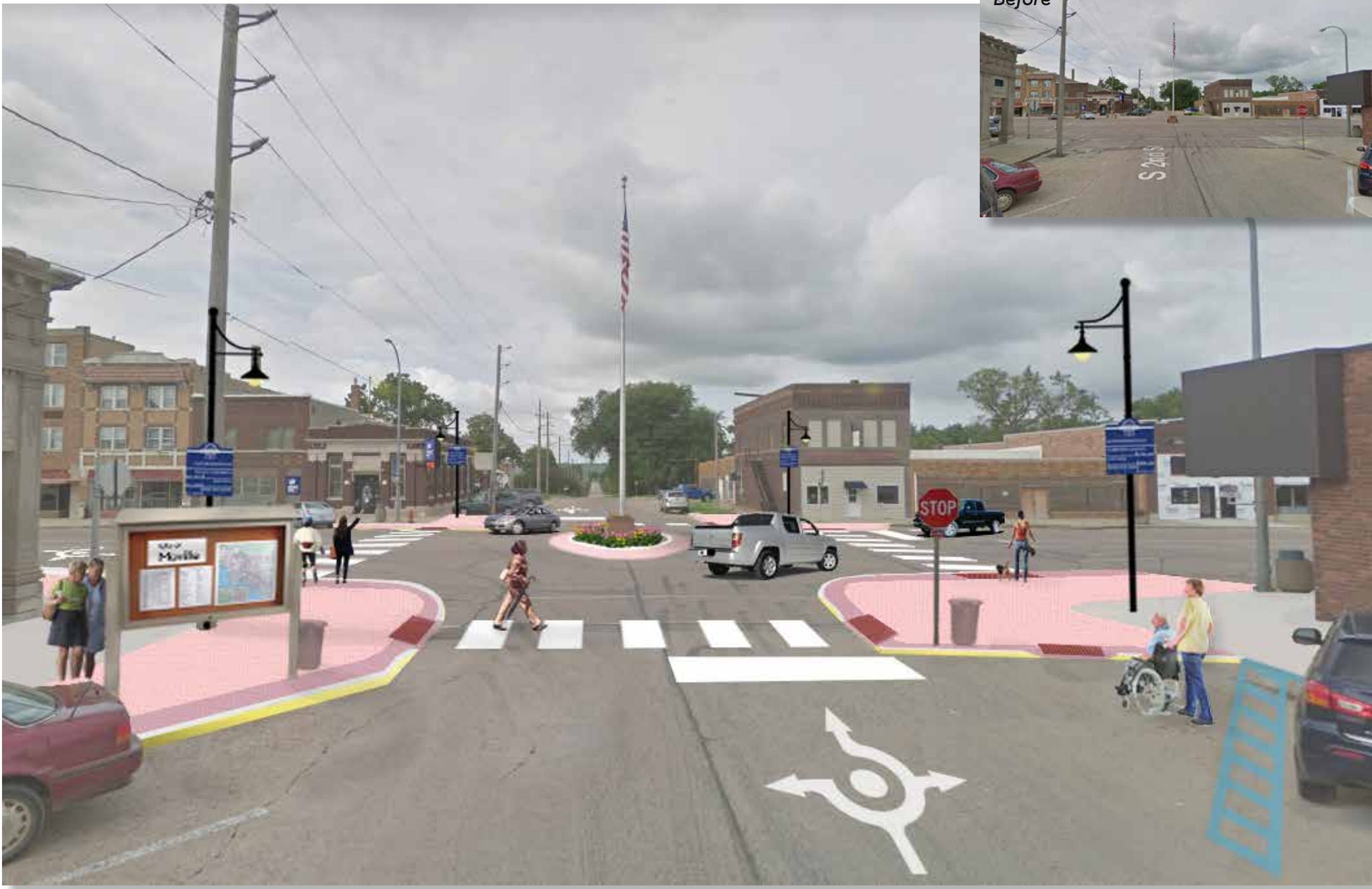
Perspective B looking north showing proposed bumpouts and way-finding signage at 2nd and Main Streets.